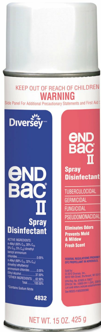
Image: Front view of the Diversey End Bac II Spray Disinfectant aerosol can, showing the brand logo and product name.