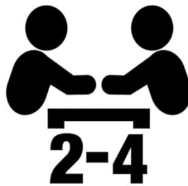
Image: An overview of the game setup, indicating the recommended age of 8+ and player count of 2-4.