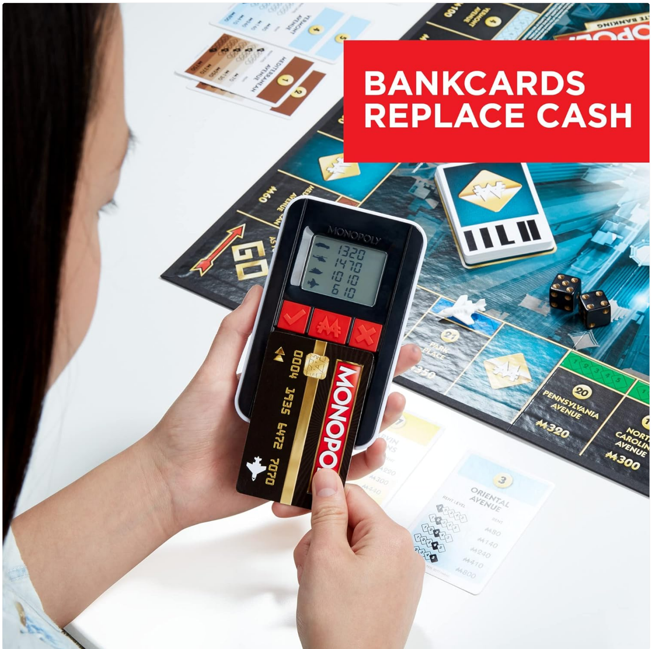
Image: A player interacting with the electronic banking unit, demonstrating how bank cards replace traditional cash.