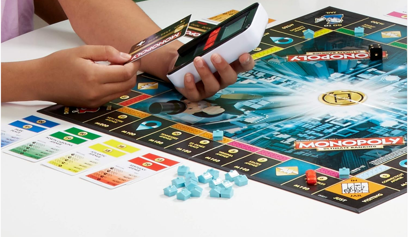
Image: Two children engaged in gameplay, using the all-in-one banking unit to manage their transactions.