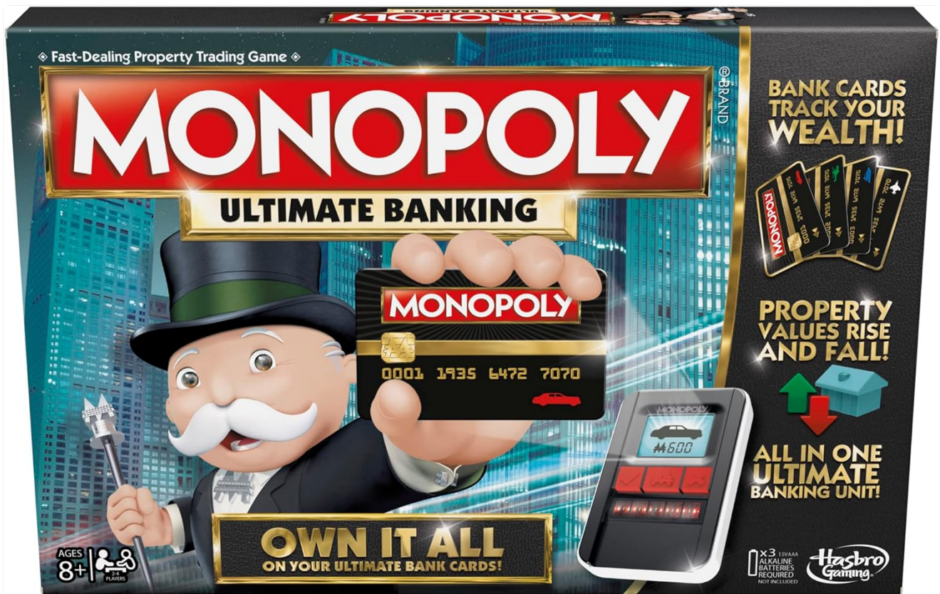
Image: The Monopoly Ultimate Banking Edition game box, highlighting the electronic banking unit and the concept of bank cards replacing cash.