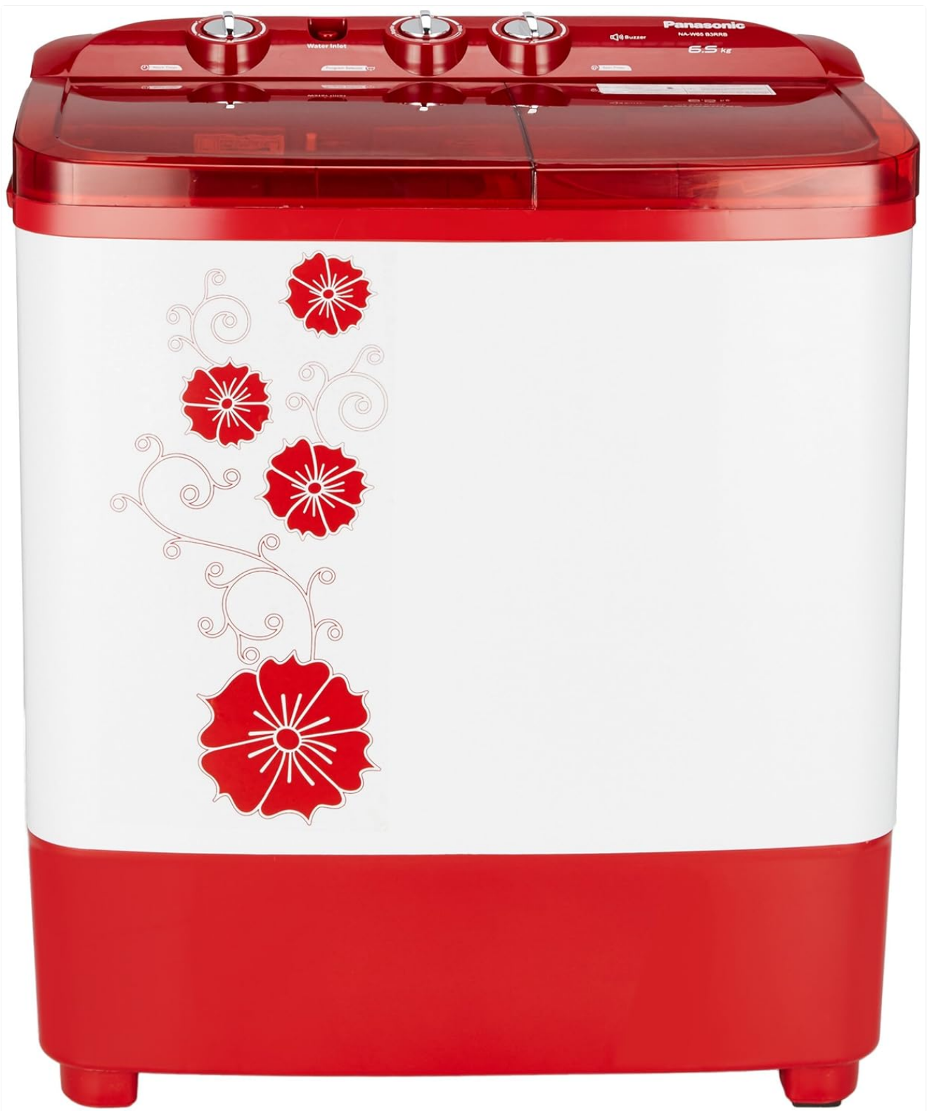
Image 1.1: Front view of the Panasonic NA-W65B3RRB washing machine, showcasing its red and white design with floral patterns and top-mounted control panel.