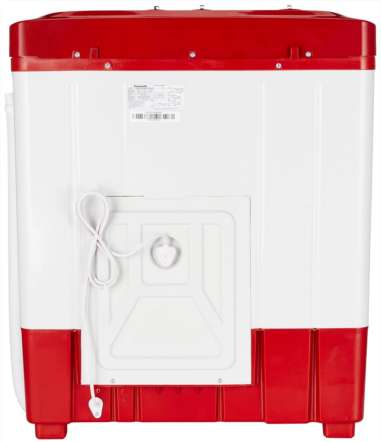
Image 4.2: Rear view of the washing machine, illustrating the power cord and the flexible drain hose extending from the lower back.