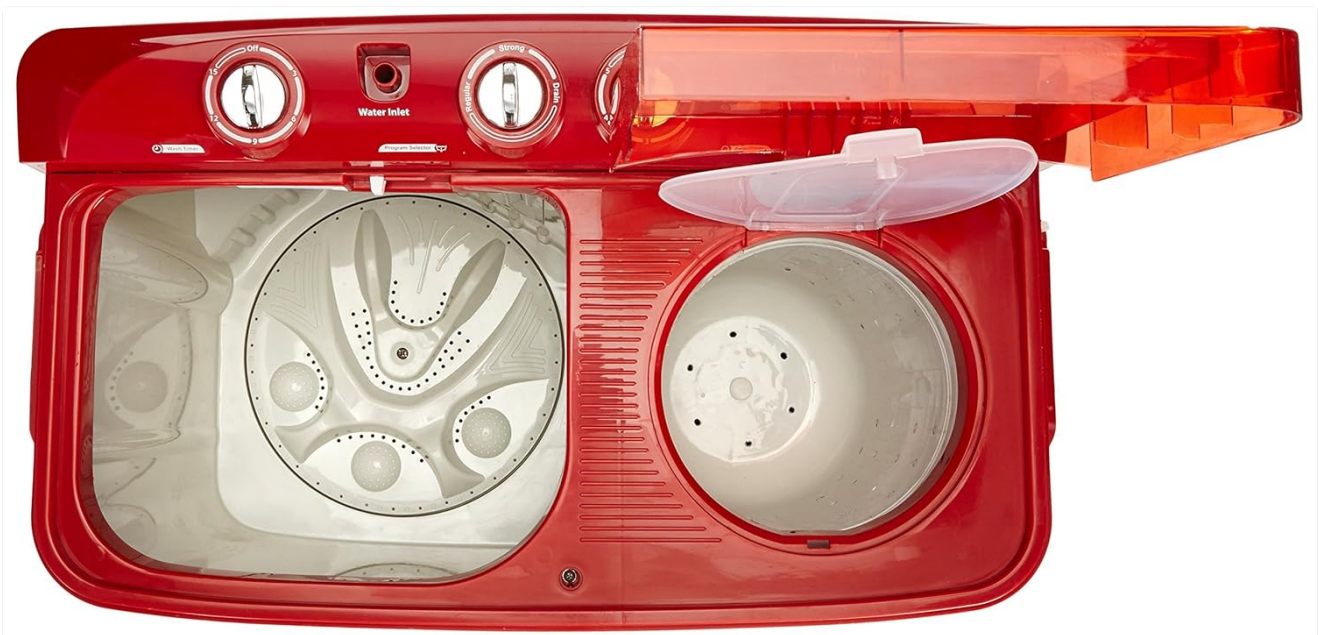
Image 3.1: Top view of the washing machine with both wash and spin tub lids open, illustrating the internal layout.