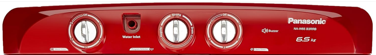
Image 3.2: Detailed view of the control panel, showing the Wash Timer, Program Selector, and Spin Timer dials, along with the water inlet.