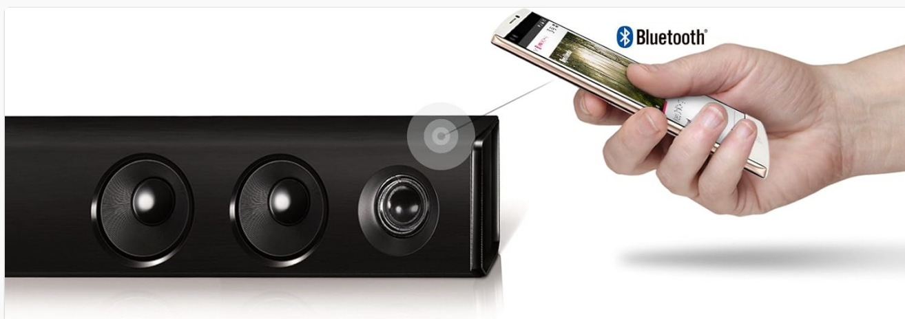
Figure 3: Connecting a smartphone to the sound bar via Bluetooth.