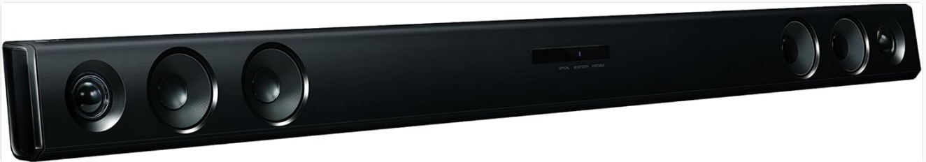
Figure 1: Front view of the LG LAS260B Sound Bar.

This user manual provides comprehensive instructions for the setup, operation, maintenance, and troubleshooting of your LG LAS260B 100 Watt 2 Channel Bluetooth Sound Bar. Please read this manual thoroughly before using the product to ensure proper and safe operation.