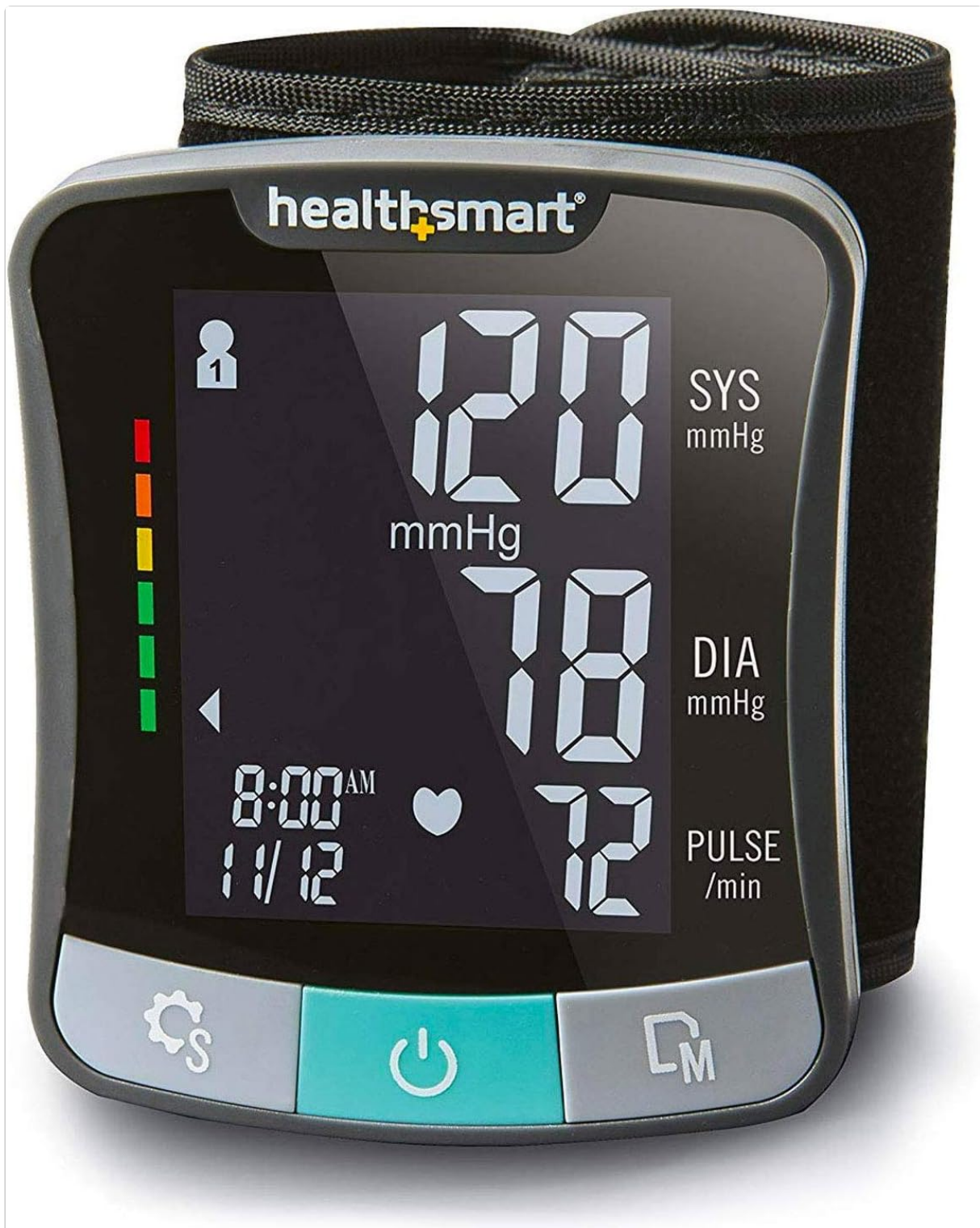
Image 1.1: The HealthSmart Digital Premium Wrist Blood Pressure Monitor, showing its display and cuff.