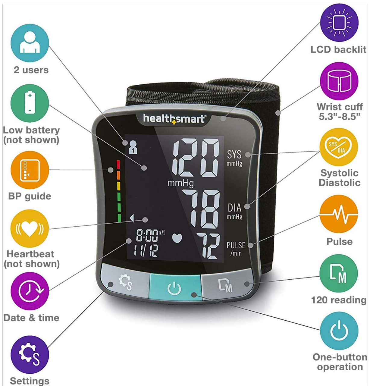
Image 3.1: Key features of the monitor, including LCD backlight, wrist cuff, systolic/diastolic readings, pulse, 120 reading memory, one-button operation, settings, date & time, heartbeat indicator, BP guide, low battery indicator, and support for 2 users.