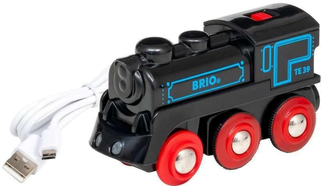
Image 1: The BRIO World 33599 Rechargeable Engine shown with its packaging, highlighting the product and its USB charging cable.