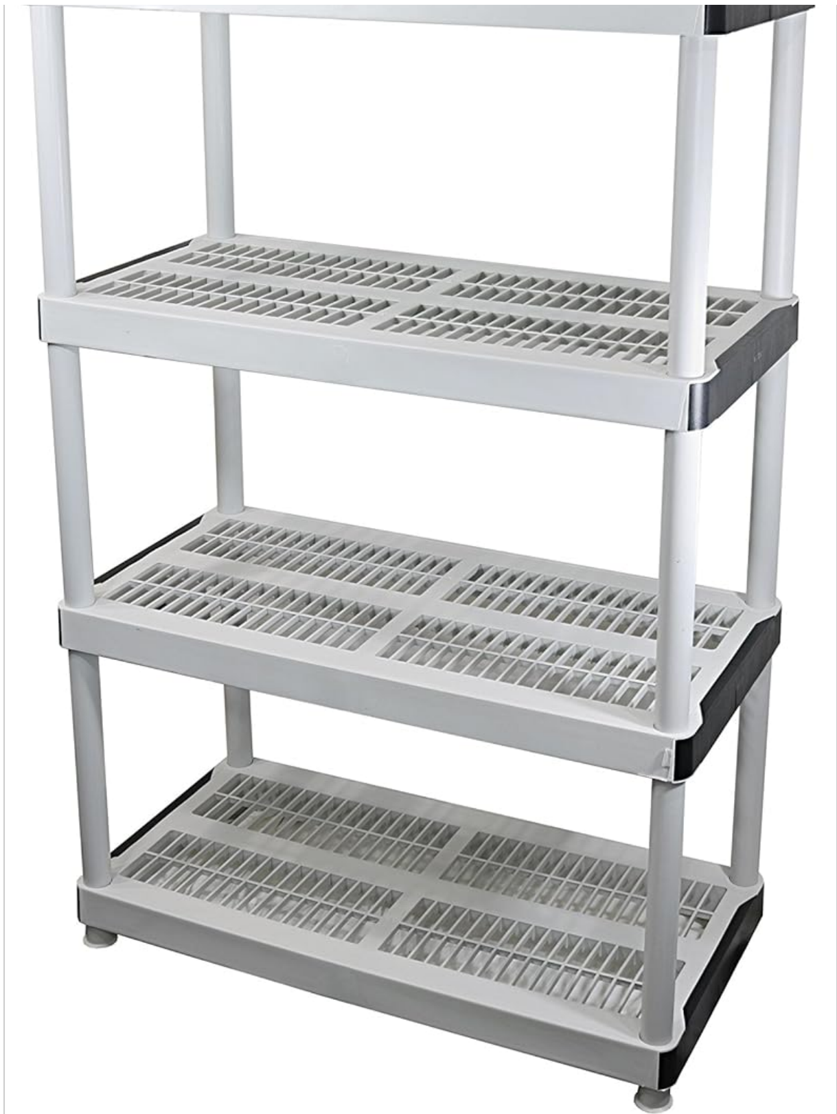
Image 1.1: The HDX 5-Tiered Ventilated Plastic Storage Shelving Unit, fully assembled. This image displays the complete shelving unit with its five ventilated shelves and sturdy plastic posts.