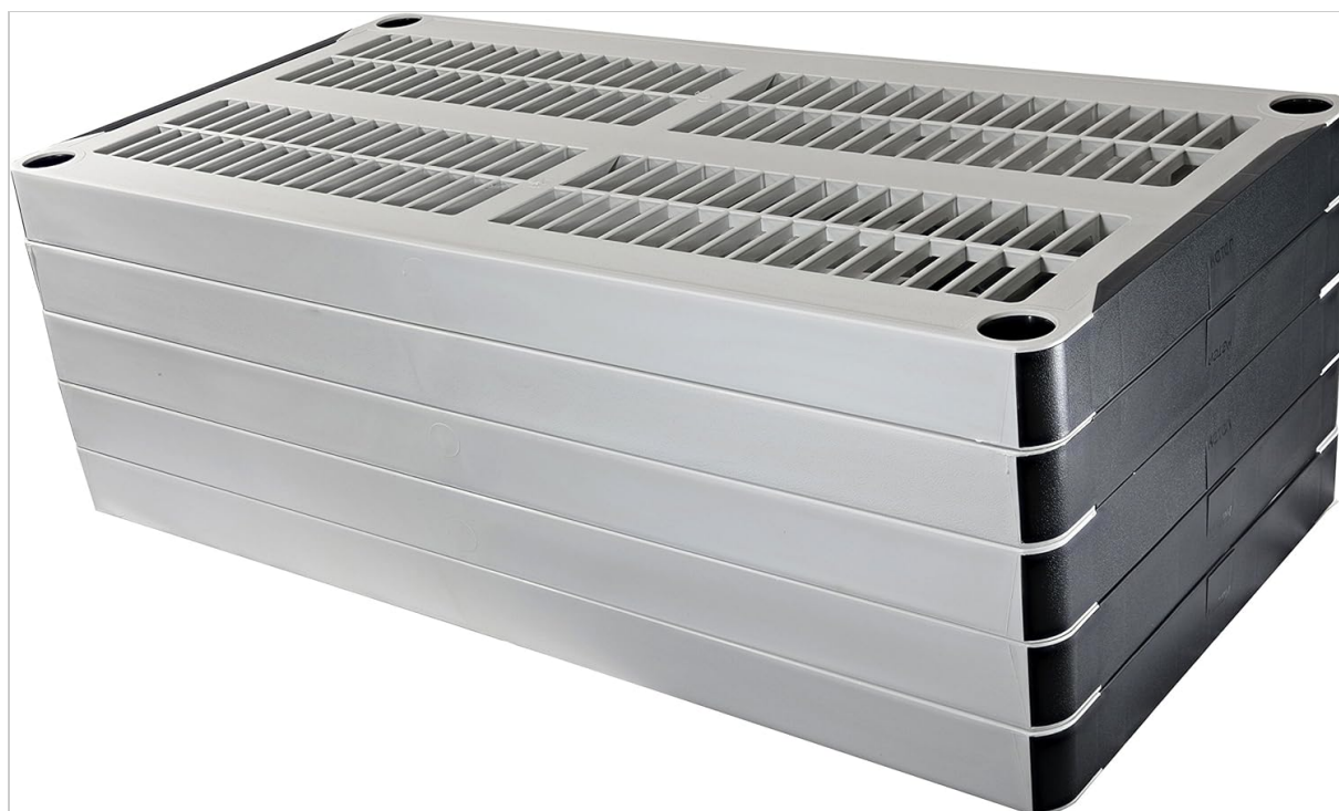
Image 3.1: Stacked components of the HDX shelving unit prior to assembly. This image shows the individual shelves and posts neatly stacked, indicating the compact packaging of the unit.

Before beginning assembly, verify that all components are present and undamaged. If any parts are missing or damaged, do not proceed with assembly. Contact customer support for assistance.