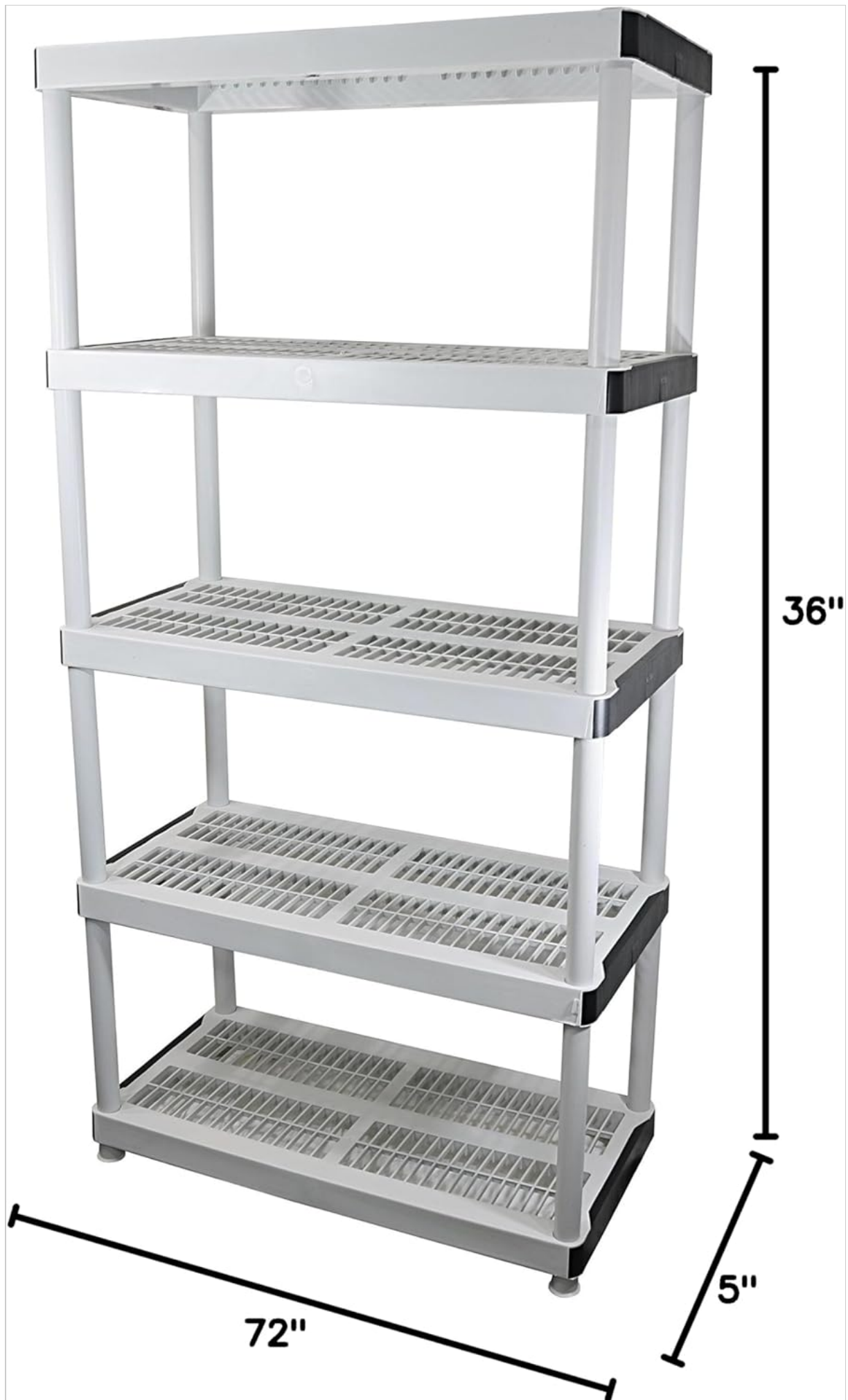
Image 8.1: Diagram illustrating the dimensions of the HDX shelving unit. The unit measures approximately 72 inches in height, 36 inches in