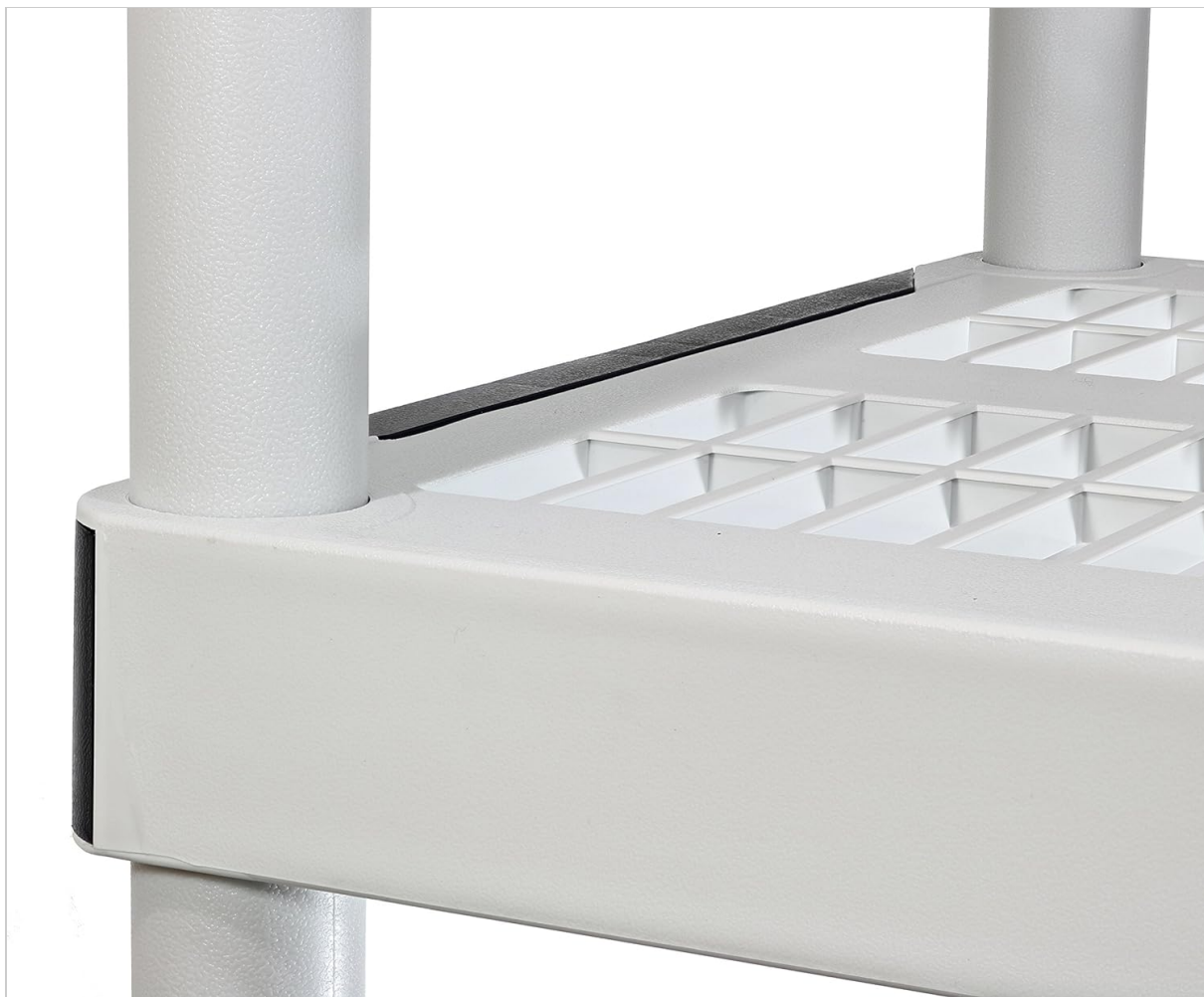
Image 4.1: A close-up view illustrating the connection point between a shelf and a post. This detail highlights the interlocking design for tool-free assembly.

Tip: For easier assembly, ensure each post is oriented correctly before pressing shelves into place. The posts have a slightly tapered end for insertion.