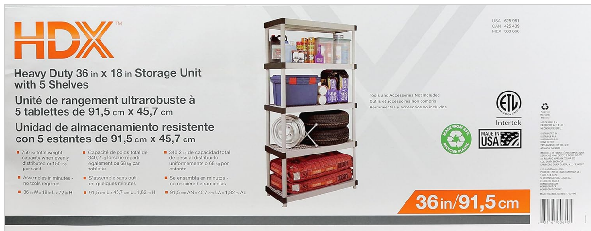
Image 3.2: Product packaging for the HDX shelving unit. The packaging displays the brand, product name, and key specifications, confirming the unit's contents and dimensions.

Note: The exact number of small components like feet/caps may vary slightly based on design revisions. Refer to your packaging for precise counts.