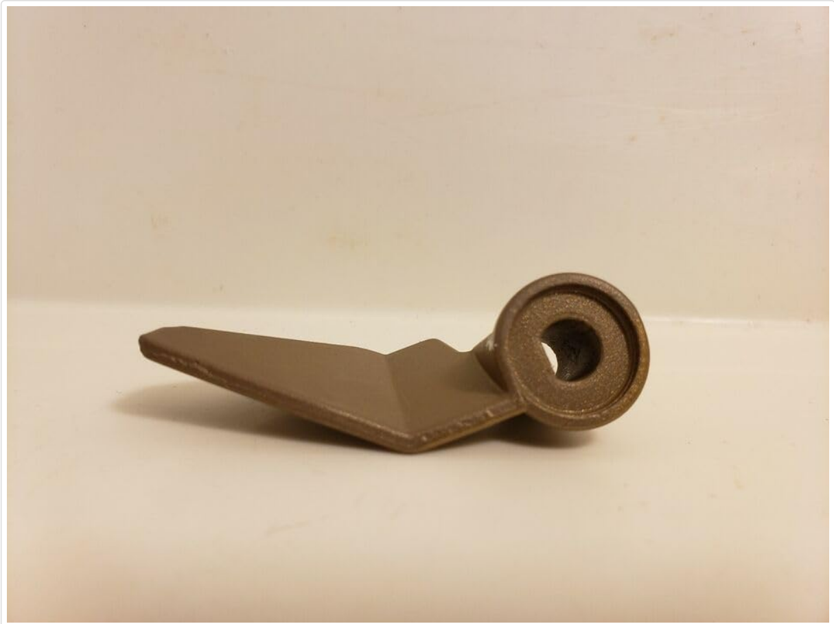
Image 3: Top-down view of the TacPower Cook's Essentials Bread Machine Kneading Paddle. This view clearly shows the circular base where the paddle attaches to the bread machine's drive shaft.