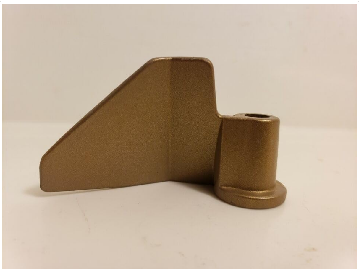
Image 2: Angled view of the TacPower Cook's Essentials Bread Machine Kneading Paddle. This perspective highlights the non-stick coating and the paddle's design for effective dough mixing.