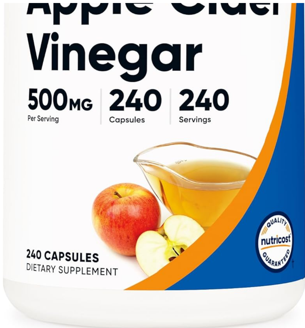
Image 1.1: Front view of the Nutricost Apple Cider Vinegar Capsules bottle, showing the brand name, product name, 500mg per serving, 240 capsules, and 240 servings.