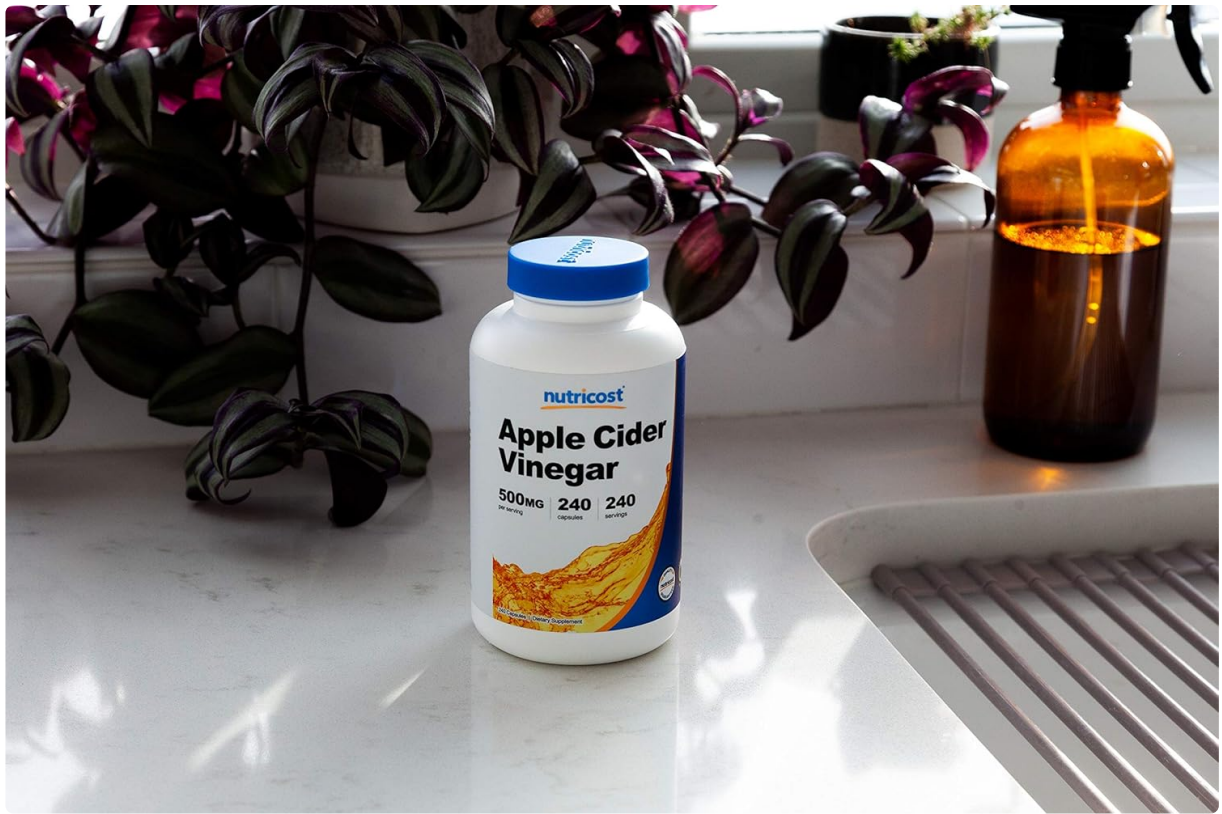
Image 5.1: Product bottle placed on a clean kitchen counter, illustrating typical storage environment.