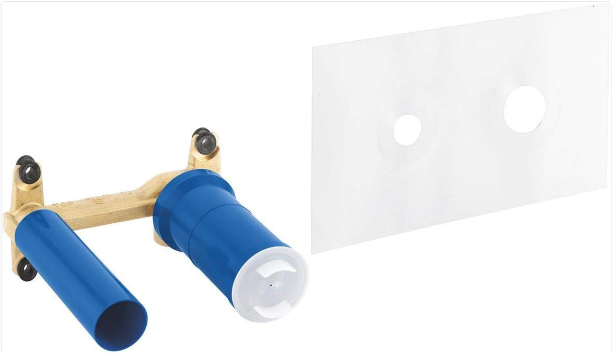
Figure 1: The GROHE Universal Concealed Body shown alongside its installation template, illustrating how the template guides the placement of the unit within the wall.