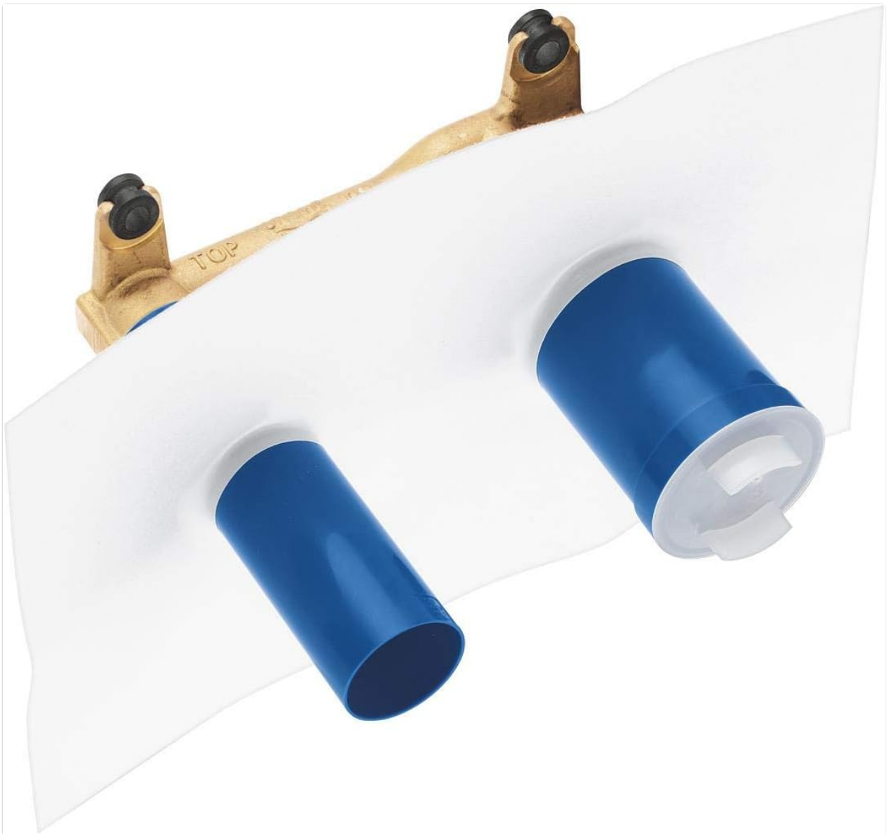
Figure 2: The concealed body is shown installed within a wall, with the white installation template still in place, demonstrating proper embedding and alignment.