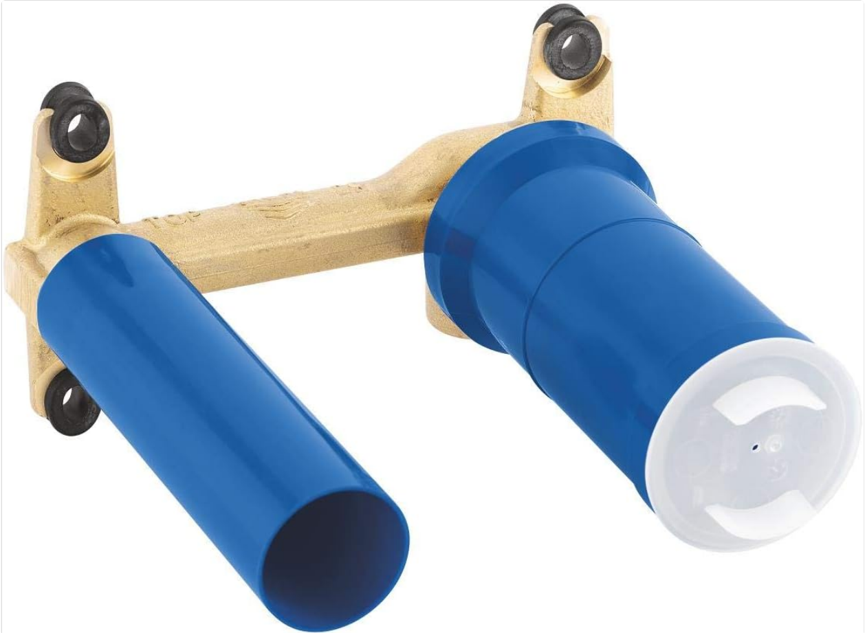
Figure 3: A clear front view of the GROHE Universal Concealed Body, highlighting its brass structure and blue protective sleeves for the water outlets.