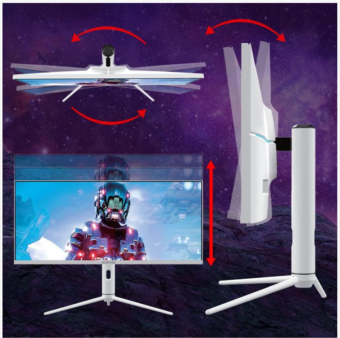
Figure 1: The monitor stand allows for height, tilt, and swivel adjustments for optimal viewing comfort.