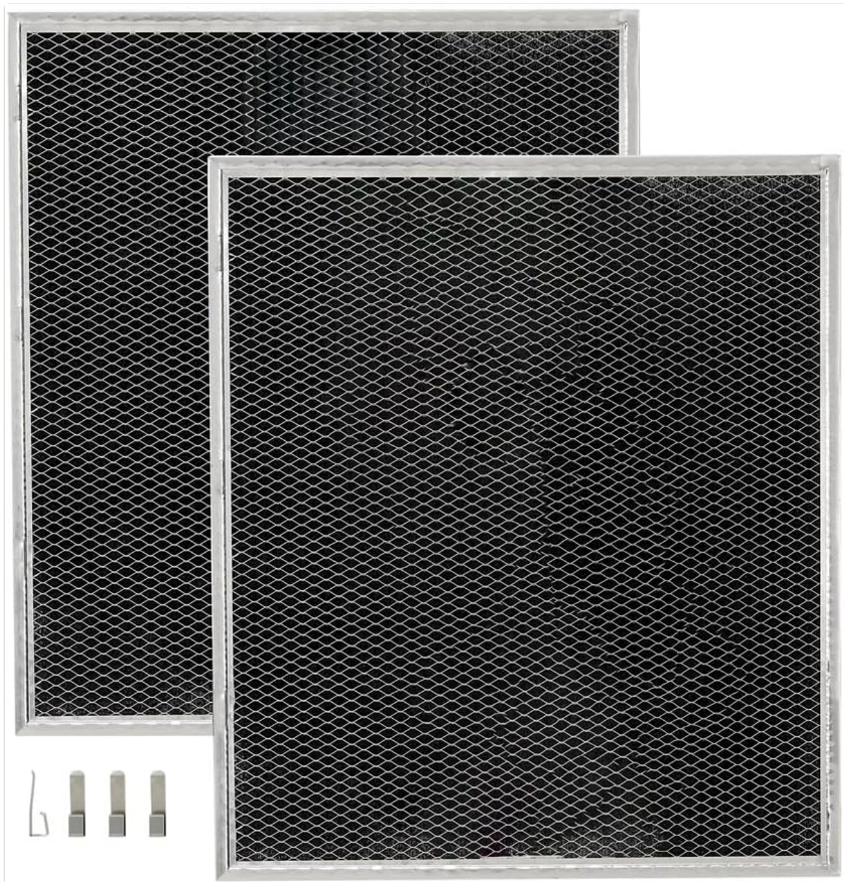
Figure 1: The Broan-NuTone HPF30 charcoal filter, showcasing its rectangular shape and carbon mesh construction.