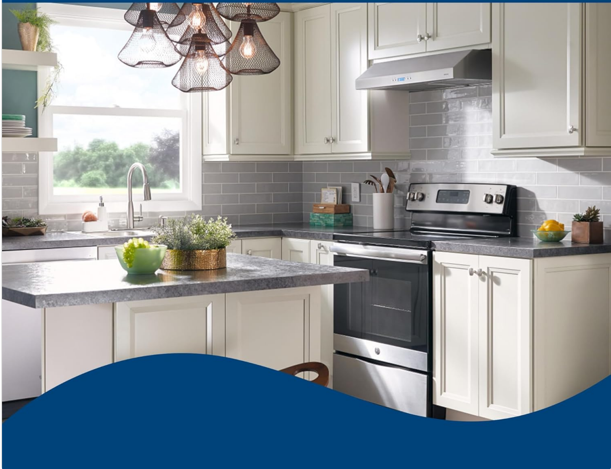
Figure 3: A kitchen setting with a range hood, illustrating that the filter is compatible with non-duct installations for 30-inch wide Mantra, Osmos, and Glacier Series Type XC ductless range hoods.

Used for Non-Duct Installation of 30" Wide Mantra, Osmos, Glacier Series Type XC Ductless Range Hoods