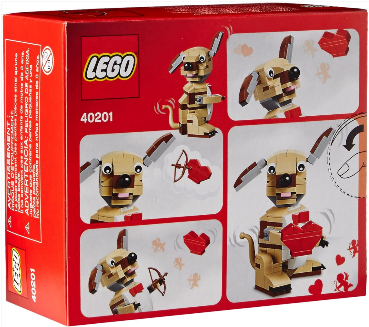
Figure 2: Back of the product packaging, highlighting the dog's poseable elements.