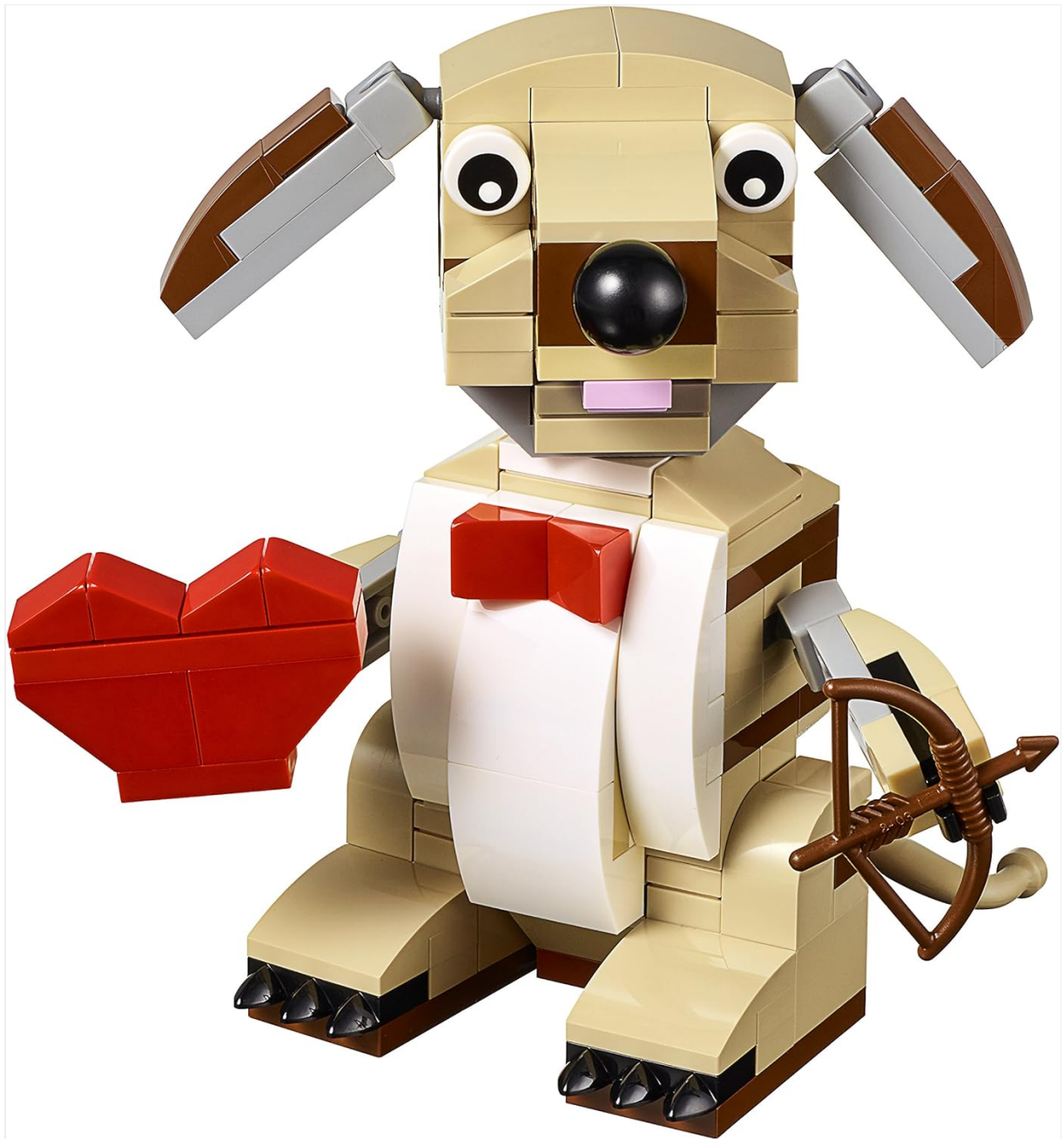
Figure 3: Front view of the assembled LEGO Cupid Dog.