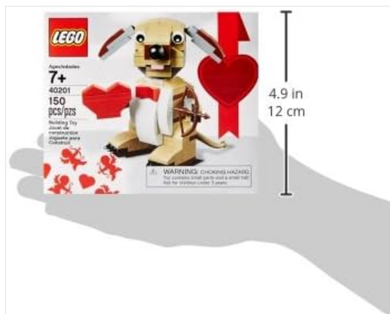
Figure 7: Product dimensions for reference.