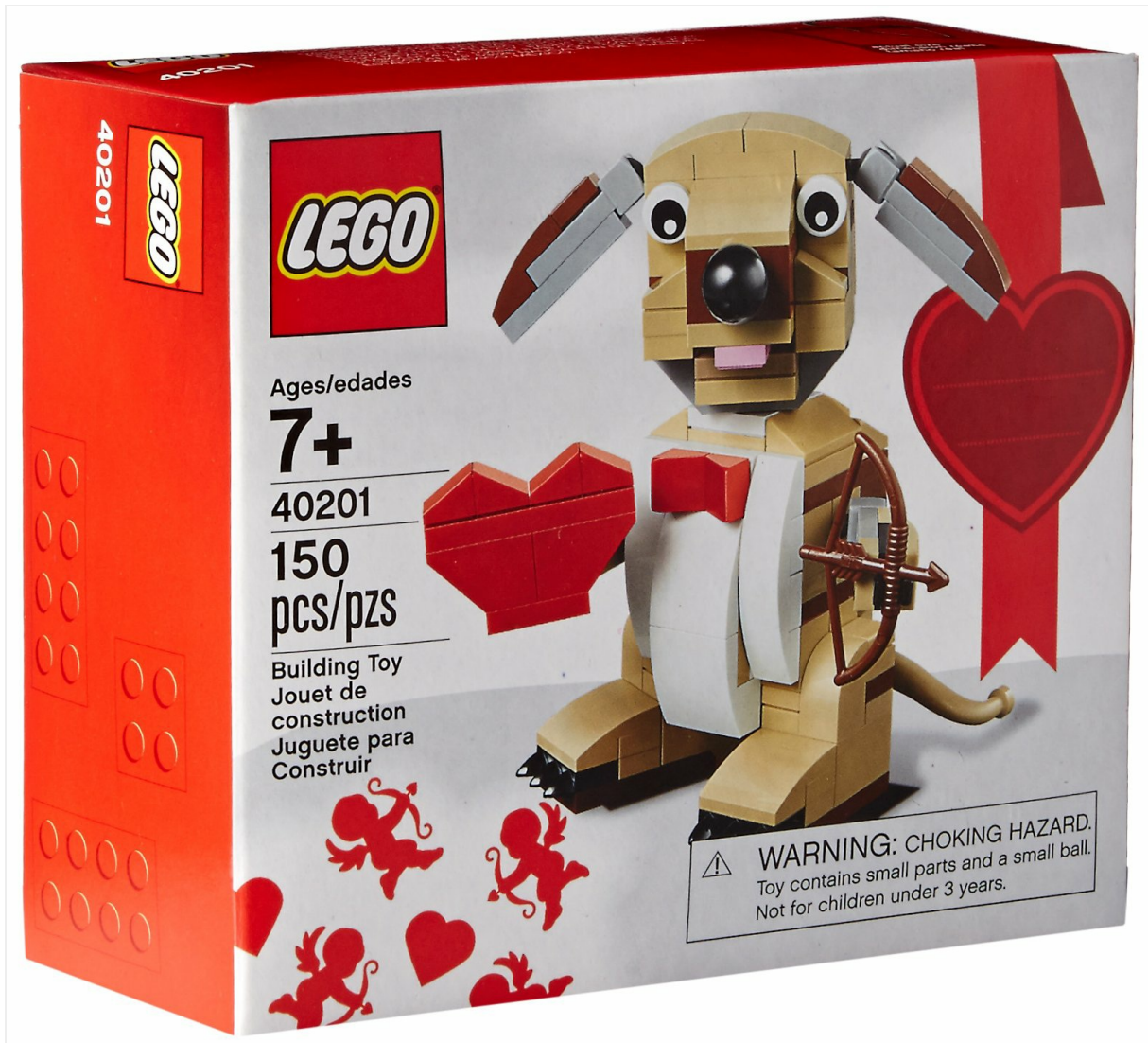
Figure 1: Front of the product packaging, displaying the assembled Cupid Dog.