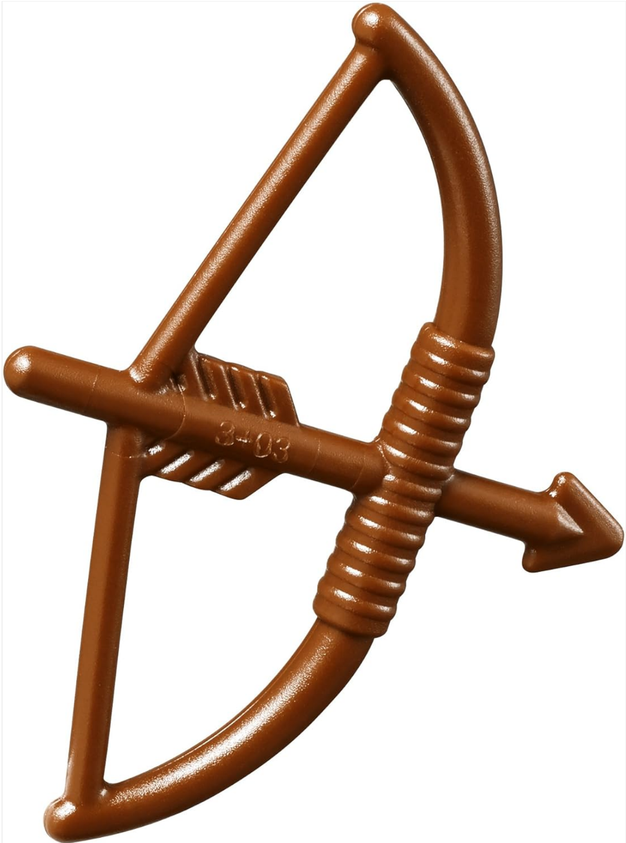
Figure 5: Detailed view of the bow and arrow accessory.