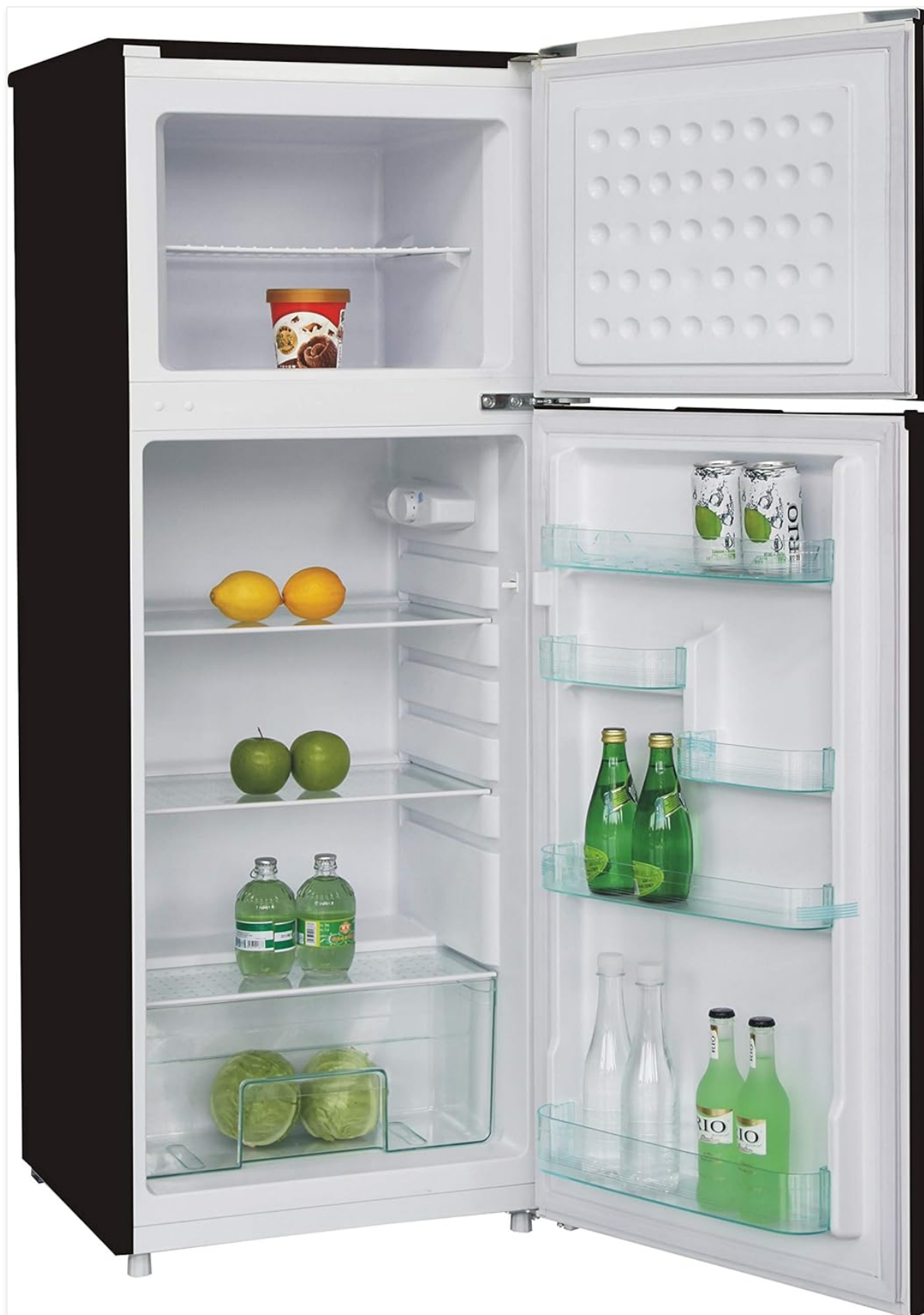
Image: Interior view of the ARCTIC CHEF FR725 refrigerator. This image highlights the adjustable glass shelves, door bins for bottles, and the crisper drawer at the bottom, along with the freezer compartment above.

colder setting. Allow several hours for the temperature to stabilize after adjustment.