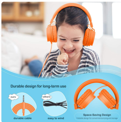
Figure 7: A child enjoying content with gorsun headphones and a tablet.