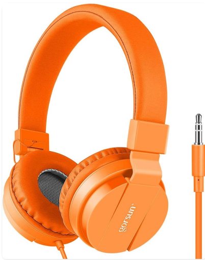
Figure 1: gorsun GS-778 Wired Kids Headphones (Orange) Ultra-comfortable Wear