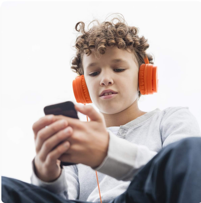
Figure 8: A child using gorsun headphones with a smartphone.