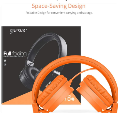
Figure 4: Space-Saving Foldable