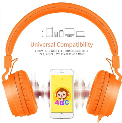
Figure 3: Universal Compatibility with smartphones, computers, tablets, and DVD players.