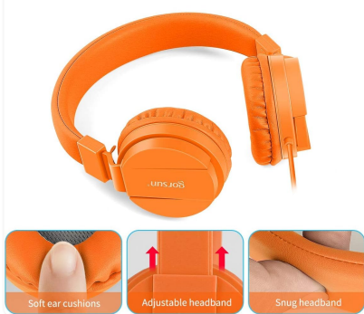
Figure 2: Ultra-comfortable Wear features including soft ear cushions, adjustable headband, and snug headband.