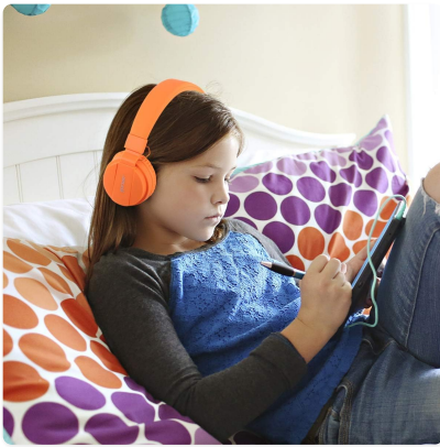
Figure 5: Durable cable design for long-term use, resistant to tangles and tears.

Design for convenient carrying and storage.