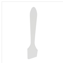
Figure 3: The included spatula for spreading thermal paste.