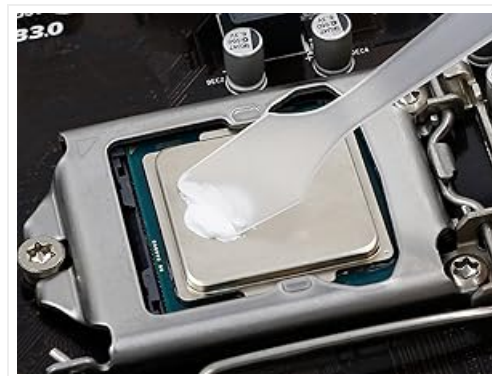
Figure 6: Spreading thermal paste evenly with the provided spatula.

Note: A thin, even layer is generally more effective than a thick one. Avoid applying too much paste, as this can reduce thermal performance.