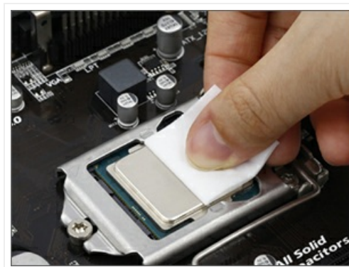
Figure 4: Cleaning the CPU surface before thermal paste application.