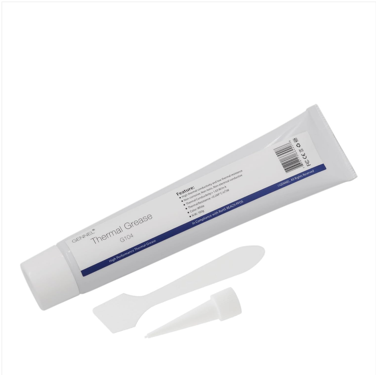
Figure 1: GENNEL G104 Thermal Grease Paste package contents.