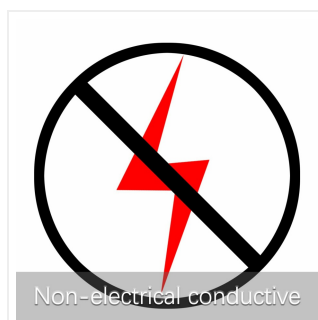
Figure 2: The thermal paste is non-electrical conductive, ensuring safety for electronic components.