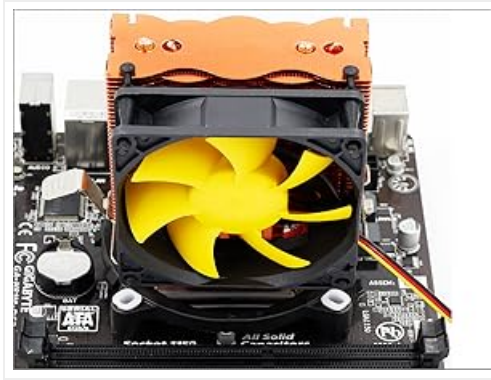
Figure 7: Properly installed heatsink over a CPU with thermal paste.