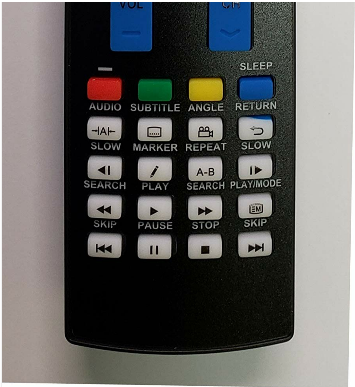
An angled view of the black RM-Series replacement remote control, showing its ergonomic design and various buttons including power, number pad, navigation, volume, channel, and media controls.