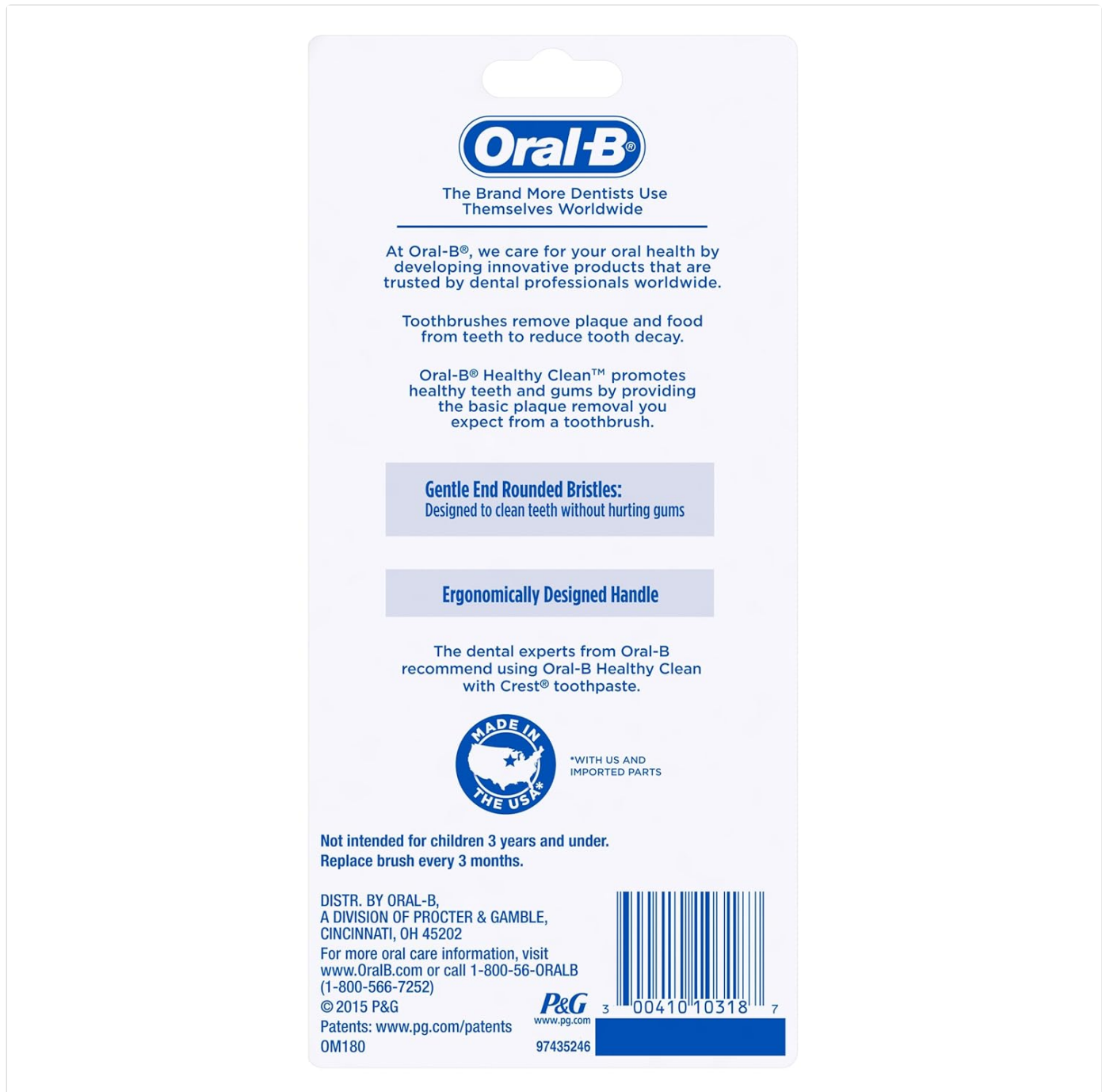
Image 3: Back of the Oral-B Healthy Clean 40 Soft Toothbrush packaging, displaying key features, manufacturing details, and UPC barcode.