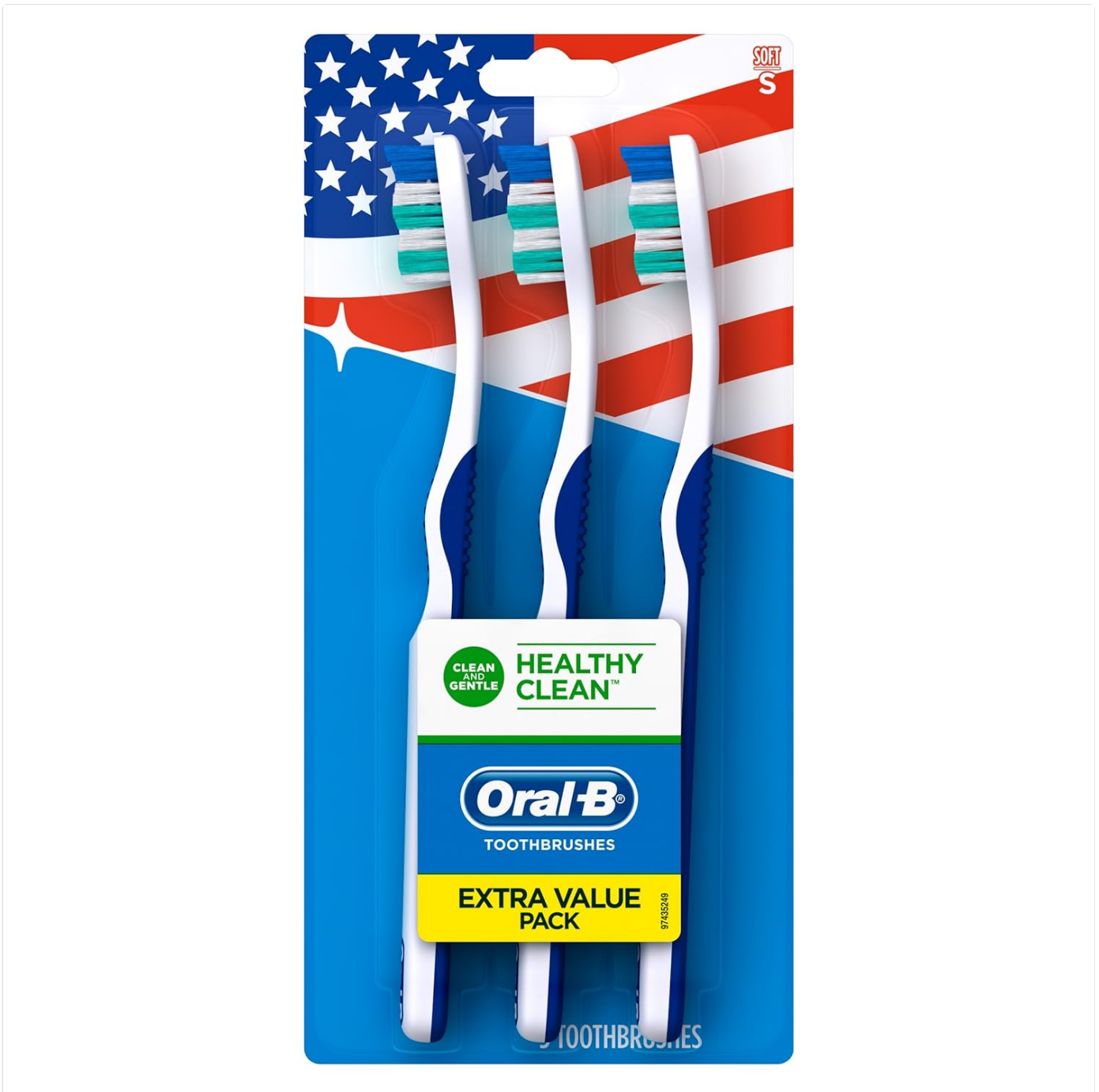
Image 1: Front view of the Oral-B Healthy Clean 40 Soft Toothbrush 3-pack packaging, showing three blue-handled toothbrushes with soft, end-rounded bristles.