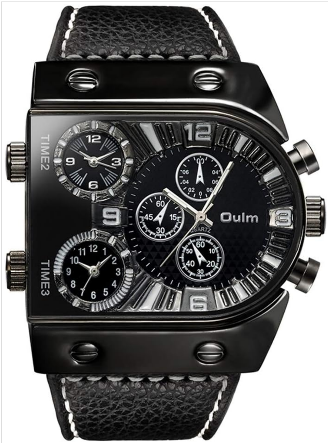
Image: Front view of the Oulm CH164 watch, showcasing its unique rectangular case, three distinct time displays, and black PU leather strap with white stitching.