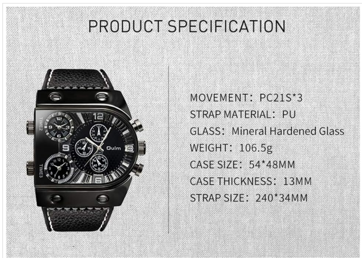
Image: Diagram showing the key specifications of the Oulm CH164 watch, including movement type, materials, and dimensions.