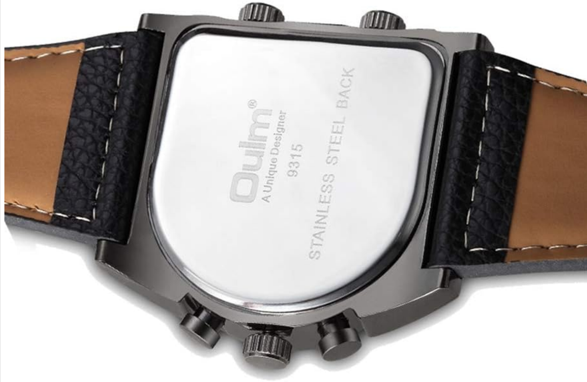
Image: View of the stainless steel back of the Oulm CH164 watch, displaying the "Oulm A Unique Designer 9315" engraving, which confirms the model and material.