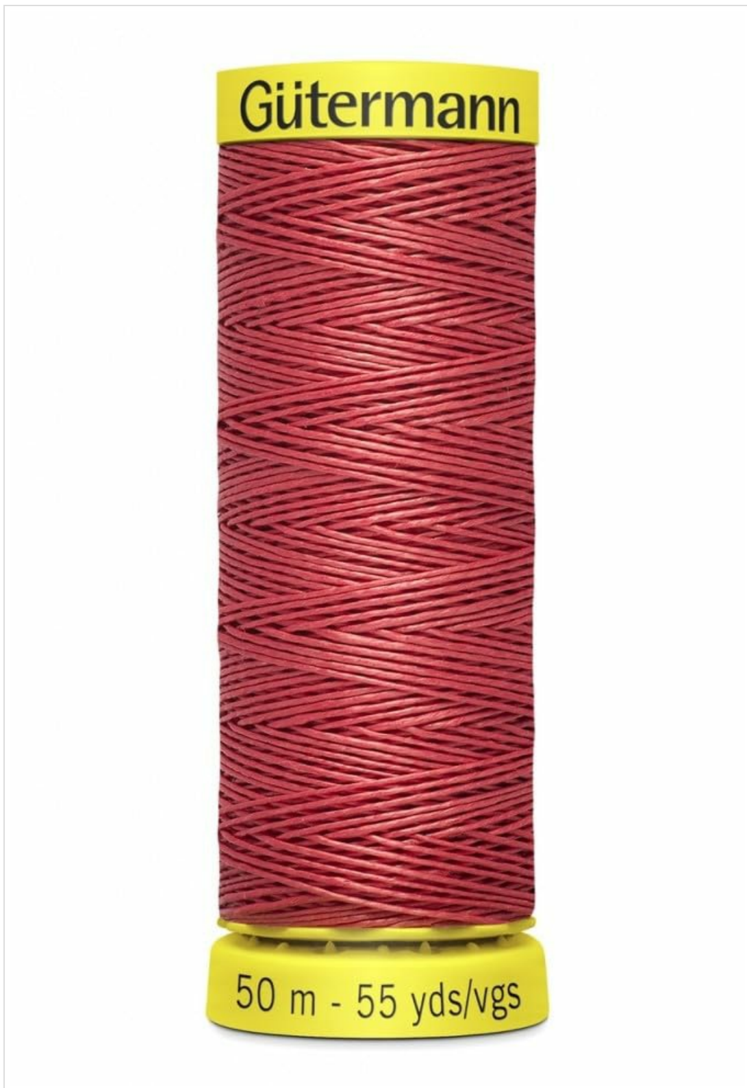
A spool of Gutermann Waxed Extra Strong Linen Sewing Thread in a vibrant red color, labeled with 'Gutermann' at the top and '50 m - 55 yds/vgs' at the bottom.