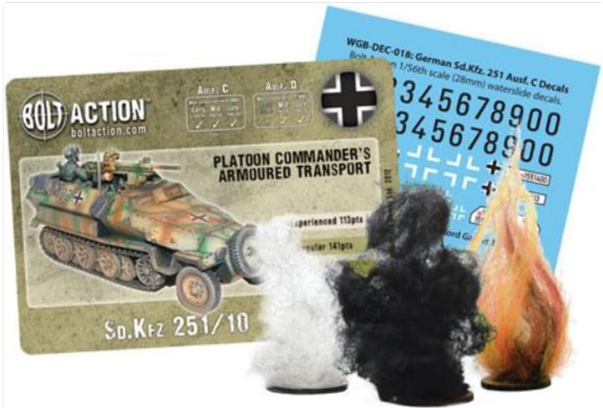
Image: Contents of the model kit, showing the plastic components, stat card, waterslide decals, and instruction leaflet. This image illustrates the typical contents you will find in the box, ensuring all necessary parts for assembly and gameplay are included.