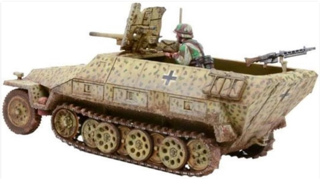
Image: An assembled and painted model of the Sd.Kfz 251/10 ausf D Half Track, viewed from the rear-side. This perspective provides a clear view of the rear armor design and the mounted weapon, illustrating the completed model's details from another angle.