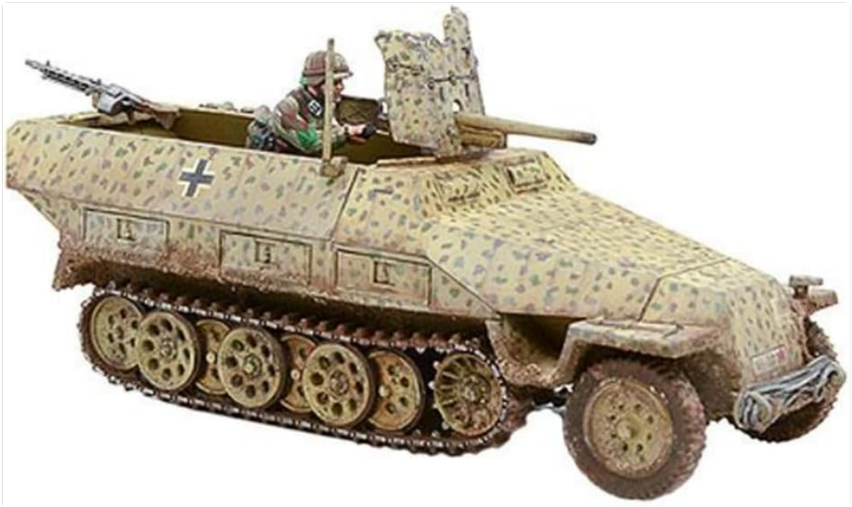
Image: An assembled and painted model of the Sd.Kfz 251/10 ausf D Half Track, viewed from the side. This image demonstrates the completed appearance of the model after assembly and painting, highlighting the intricate details of the tracks and the camouflage pattern.