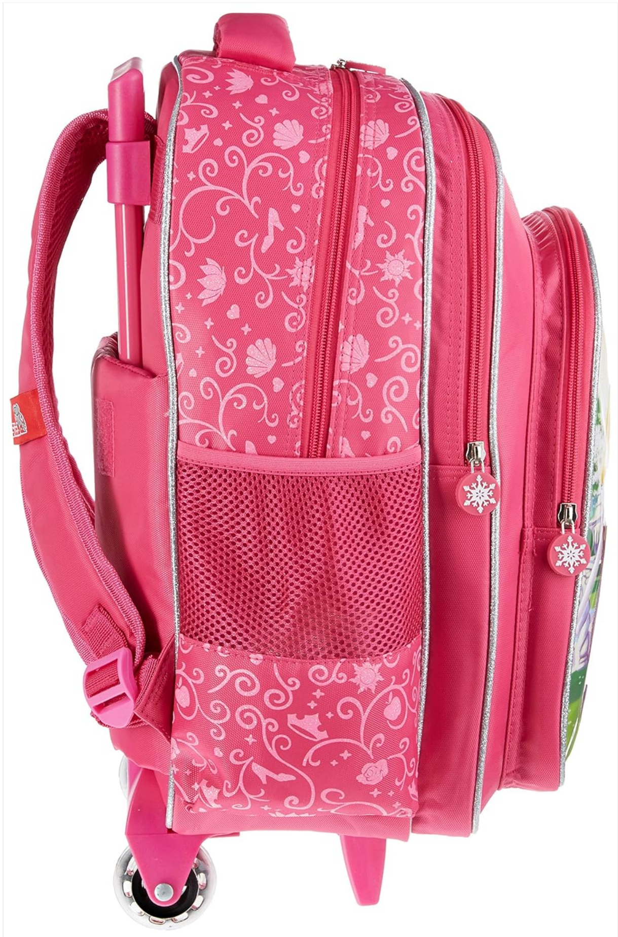
Image: Side view of the backpack, featuring a mesh pocket suitable for holding a water bottle, and the patterned pink fabric.