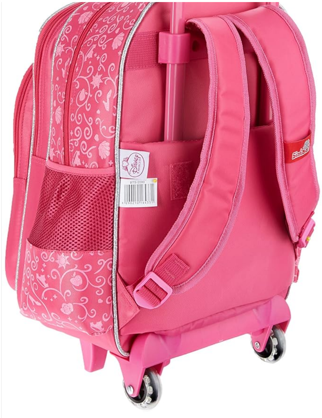
Image: Side view of the backpack showing the extendable pink trolley handle fully extended, ready for rolling. The shoulder straps are visible on the back panel.