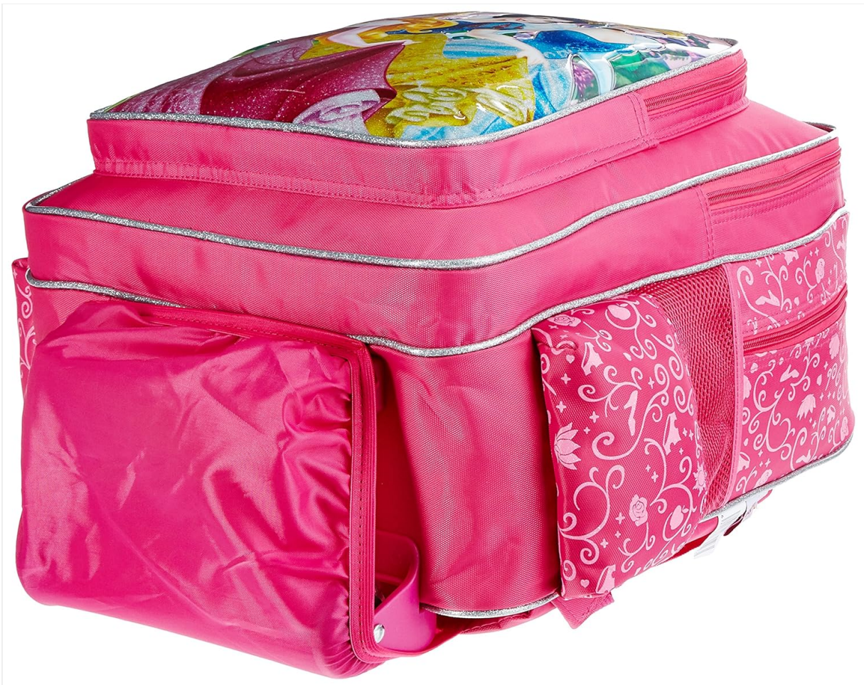
Image: Bottom view of the backpack, highlighting the durable wheels and the protective base, designed for rolling transport.