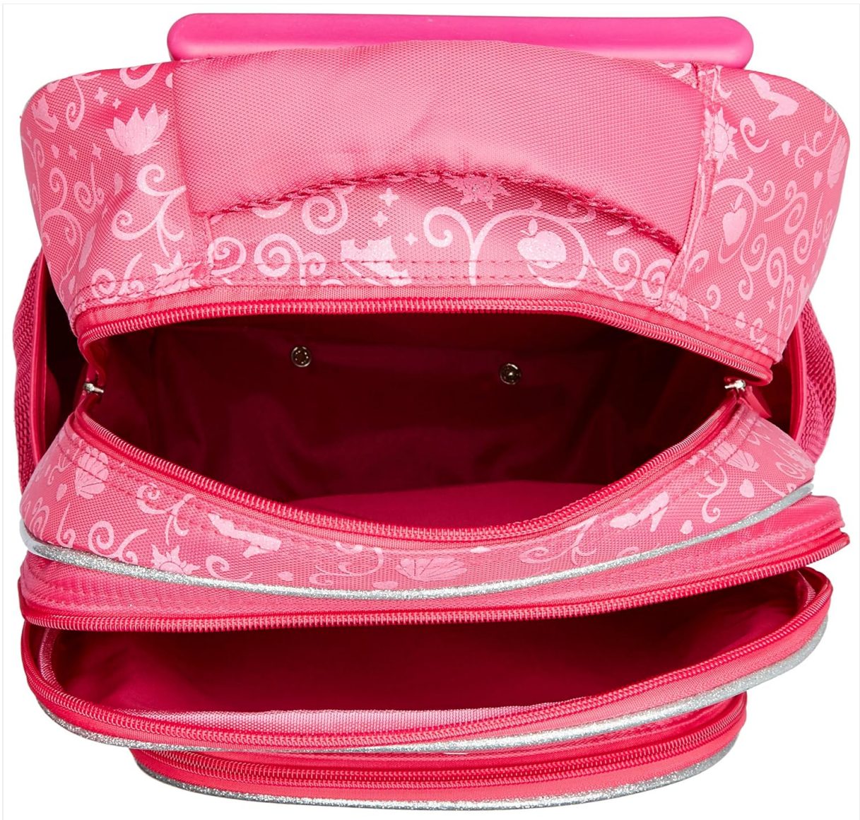
Image: Top-down view of the backpack with its main zippered compartments open, revealing the spacious interior for packing.