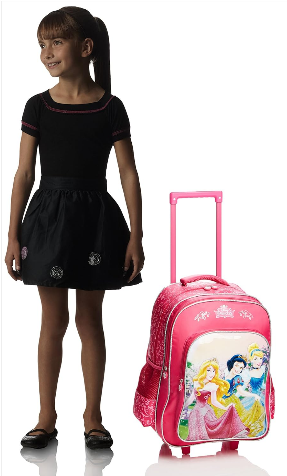
Image: The Disney Princess 18-inch backpack shown next to a child, illustrating its size and design. The backpack