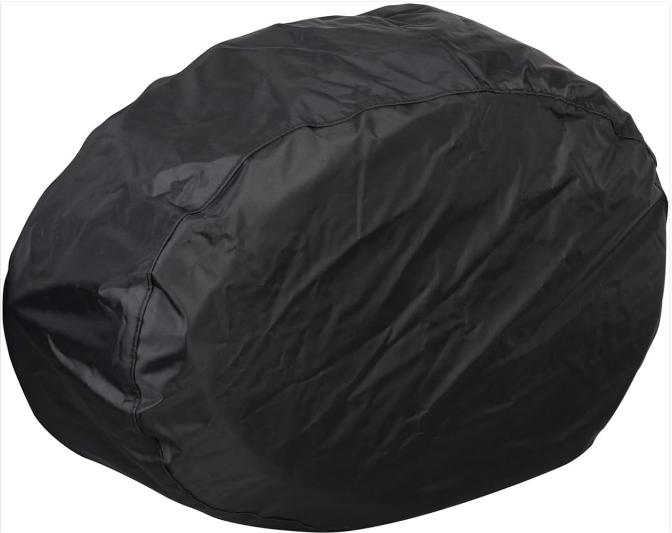
Figure 5.2: The included rain cover for weather protection.