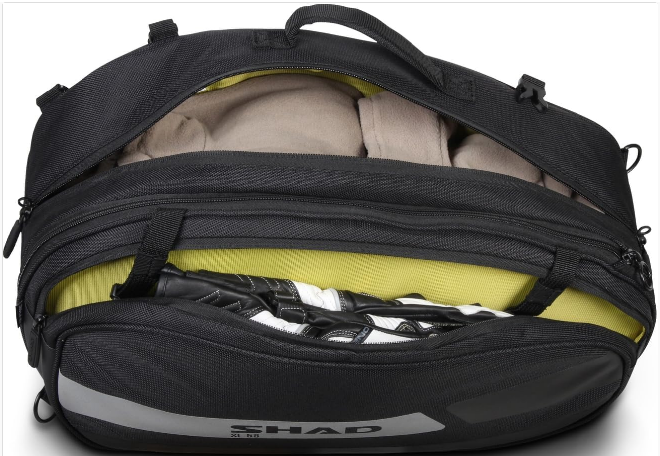
Figure 5.1: Interior view of an open saddle bag, showing the yellow lining and storage capacity.