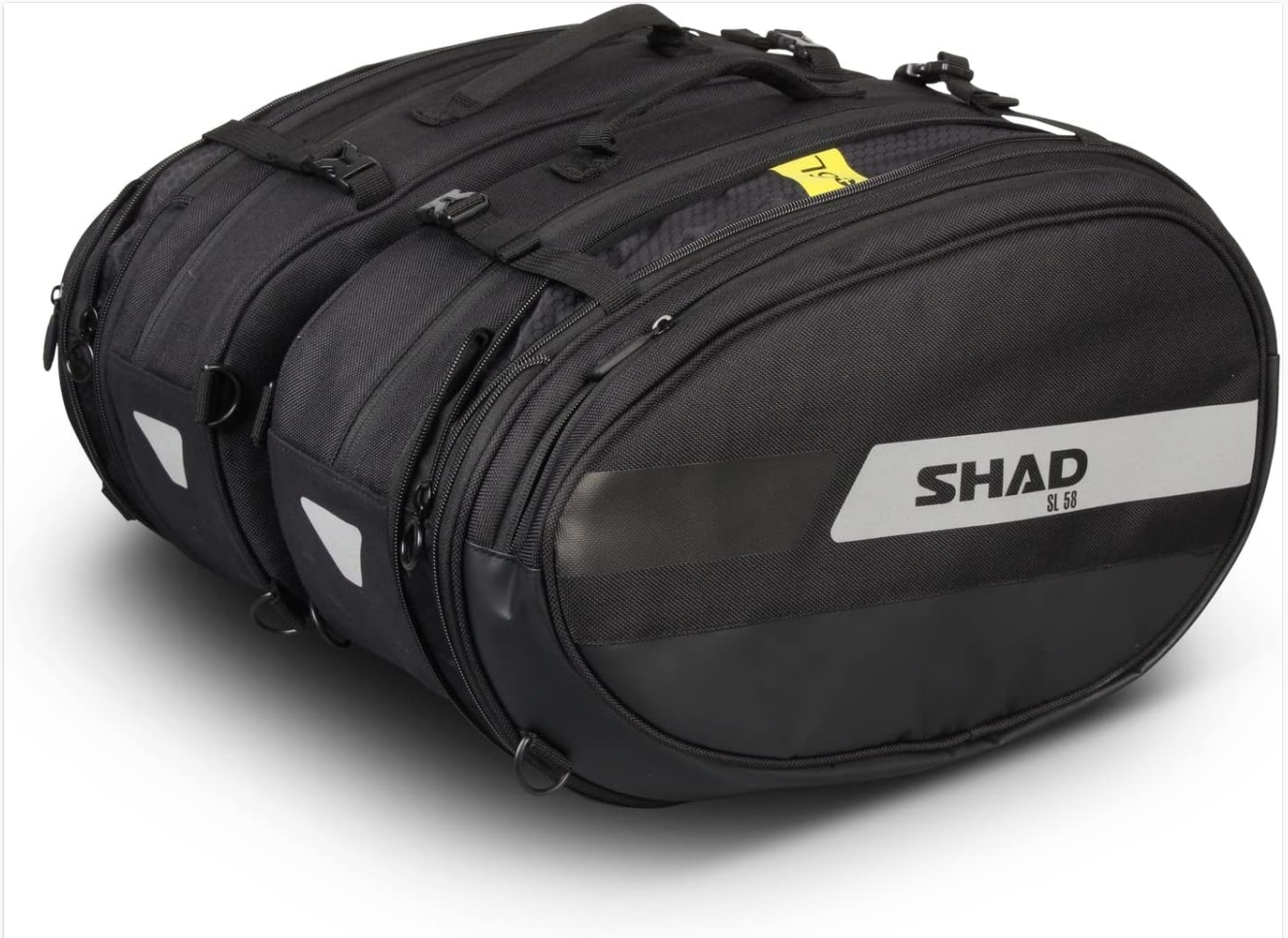
Figure 3.1: Overview of the Shad X0SL58 Expandable Saddle Bags.