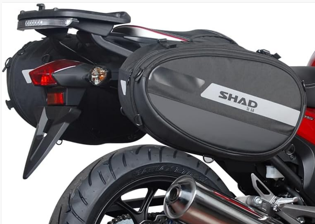
Figure 4.3: Another side view showing the secure mounting of the saddle bags.

the additional bottom straps to secure the bags to these points. This provides extra stability and prevents the bags from swinging.