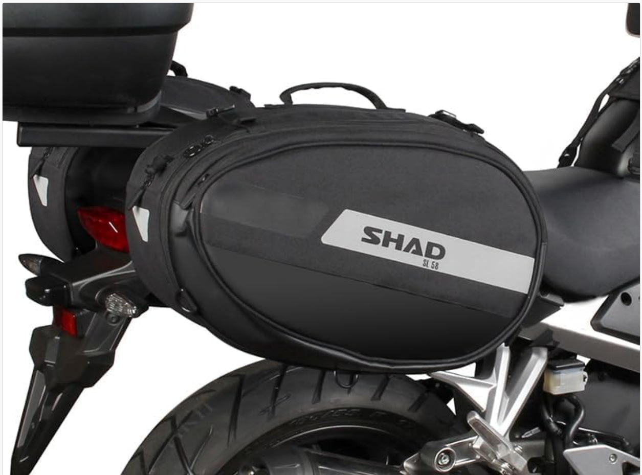
Figure 4.2: Side view of saddle bags on a motorcycle, illustrating the top strap attachment.