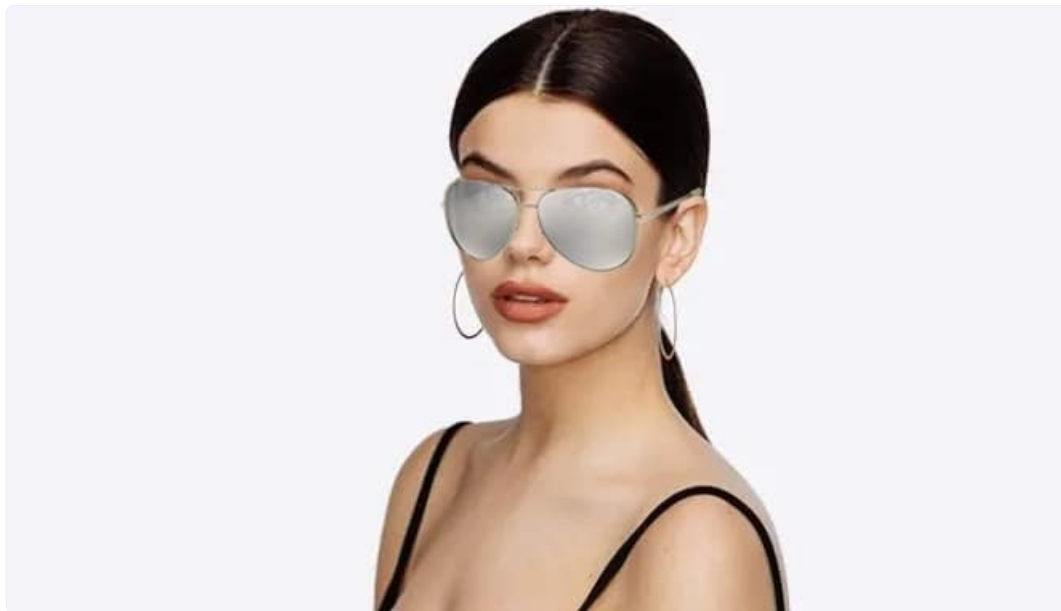
Image: A person wearing the Michael Kors MK5004 sunglasses, demonstrating typical wear.