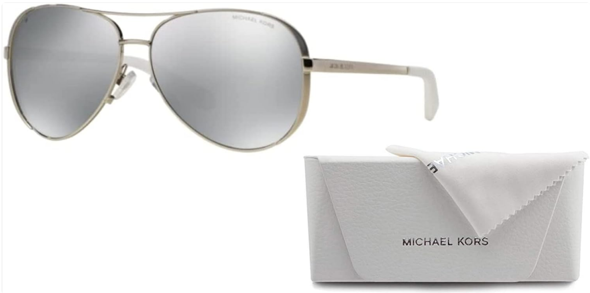
Image: Michael Kors MK5004 Sunglasses shown with their protective case.