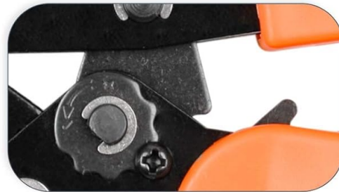
Figure 3: Key features of the crimper, including adjustable crimping force, a smooth ratcheting mechanism, and an anti-stuck trigger for enhanced usability.