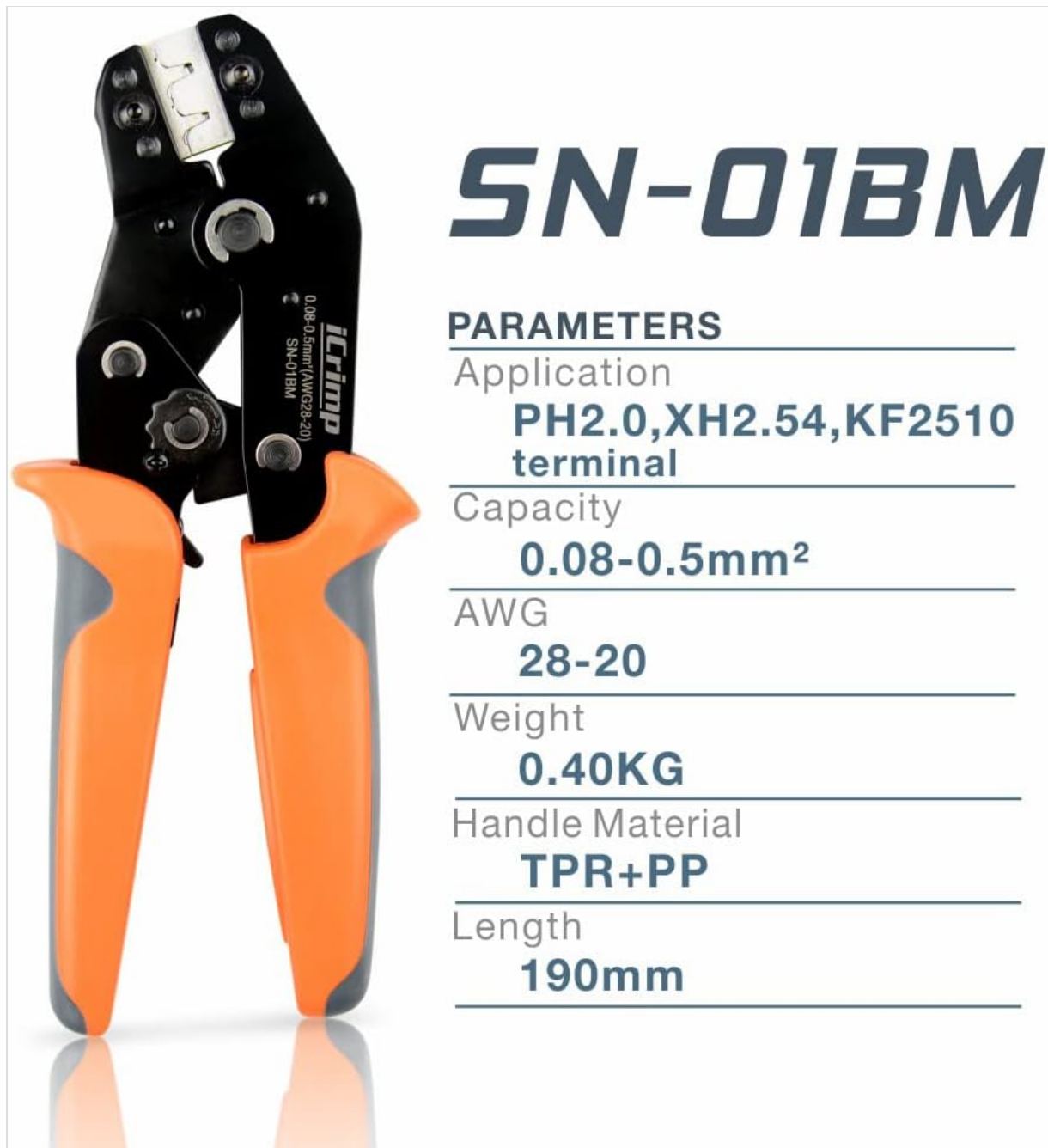
Figure 1: IWISS SN-01BM Ratchet Crimper highlighting its parameters including application, capacity, AWG, weight, handle material, and length.