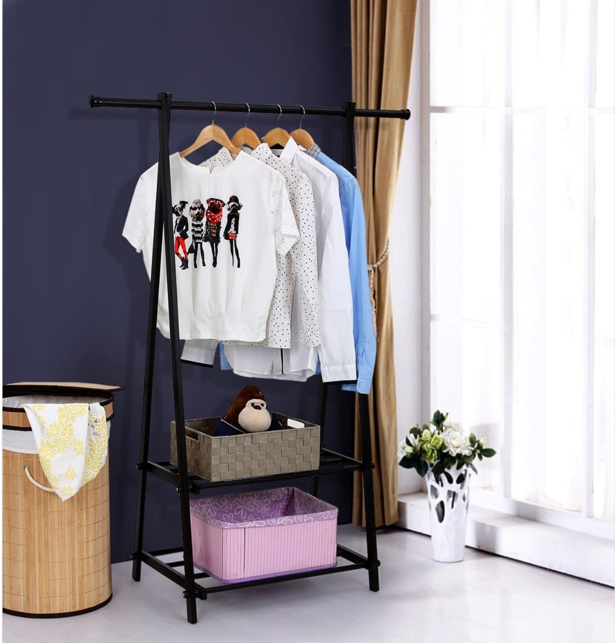
The SONGMICS URCR22B Garment Rack in a room setting, showcasing its use for hanging clothes and storing items on its two shelves.