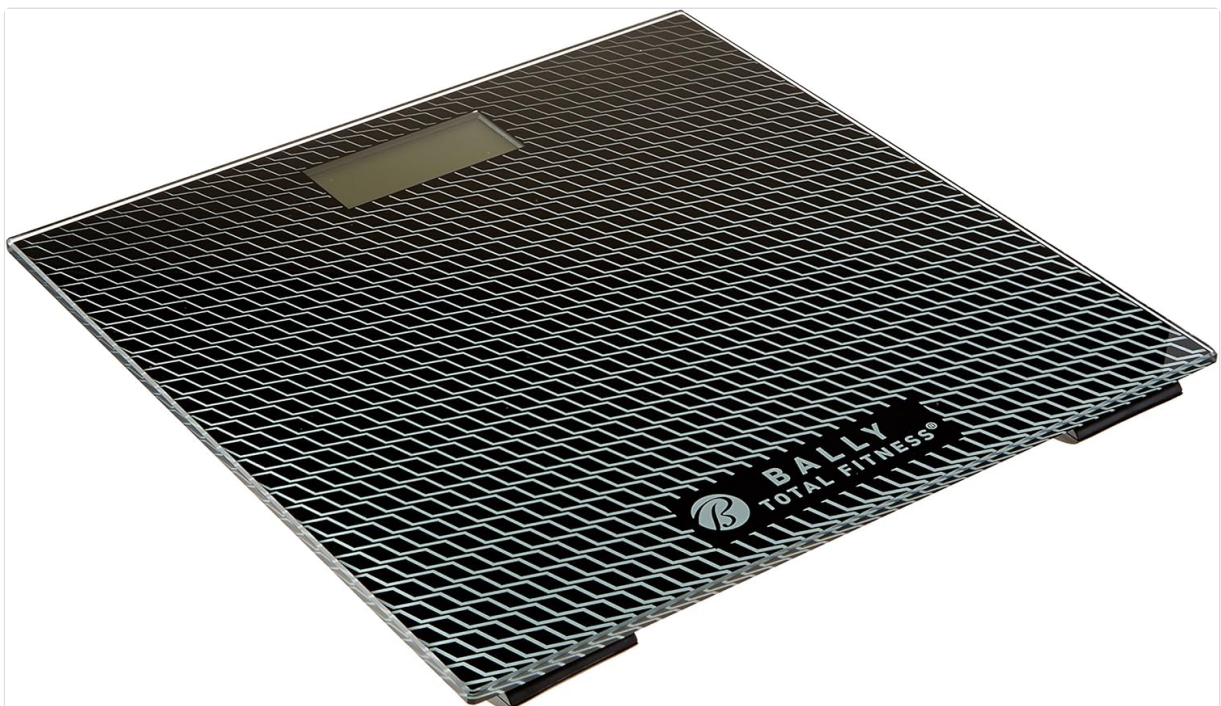
Image: The Bally Total Fitness BLS-7302 BLK Digital Bathroom Scale, showcasing its black tempered

Thank you for choosing the Bally Total Fitness BLS-7302 BLK Digital Bathroom Scale. This scale is designed to provide accurate weight measurements with ease of use. Featuring high-precision sensors and a durable tempered glass platform, it offers a reliable way to monitor your weight. Please read this manual thoroughly before use to ensure proper operation and maintenance.