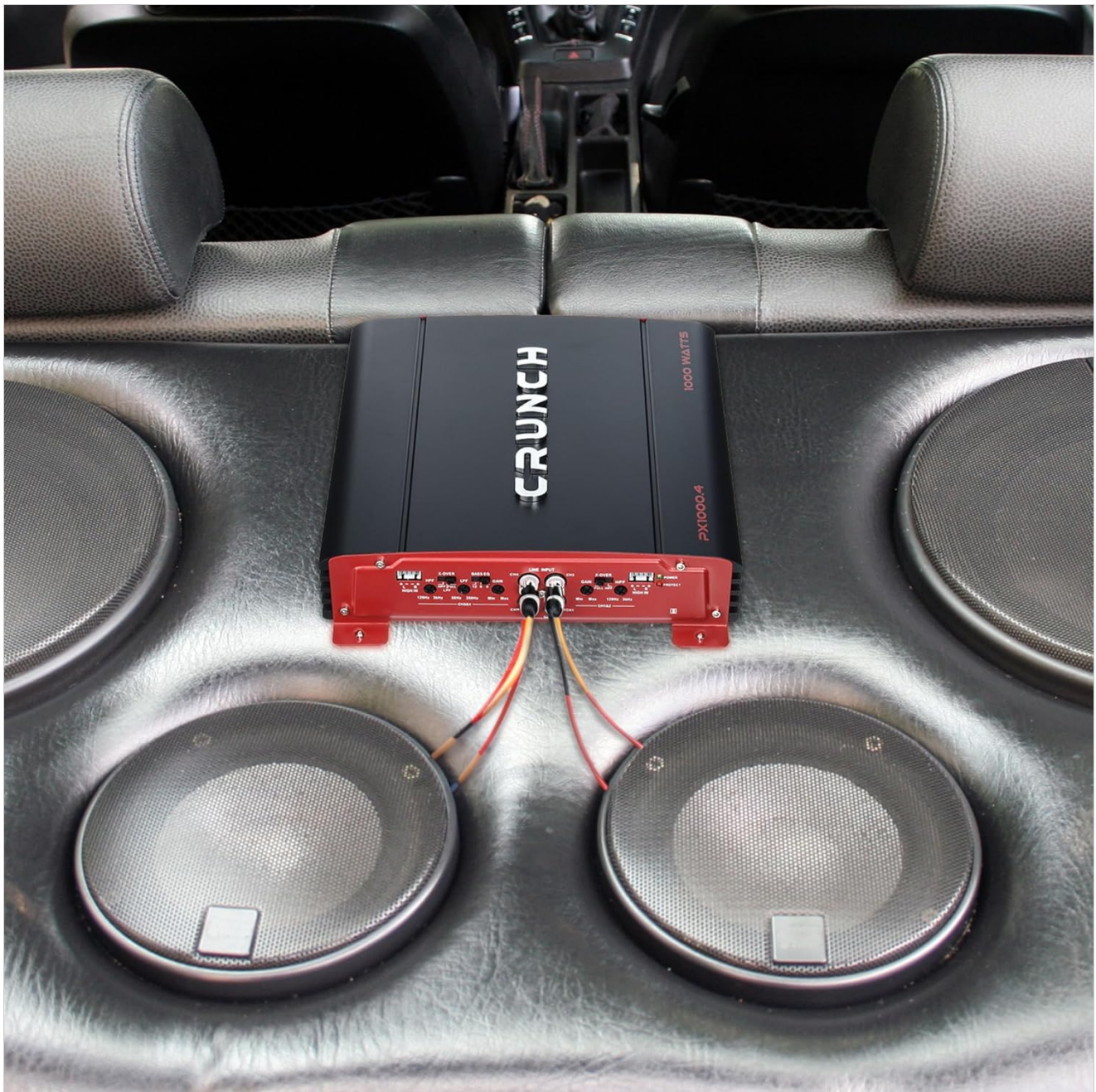
Image: The Crunch PX 1000.4 amplifier installed in a car trunk, connected to speakers.