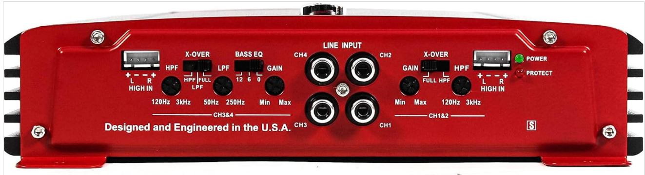
Image: Close-up view of the amplifier's control panel, showing input and output terminals, fuses, and adjustment knobs.

The amplifier is equipped with two 30A fuses for protection. Ensure these are correctly installed before operation.