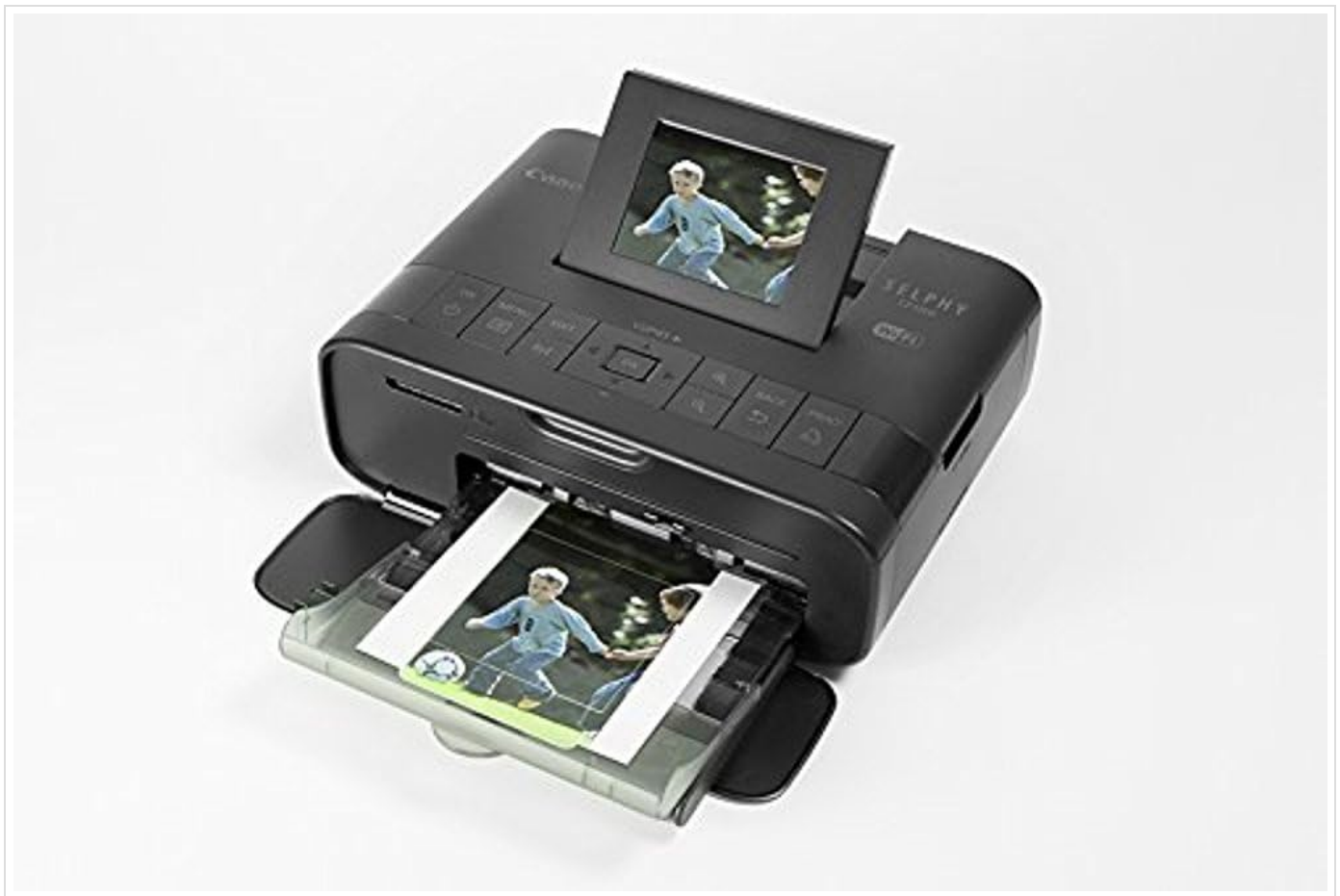
Image: The Canon SELPHY CP1200 printer actively printing a photo, with the paper cassette extended and a partially printed image visible.