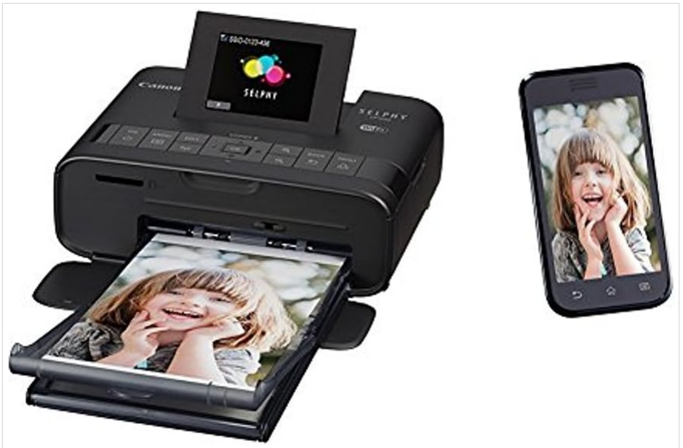
Image: The Canon SELPHY CP1200 printer positioned next to a smartphone, illustrating the wireless printing capability where the image on the phone is being sent to the printer.