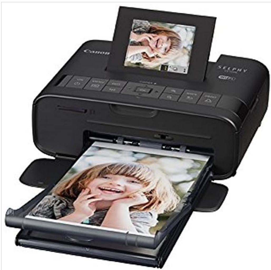
Image: The Canon SELPHY CP1200 printer with its paper cassette extended, illustrating the paper loading process and a photo emerging from the printer.