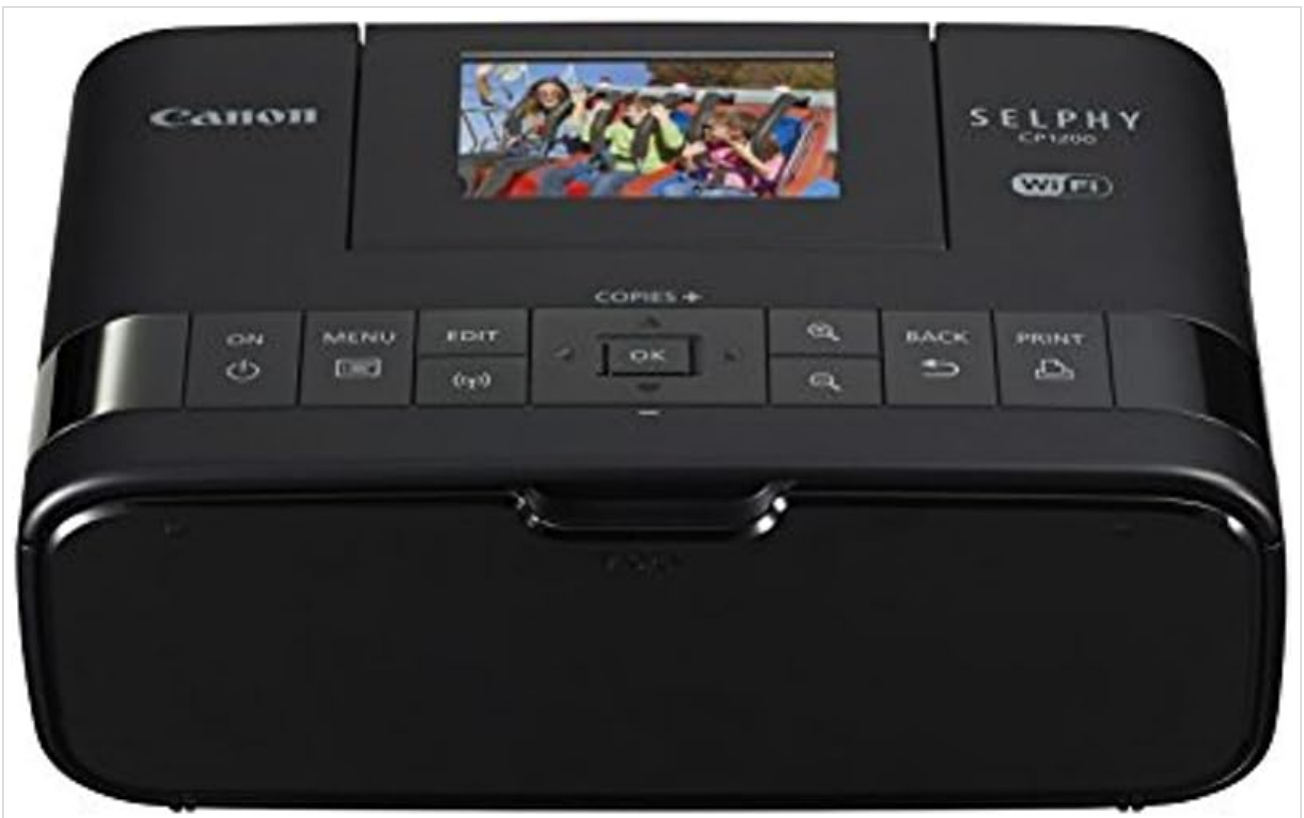
Image: Front view of the Canon SELPHY CP1200 printer, showcasing its compact design and control panel with a small LCD screen displaying a photo.

This manual provides detailed instructions for setting up, operating, and maintaining your Canon SELPHY CP1200 wireless color photo printer. Please read this manual thoroughly before using the printer to ensure correct operation and to maximize its performance and lifespan.