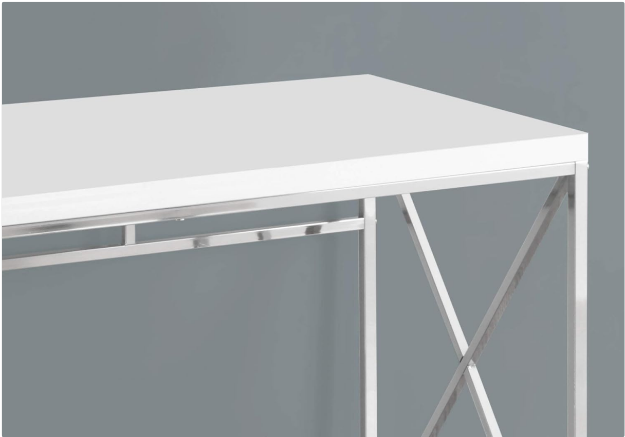
Image: A close-up view highlighting the glossy white finish of the desktop and the sleek chrome metal frame.