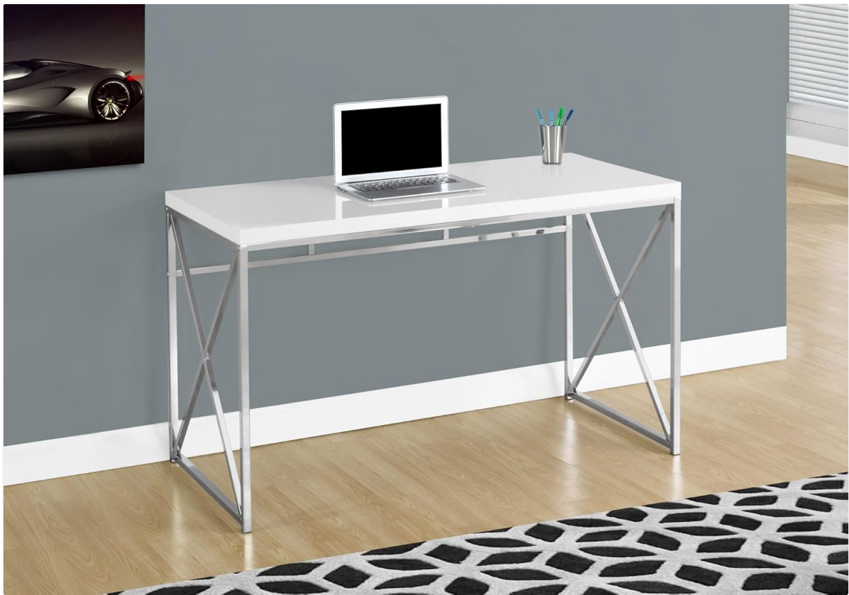
Image: Overall view of the Monarch Specialties I 7205 Computer Desk, showcasing its glossy white top and chrome metal legs.