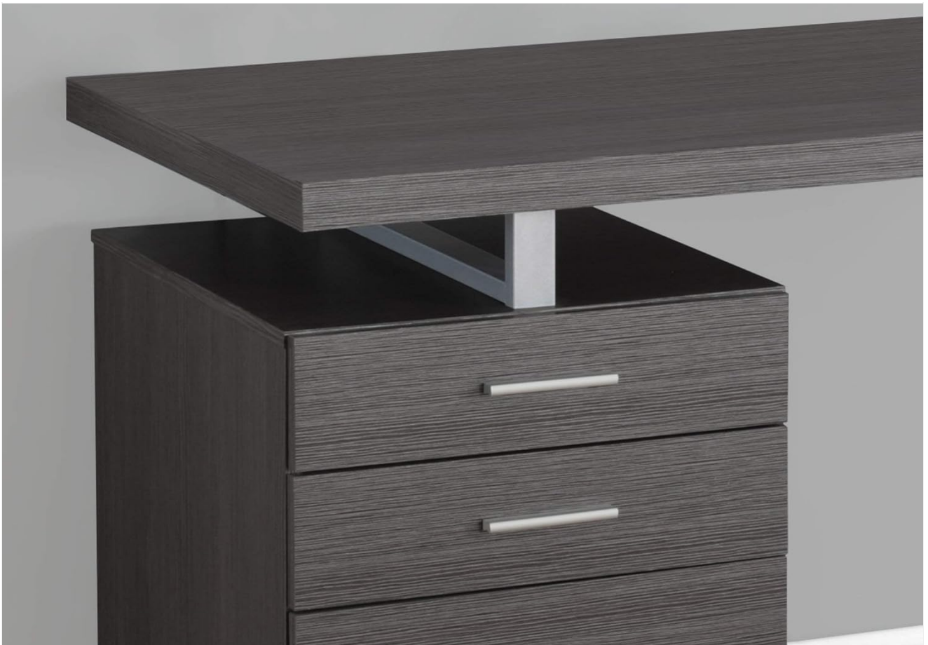
Figure 4: A close-up showing the floating desk top design and the smooth silver handles on the drawers, emphasizing the desk's modern aesthetic.