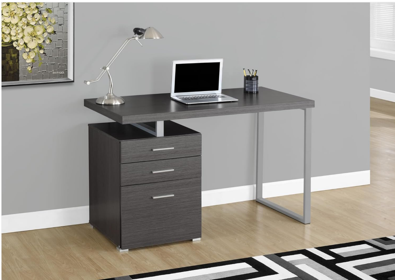
Figure 1: The Monarch Specialties Modern Home Office Desk in a typical office environment, showcasing its compact yet functional design with a grey finish and silver accents.

This manual provides detailed instructions for the assembly, operation, and maintenance of your Monarch Specialties Modern Home Office Computer Study Writing Desk. Designed for functionality and style, this desk features a sleek industrial grey finish, a floating top workstation, and versatile storage options. Please read all instructions carefully before beginning assembly.