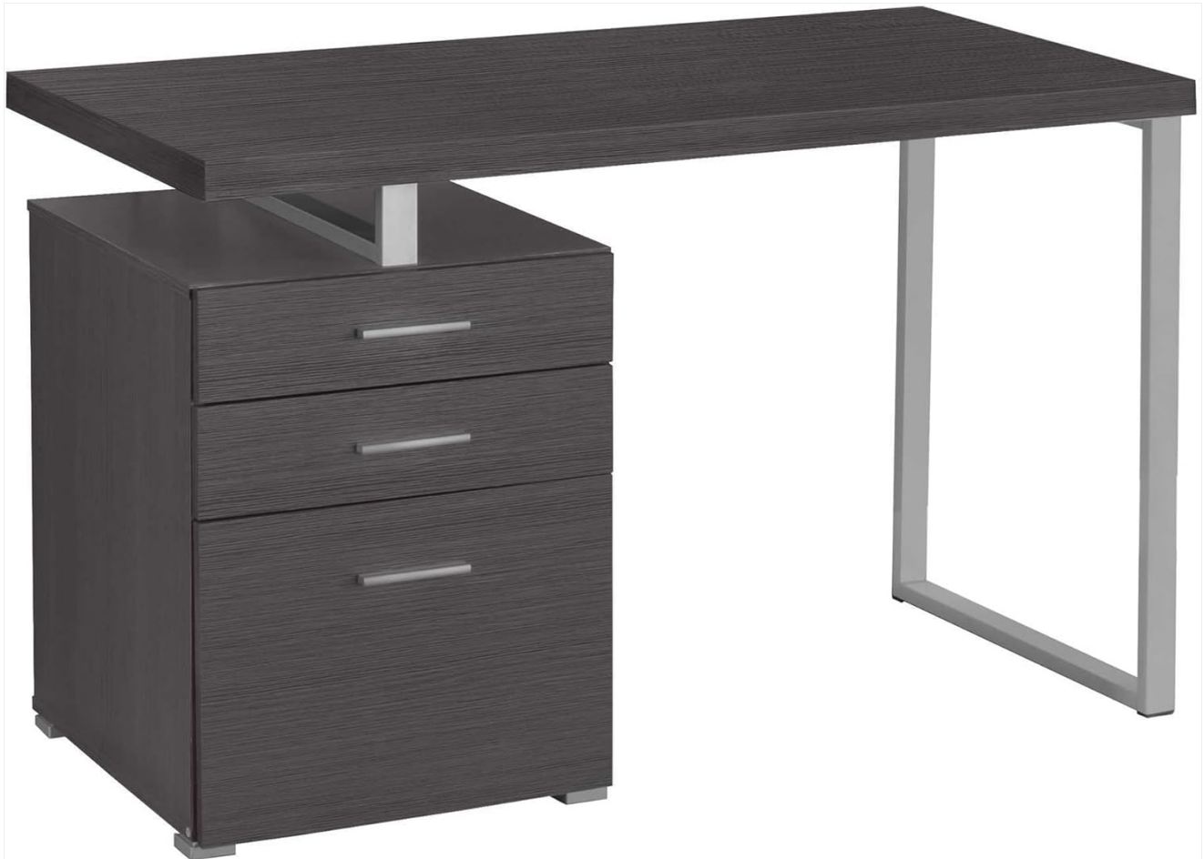
Figure 2: Front view of the desk, highlighting the grey finish, silver metal legs, and the three-drawer filing cabinet.