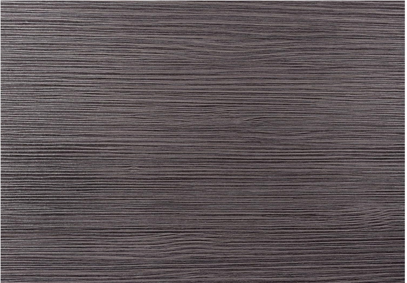
Figure 5: A detailed view of the industrial grey wood grain finish, showcasing the texture and quality of the desk material.