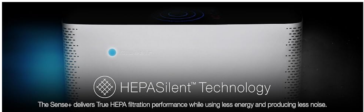
Image: The Blueair Sense+ Air Purifier, illustrating its low energy usage feature.