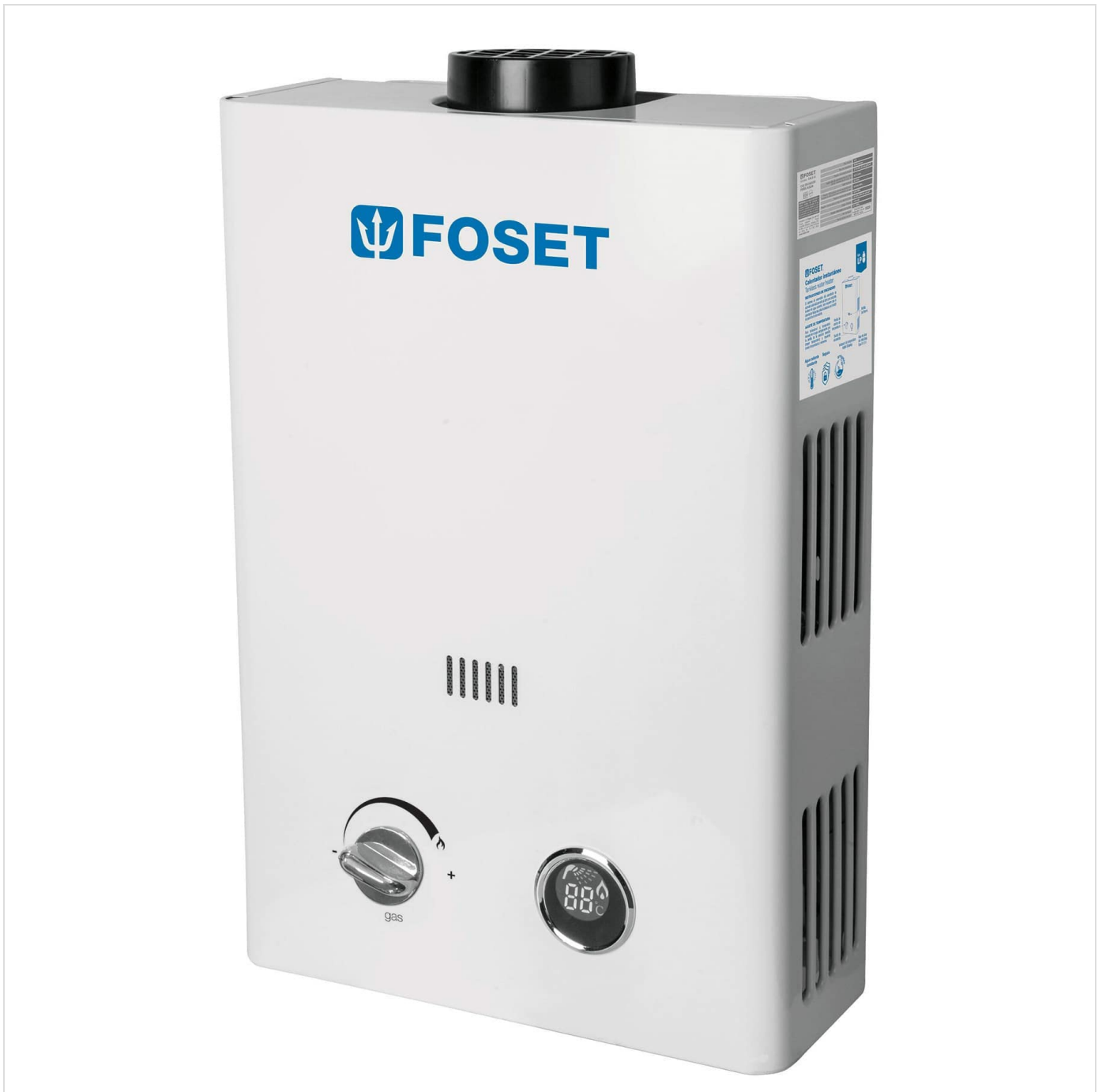
Front view of the Foset CALE-6l Instantaneous Water Heater.