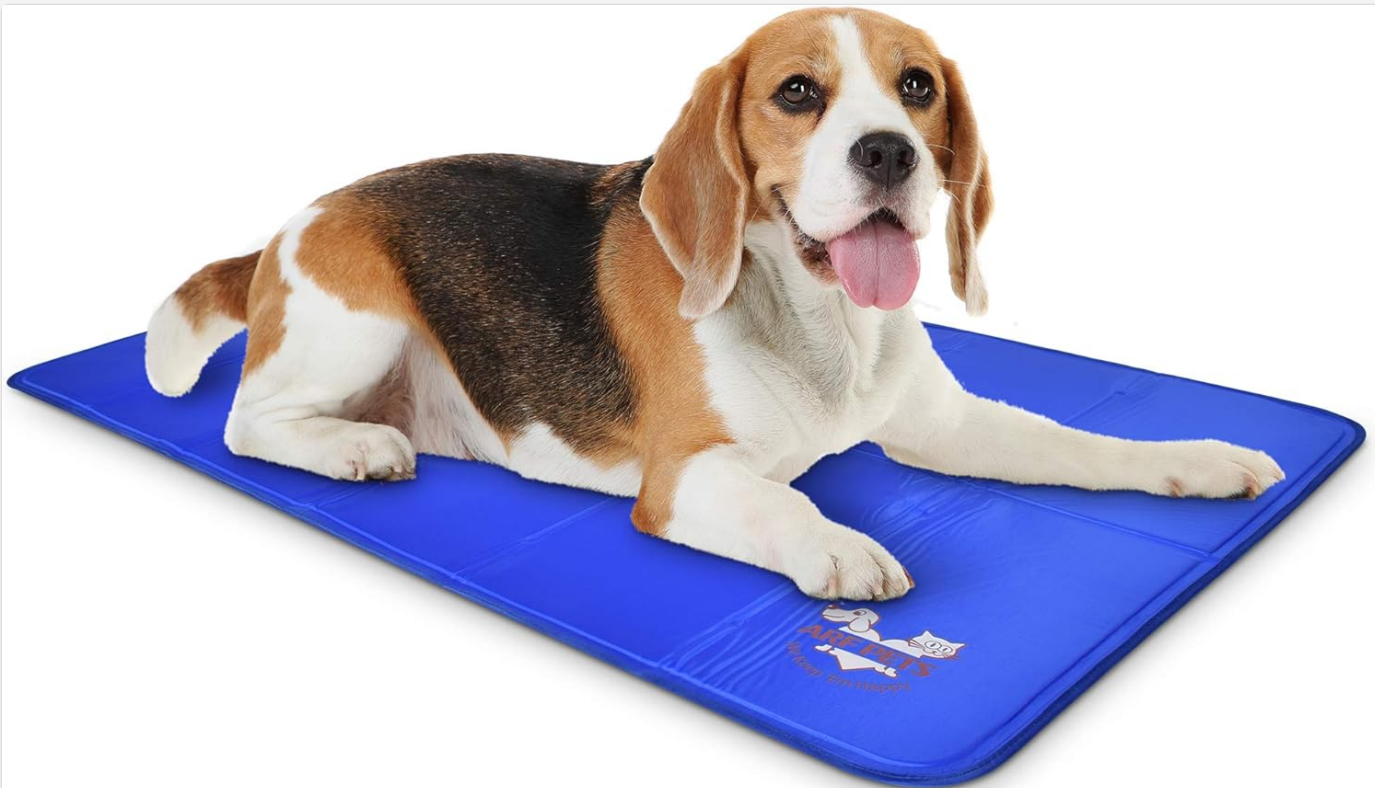
Image: A beagle dog resting on the Arf Pets cooling mat, demonstrating its use.

Thank you for choosing the Arf Pets Dog Cooling Mat. This self-cooling gel mat is designed to provide a comfortable and cool resting surface for your pet without the need for refrigeration or electricity. This manual provides essential information for the proper setup, operation, and maintenance of your cooling mat to ensure its longevity and your pet's comfort.