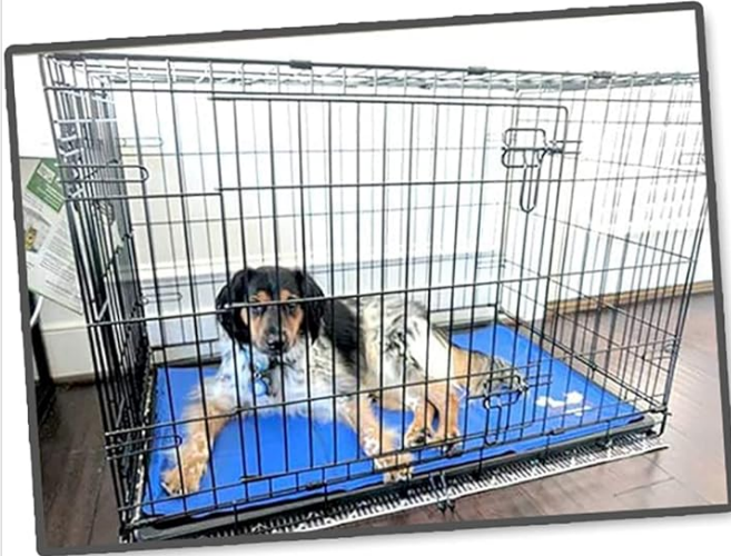
Cages or Crates