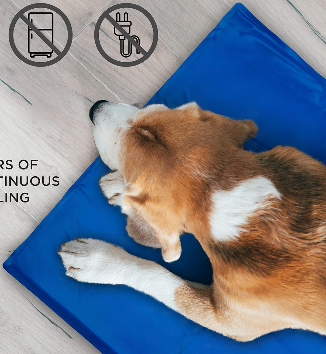
Image: Visual representation of the mat's self-cooling and recharging capabilities, highlighting no need for external power or refrigeration.