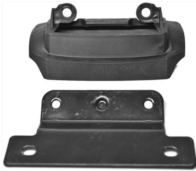
Figure 2: Kit Components. This image displays the individual components of the Thule Rapid Fixpoint Kit, including the metal bracket and the plastic base, ready for assembly.