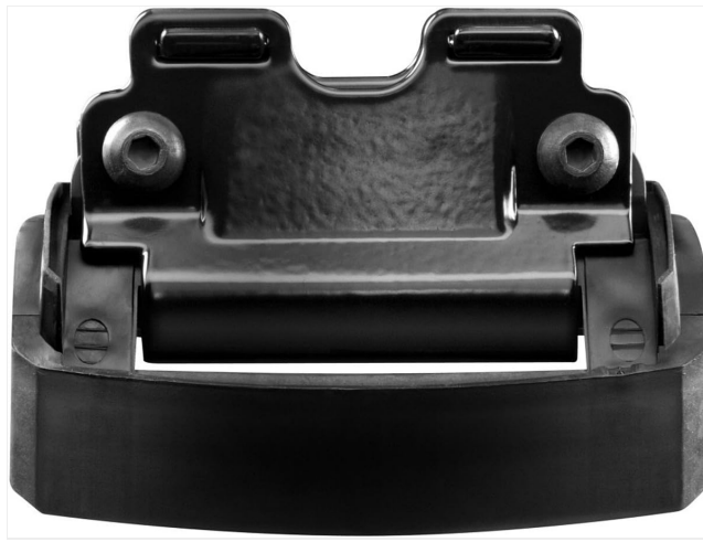
Figure 4: Assembled Fixpoint Kit. This image shows the Thule Rapid Fixpoint Kit fully assembled, demonstrating how the foot and mounting plate integrate.