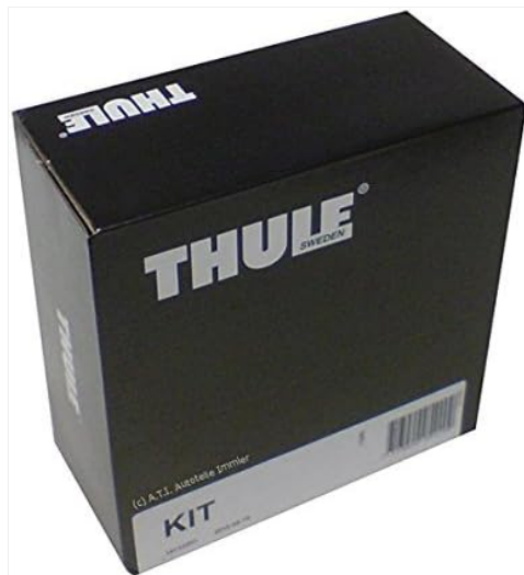
Figure 1: Thule Rapid Fixpoint Kit Packaging. This image shows the black packaging box for the Thule Rapid Fixpoint Kit, featuring the Thule logo prominently.

The Thule 183145 Rapid Fixpoint Kit is an essential component for securely attaching Thule roof bars to vehicles equipped with specific fixpoints on the roof. This kit ensures a precise and stable connection, crucial for the safe transport of cargo. It is designed to be compatible with Thule Rapid System feet 753 or 751 and is engineered for specific vehicle models, ensuring an optimal fit without causing damage to your vehicle's finish.