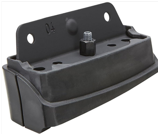
Figure 3: Rapid System Foot Component. A detailed view of one of the Thule Rapid System foot components, highlighting its design and connection points.