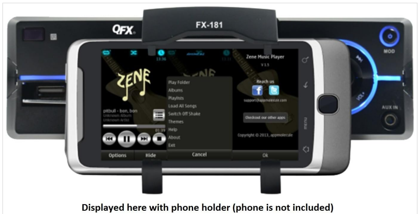
Figure 2.1: The QFX FX-181 Car Stereo shown with an optional phone holder. The phone holder is not included with the stereo unit.

The unit may include a phone holder for convenient smartphone placement. Attach the holder to the designated slot on the stereo's front panel, if available, ensuring it is stable before placing a device.