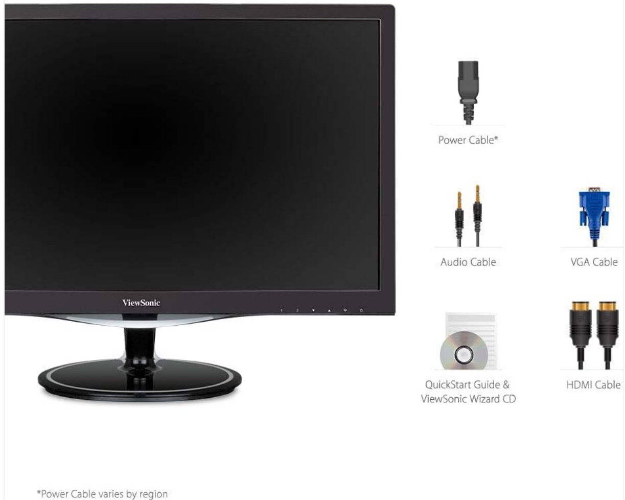
Image 1.1: The ViewSonic VX2257-MHD monitor and its included accessories, such as power, HDMI, VGA, and audio cables, along with documentation.