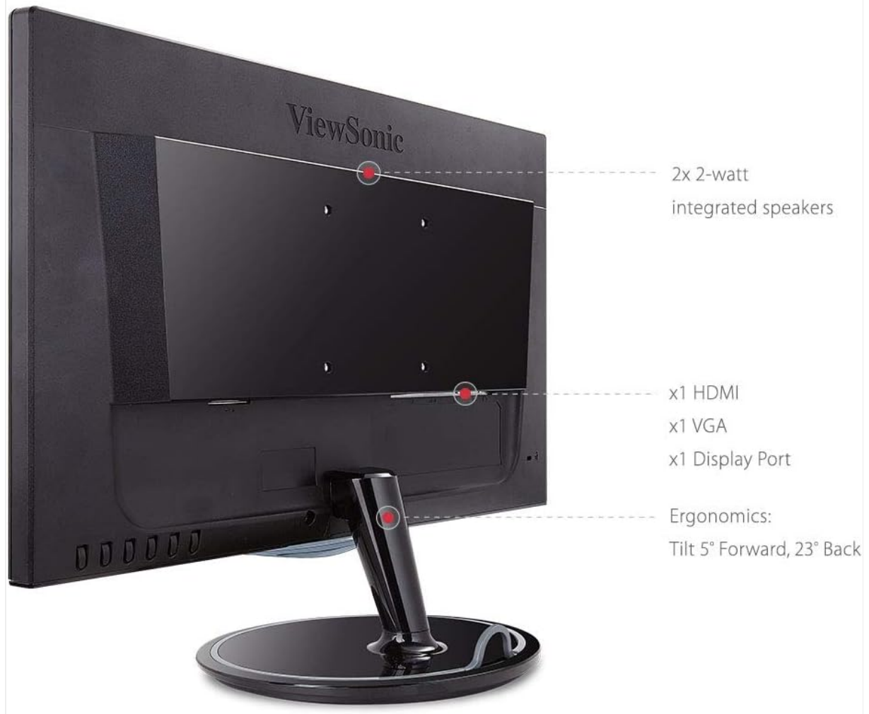
Image 1.3: Detailed view of the monitor's rear panel, highlighting the HDMI, VGA, and audio ports for connectivity.