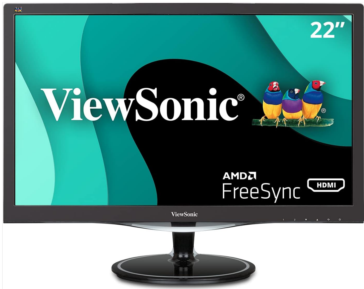
Image 1.2: The ViewSonic VX2257-MHD monitor fully assembled on its stand, ready for use.