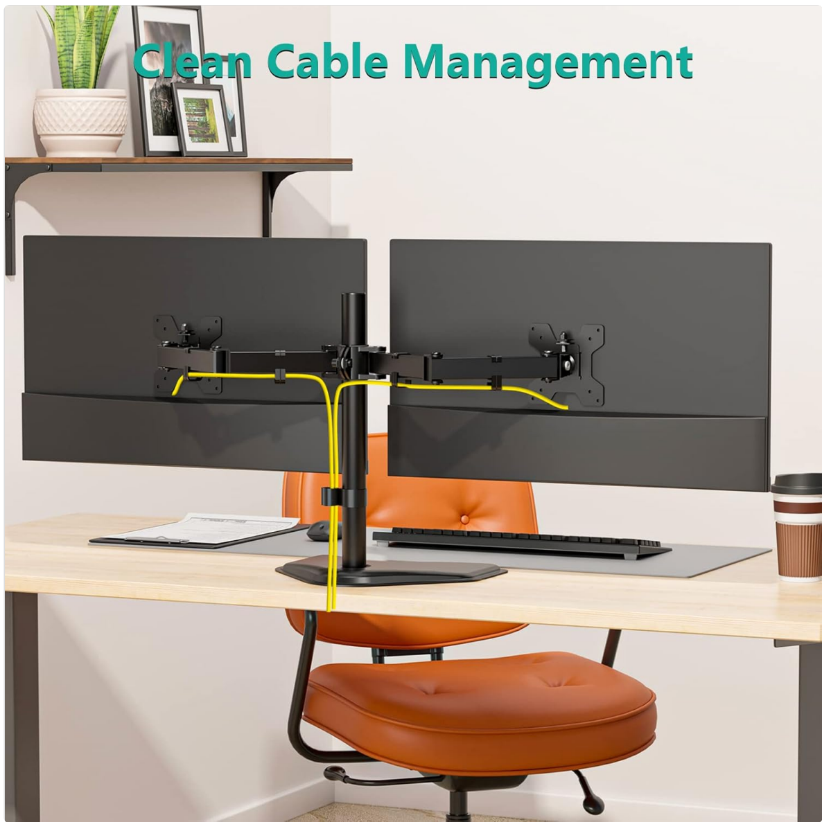
Figure 3: Clean Cable Management. Utilize the integrated cable clips to route and organize monitor cables along the arms and pole.