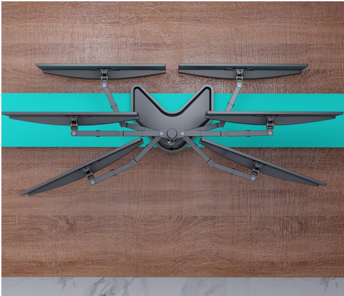
Figure 4: Monitor Placement Zone. Ensure monitors are positioned within the designated 'green zone' to prevent the stand from tipping.