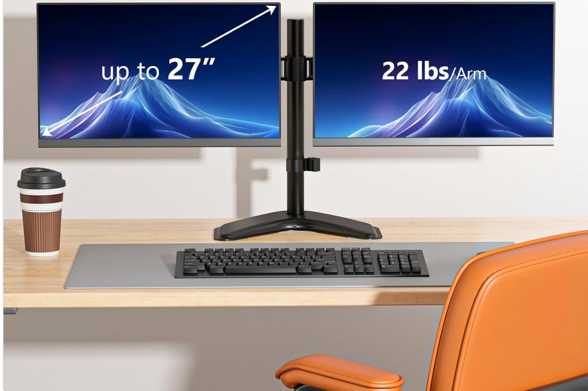
Figure 1: Display Compatibility. Supports monitors up to 27 inches, 22 lbs per arm, with VESA 75x75mm or 100x100mm mounting holes.