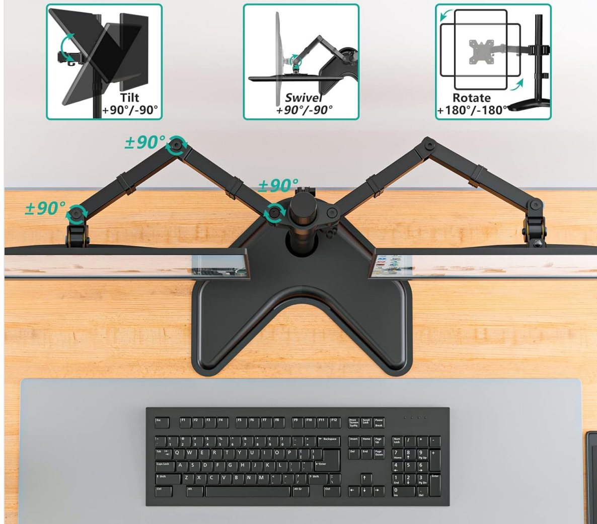
Figure 5: Angle Adjustment. Demonstrates the \pm 90^\circ tilt and swivel, and 360^\circ rotation capabilities of the monitor arms.