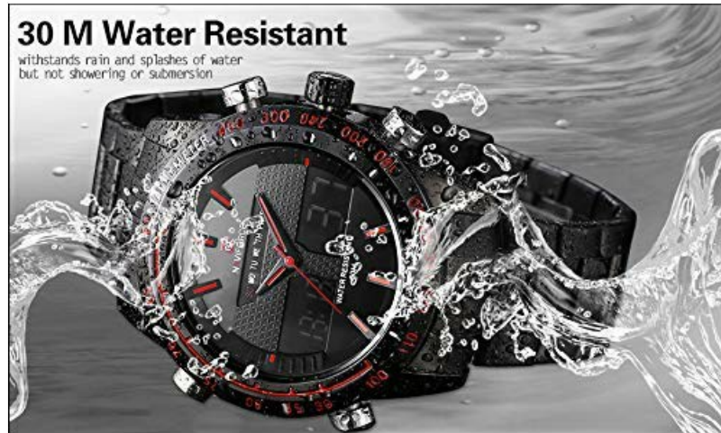
Figure 4: Illustration of the watch's 30-meter water resistance, suitable for splashes and rain, but not for submersion or showering.

This watch is water-resistant up to 30 meters (3 ATM). This means it can withstand splashes of water or brief immersion. It is not suitable for showering, swimming, diving, or any prolonged water activities. Do not operate the buttons or crown when the watch is wet.