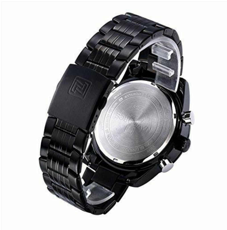
Figure 2: Rear view of the NAVIFORCE NF9024 watch, showing the stainless steel case back and metal band clasp.