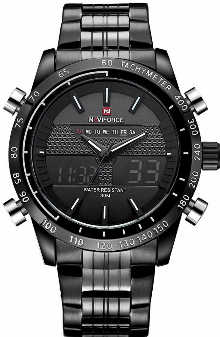
Figure 1: Front view of the NAVIFORCE NF9024 watch, showcasing its black metal design, analog hands, and digital display.