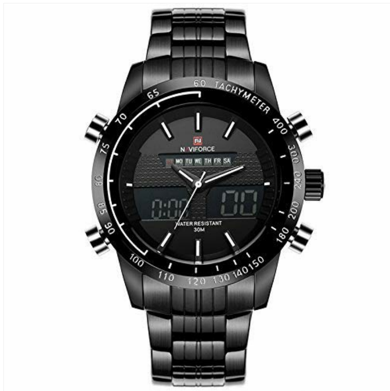
Figure 3: Digital display of the watch, illustrating the digital time and day indicators. This display is adjustable via the side buttons.