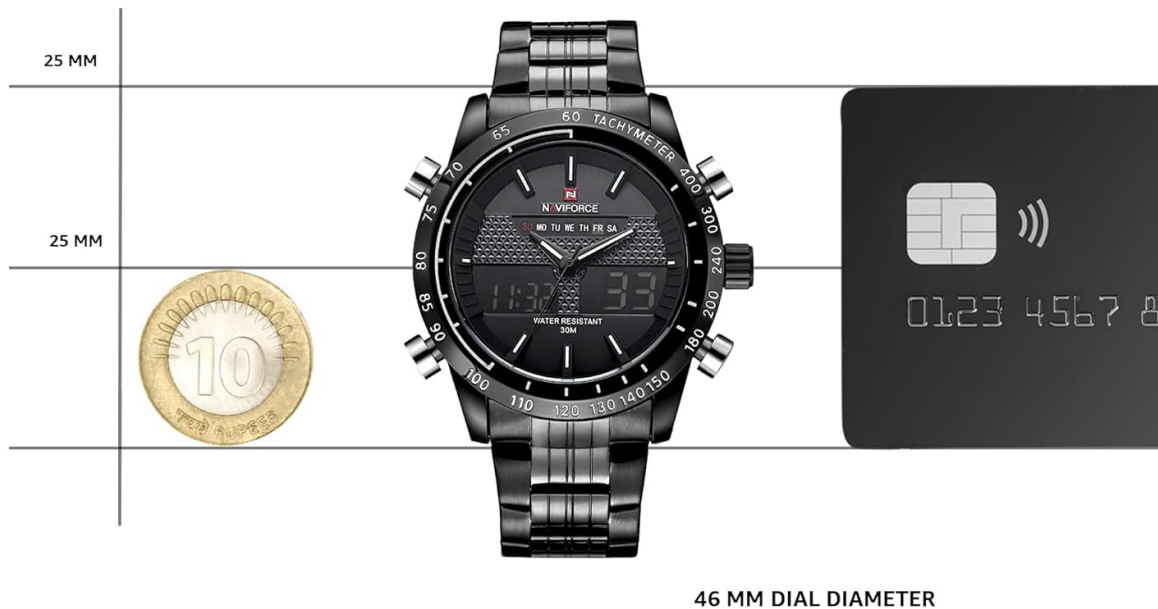
Figure 6: Visual guide illustrating the 46mm dial diameter in comparison to common objects like a coin and a credit card.