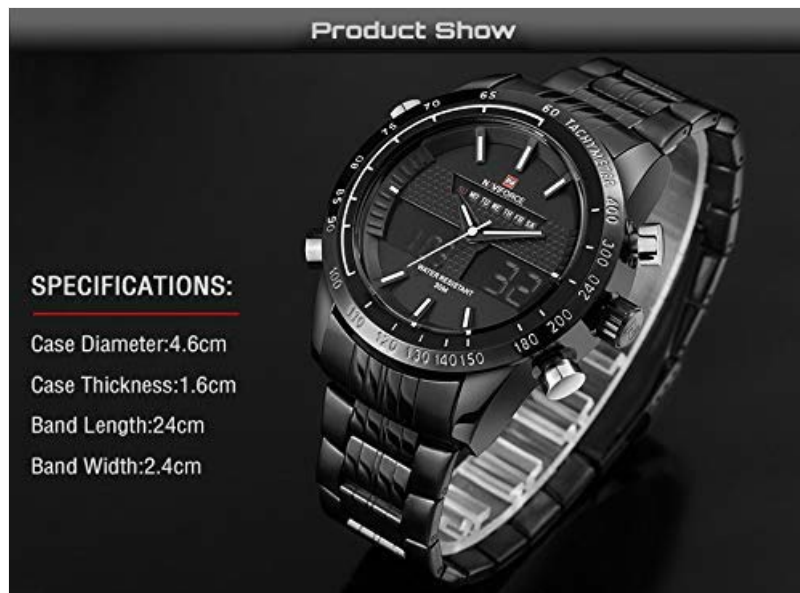
Figure 5: Product image displaying key specifications such as case diameter, thickness, band length, and band width.