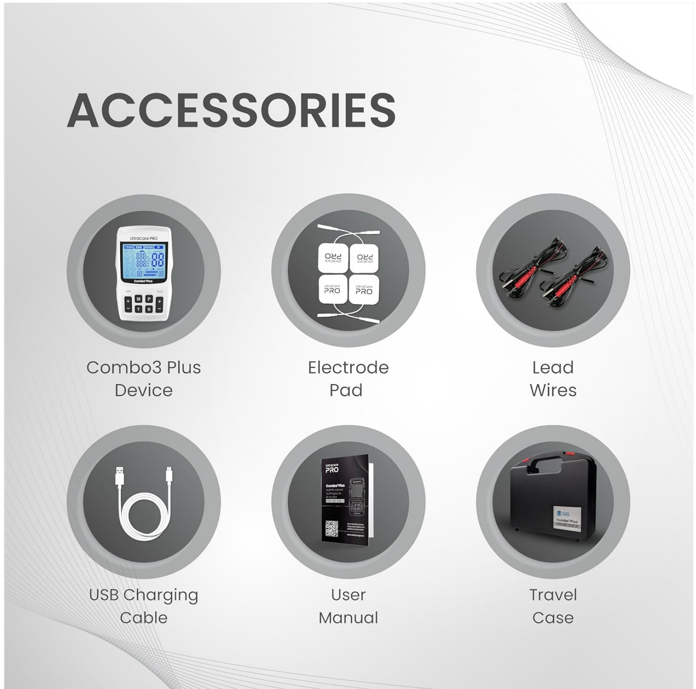
Image: A visual representation of the accessories included with the Combo3 Plus device, such as electrode pads, lead wires, and the carrying case.