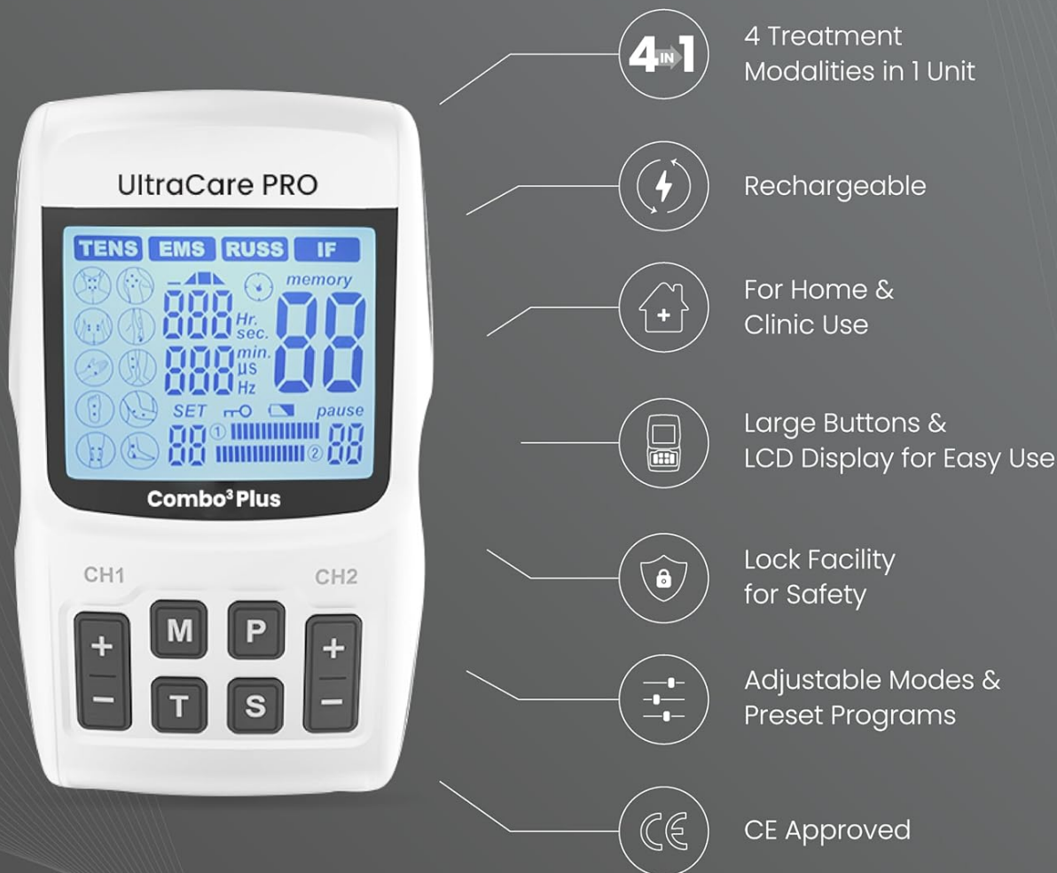
Image: An infographic detailing the key features of the Combo3 Plus, such as its 4-in-1 modalities, rechargeable nature, and large LCD display.