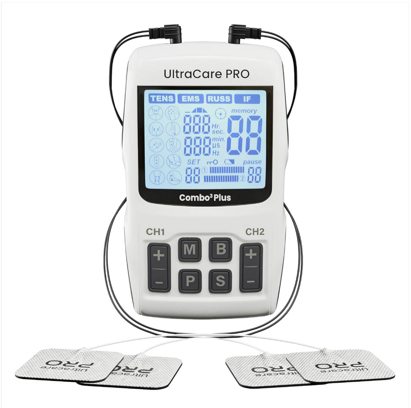
Image: The main product image showing the UltraCare PRO Combo3 Plus device with its LCD screen, control buttons, and connected electrode pads.