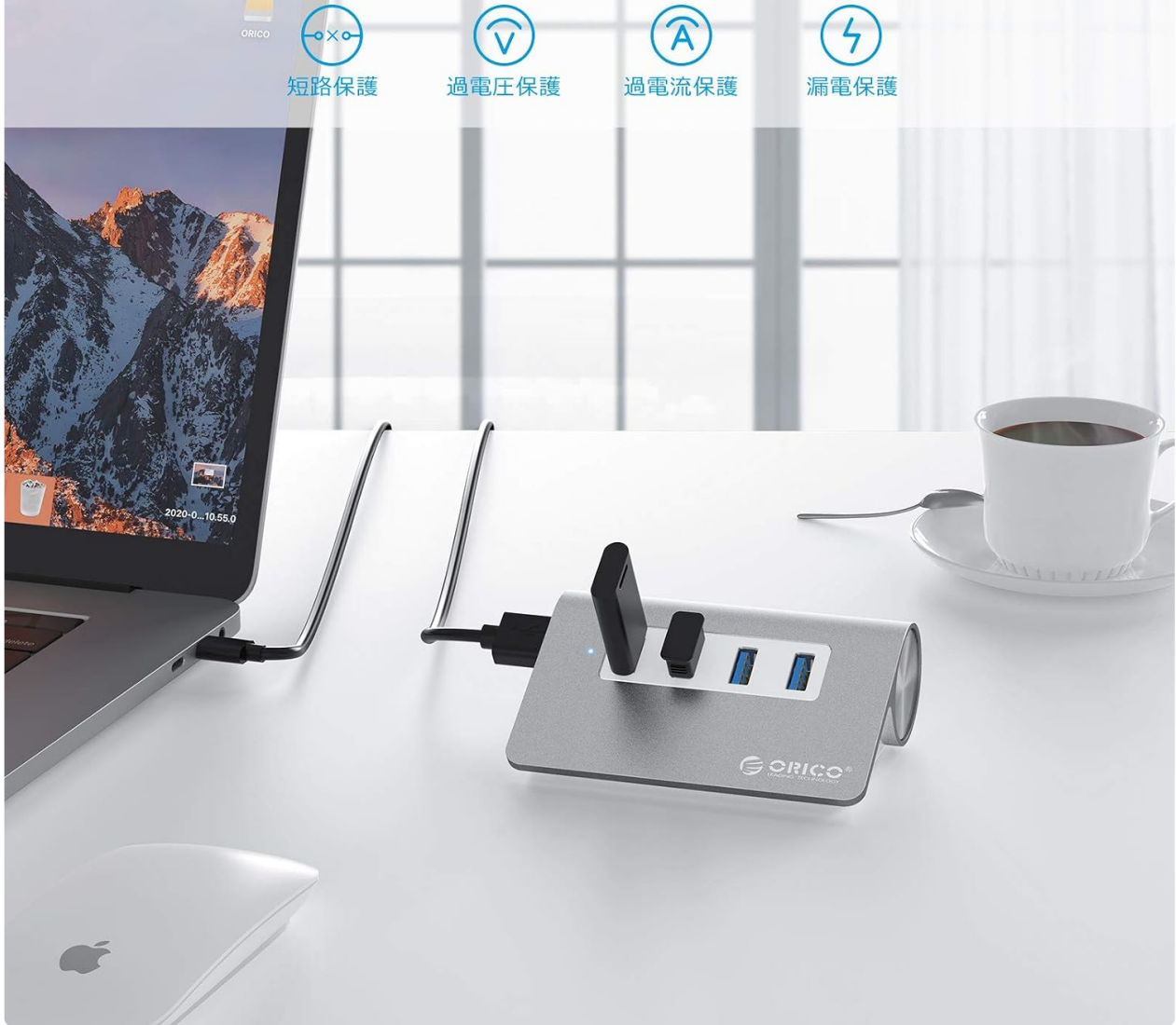
Image: The ORICO USB Hub displaying icons for its multiple protection systems: short circuit, overvoltage, overcurrent, and leakage protection.