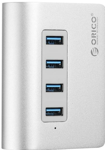
ORICO USB 3.0ハブ X1