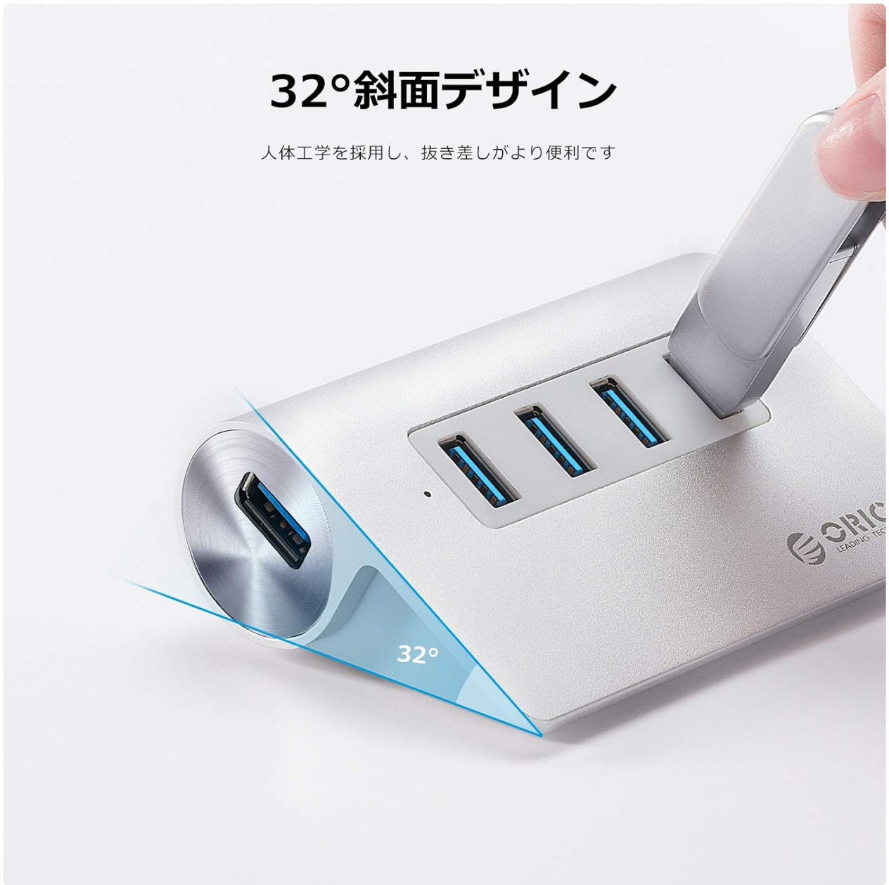
Image: A close-up of the ORICO USB Hub, illustrating its 32° inclined design for easier access to ports.