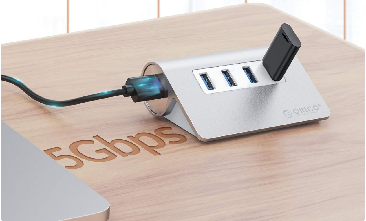
Image: The ORICO USB Hub highlighting its high-speed USB 3.0 ports, capable of 5Gbps data transfer, compared to USB 2.0's 480Mbps.