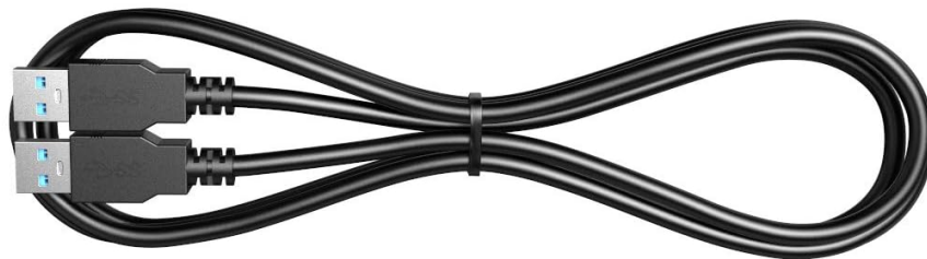
USB 3.0 ケーブル (黒) X1

Image: A visual representation of the package contents, including the ORICO USB 3.0 Hub, USB 3.0 cable, user manual, and service card.