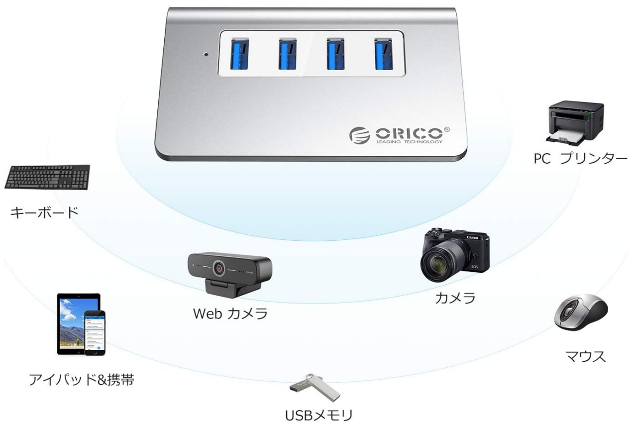
Image: The ORICO USB Hub demonstrating compatibility with a range of devices including keyboards, webcams, cameras, mice, USB memory, iPads, mobile phones, and PC printers, across Windows, macOS, and Linux operating systems.