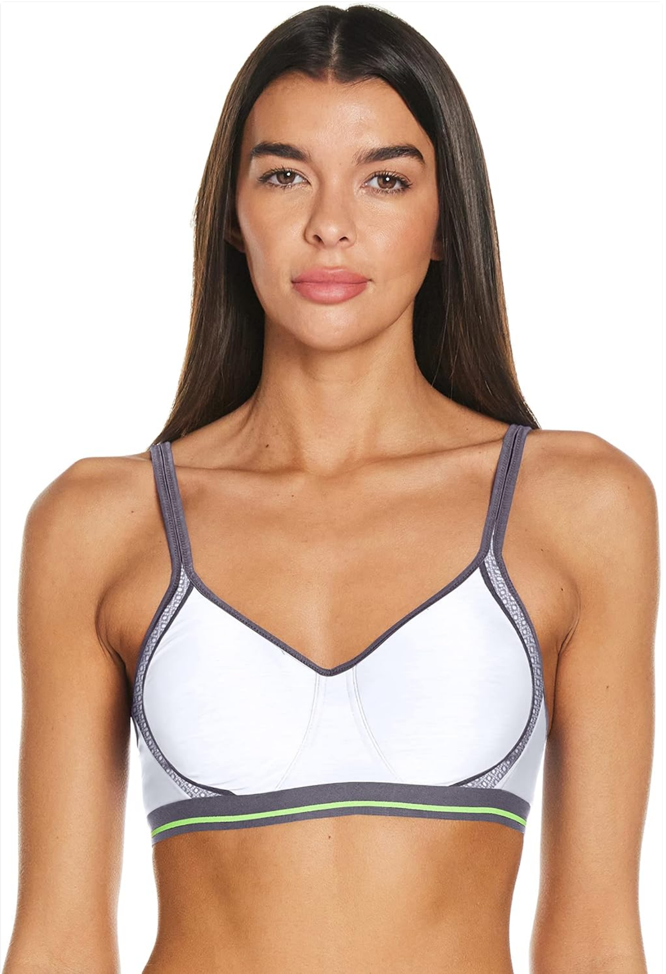
Front view of the Hanes X-Temp Foam Wire-free Bra, showcasing its wire-free design, foam cups, and adjustable straps. The bra is white with grey trim and a subtle lime green stripe along the band.