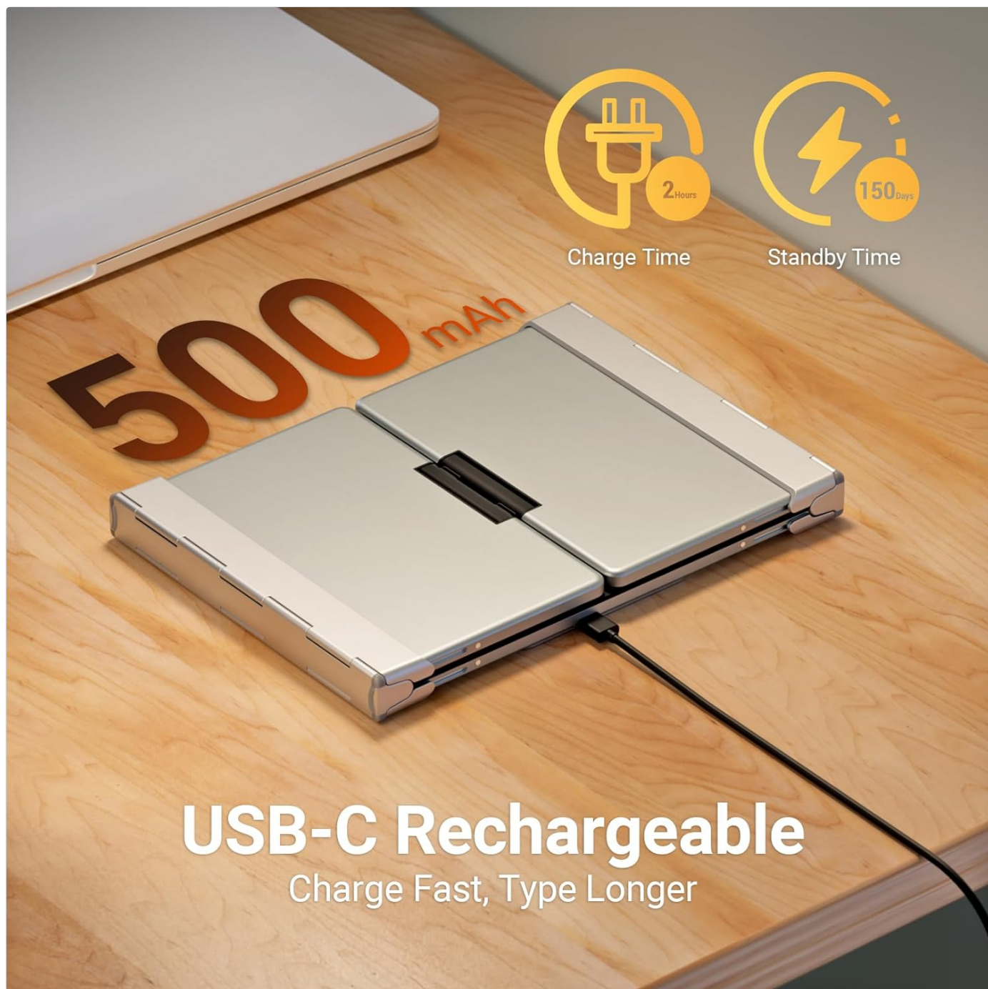
Figure 3: The iClever BK05 keyboard connected via its USB-C port for charging, indicating its rechargeable battery feature.

A full charge can last up to 5 months with 2 hours of daily usage without backlight, or up to 5 hours with continuous backlight use. The power indicator will flash when the battery is below 15%.