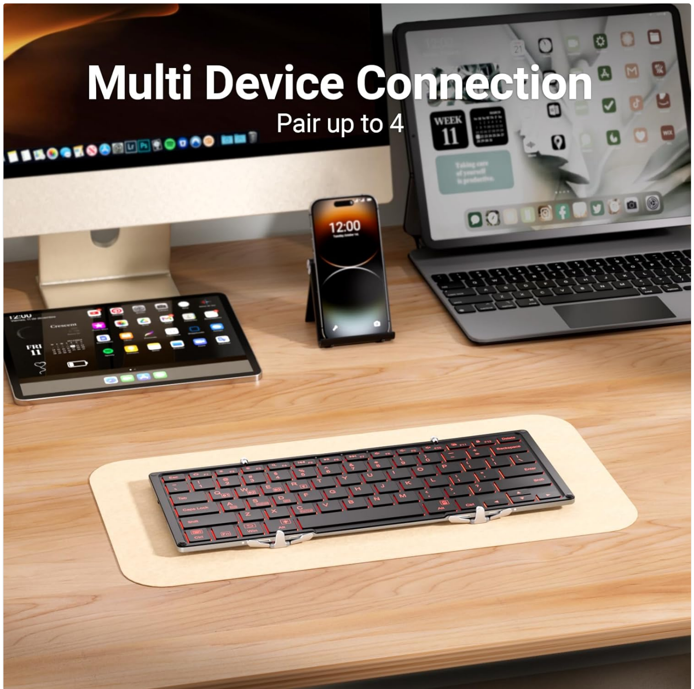
Figure 4: The iClever BK05 keyboard demonstrating multi-device connection capability, pairing with up to 4 devices including a tablet, smartphone, and laptop.

Your browser does not support the video tag.