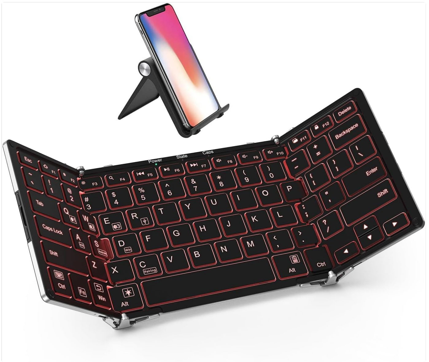
Figure 1: iClever BK05 Backlit Foldable Keyboard in its unfolded state, ready for use, with a smartphone positioned on a stand in the background.