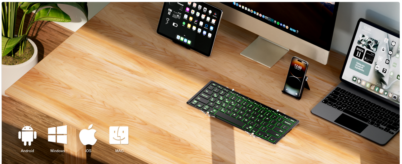
Figure 6: The iClever BK05 keyboard positioned on a desk with various devices, illustrating its wide compatibility with Android, Windows, iOS, and Mac operating systems.