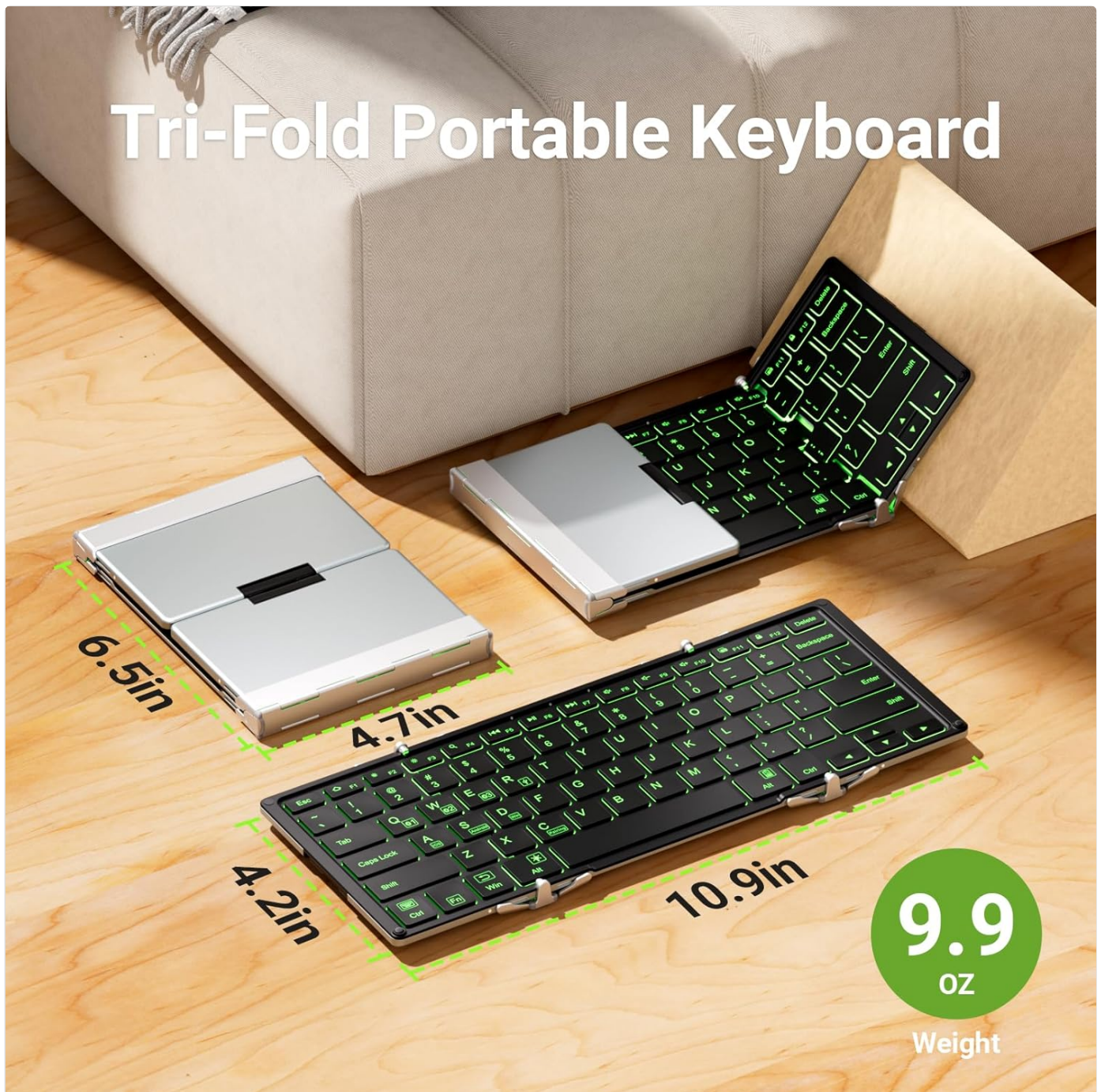
Figure 2: The iClever BK05 keyboard shown in both its folded and unfolded states, highlighting its compact dimensions (6.5in x 4.7in folded) and extended size (10.9in x 4.2in unfolded), with a weight of 9.9 oz.