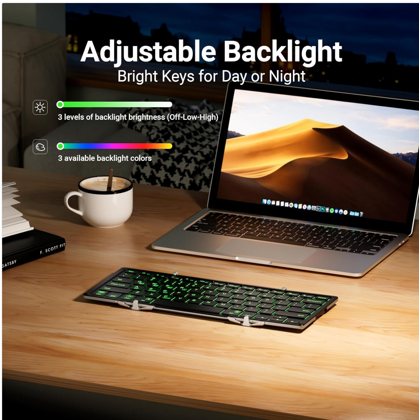
Figure 7: The iClever BK05 keyboard illuminated with a green backlight, demonstrating its adjustable backlight feature for comfortable typing in various lighting conditions.