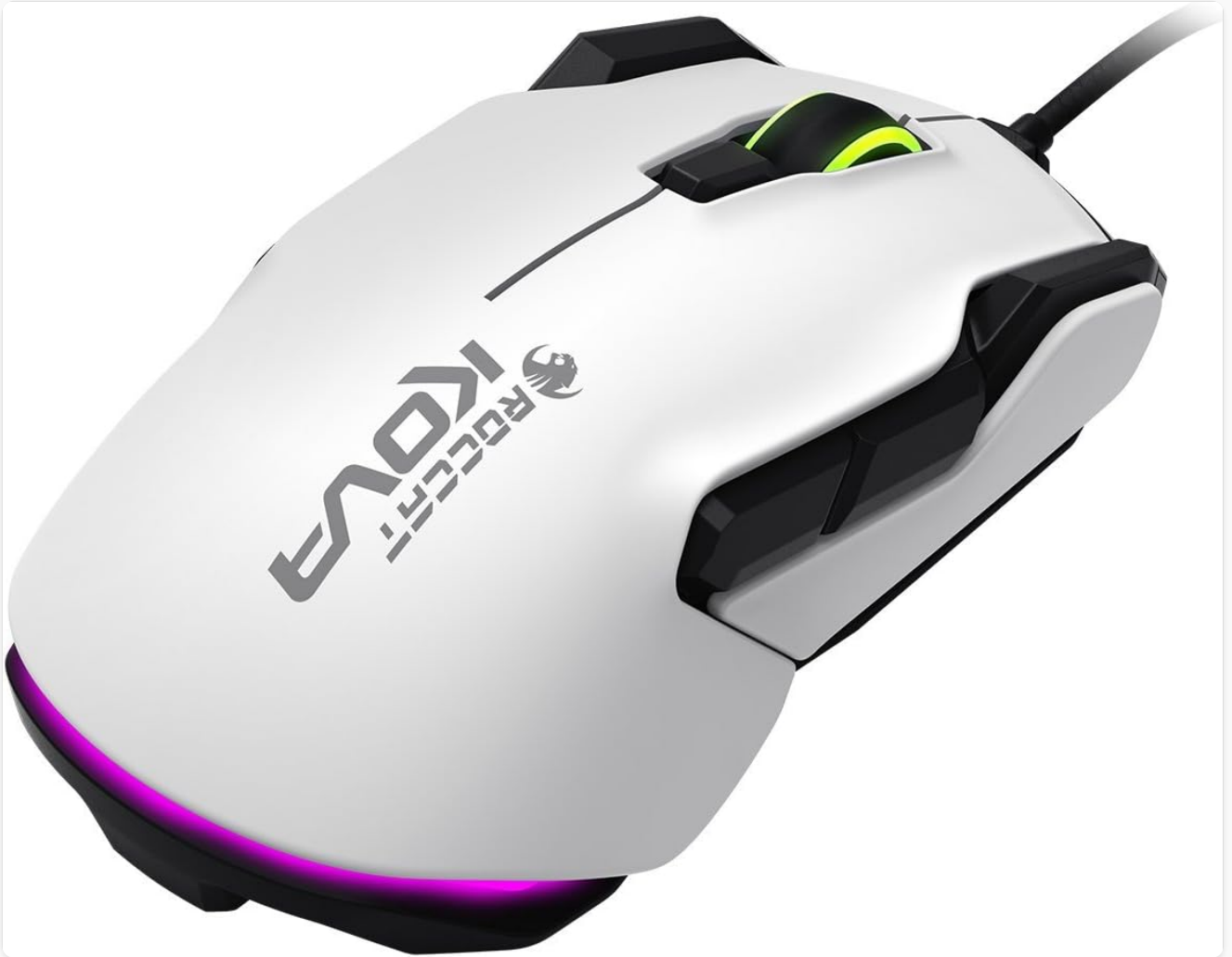
Figure 10: Top-down view of the Kova mouse with red illumination.