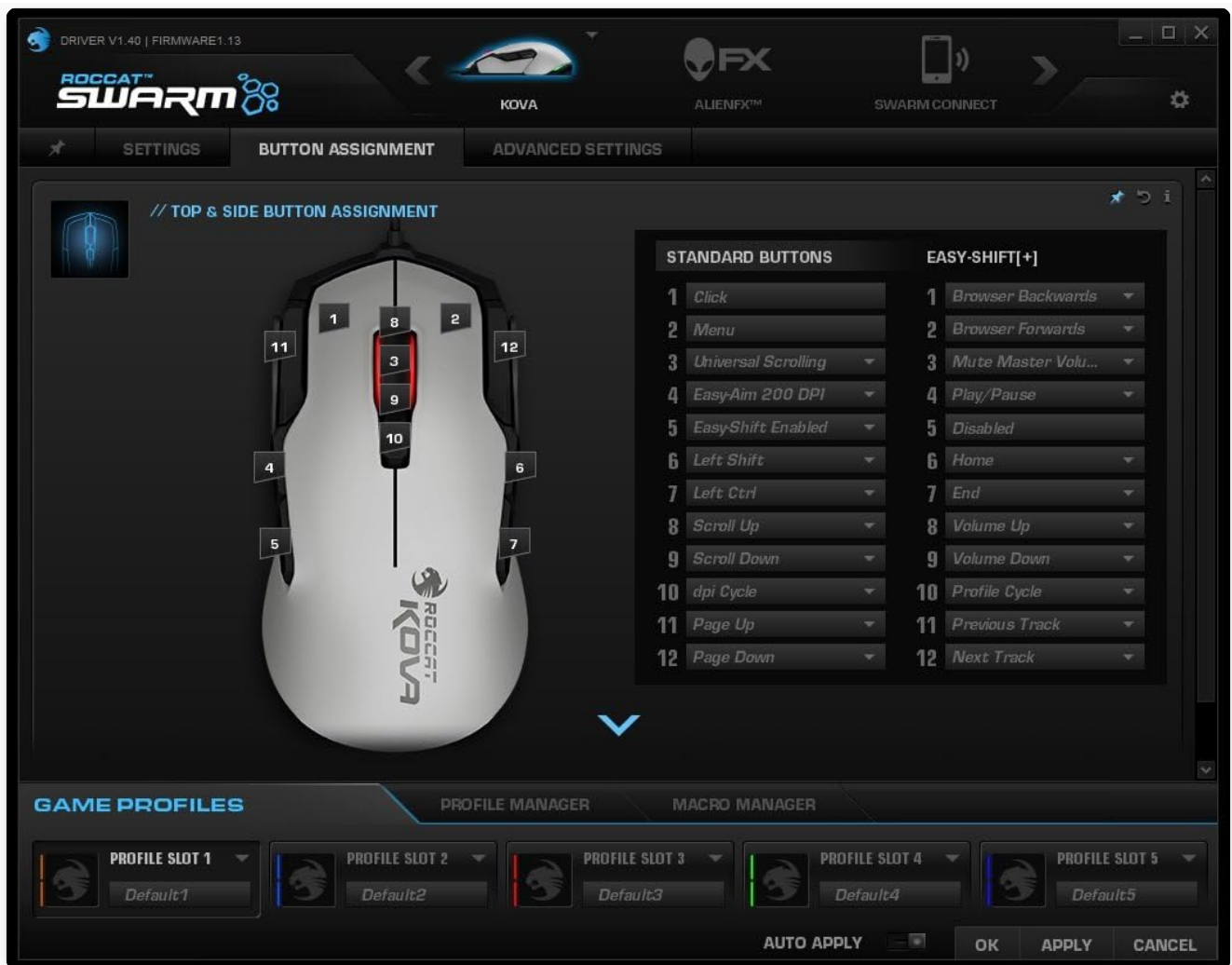
Figure 3: ROCCAT Swarm software interface, displaying the button assignment tab for customizing mouse functions.