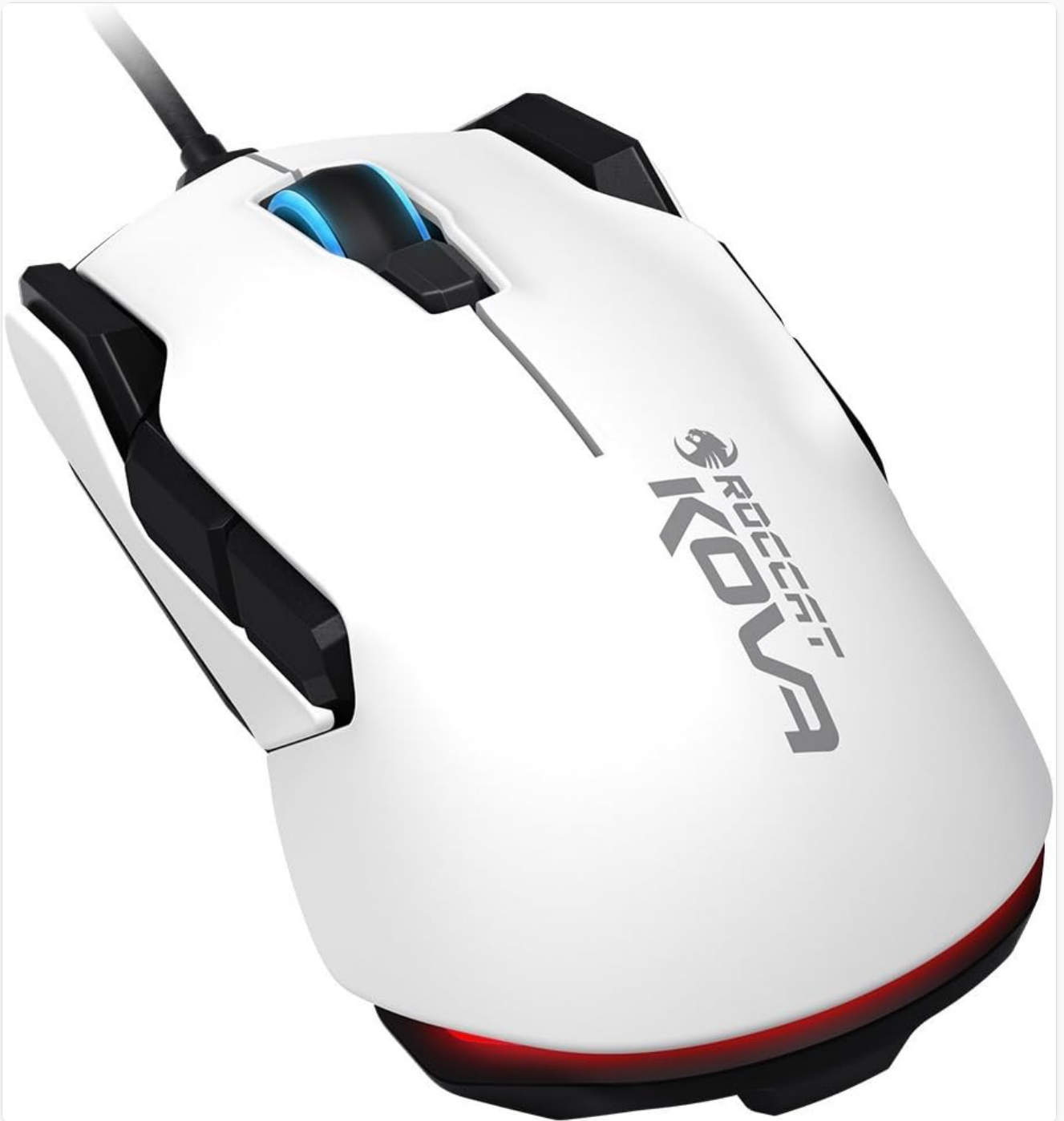
Figure 9: Rear view of the Kova mouse with blue illumination.