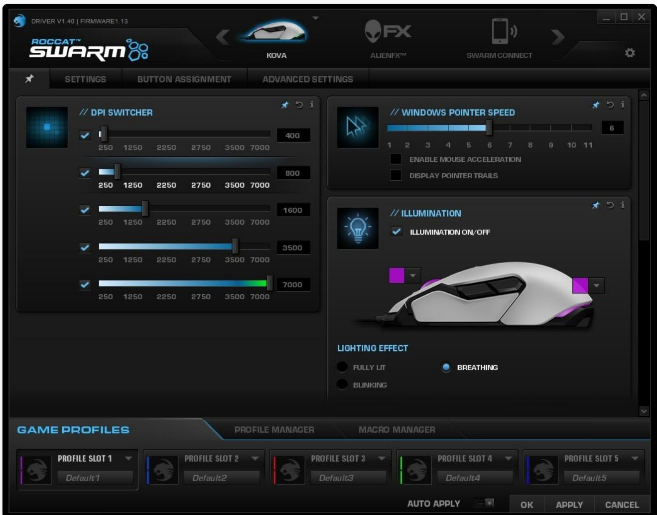
Figure 2: ROCCAT Swarm software interface, showing the settings tab for DPI, illumination, and other configurations.