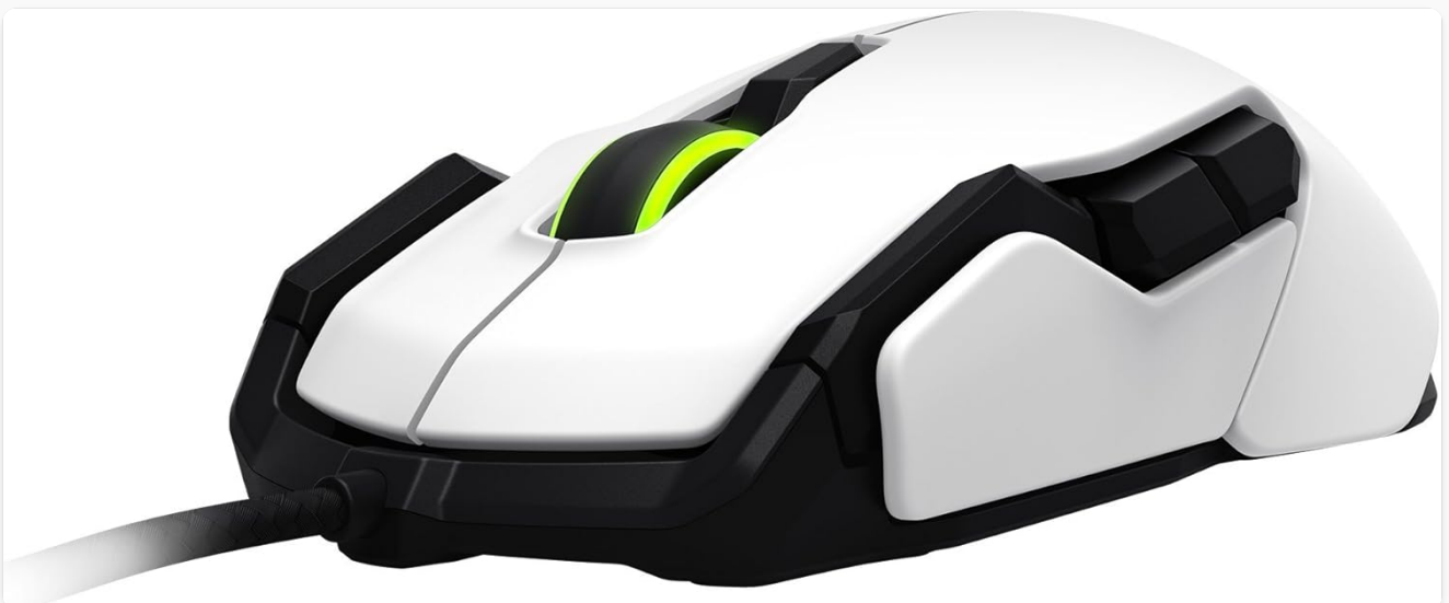
Figure 1: The ROCCAT Kova Pure Performance Gaming Mouse in White.

The ROCCAT Kova is engineered for pure performance, offering a versatile and responsive gaming experience. Its ambidextrous design ensures comfort for both left and right-handed users, while advanced features like Smart Cast and Easy-Shift[+] provide extensive customization and control. This manual provides essential information for setting up, operating, maintaining, and troubleshooting your ROCCAT Kova gaming mouse.