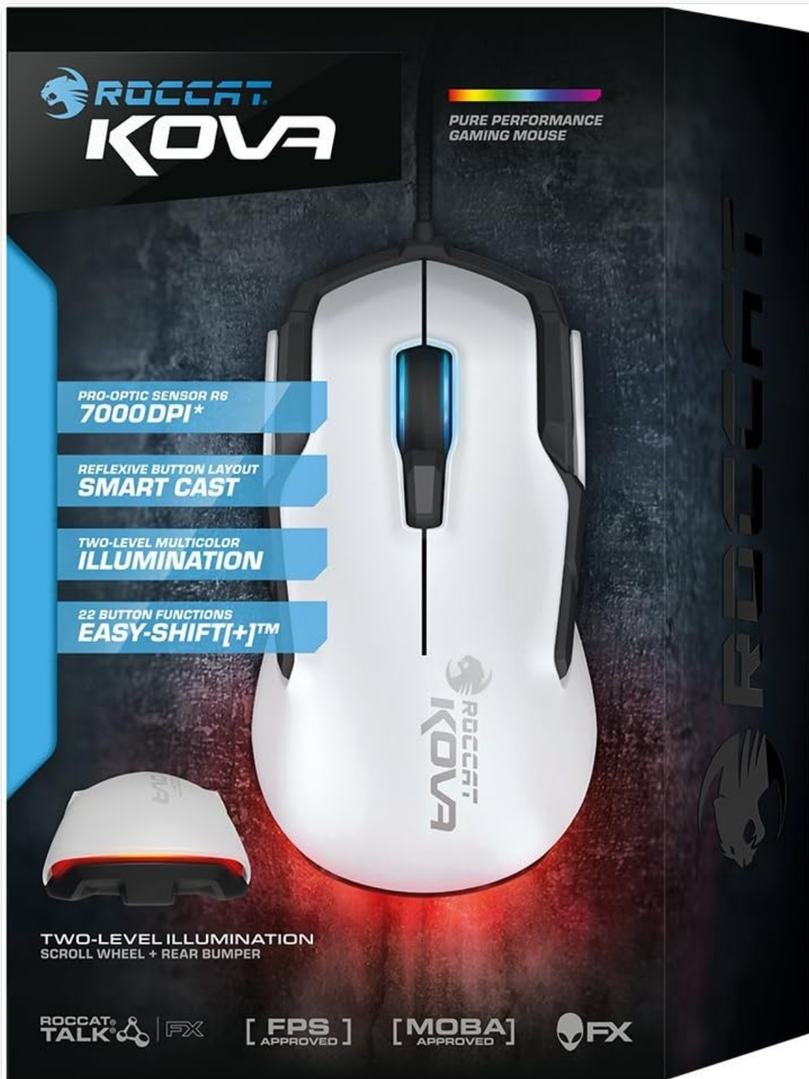
Figure 11: Top-down view of the Kova mouse with purple illumination.