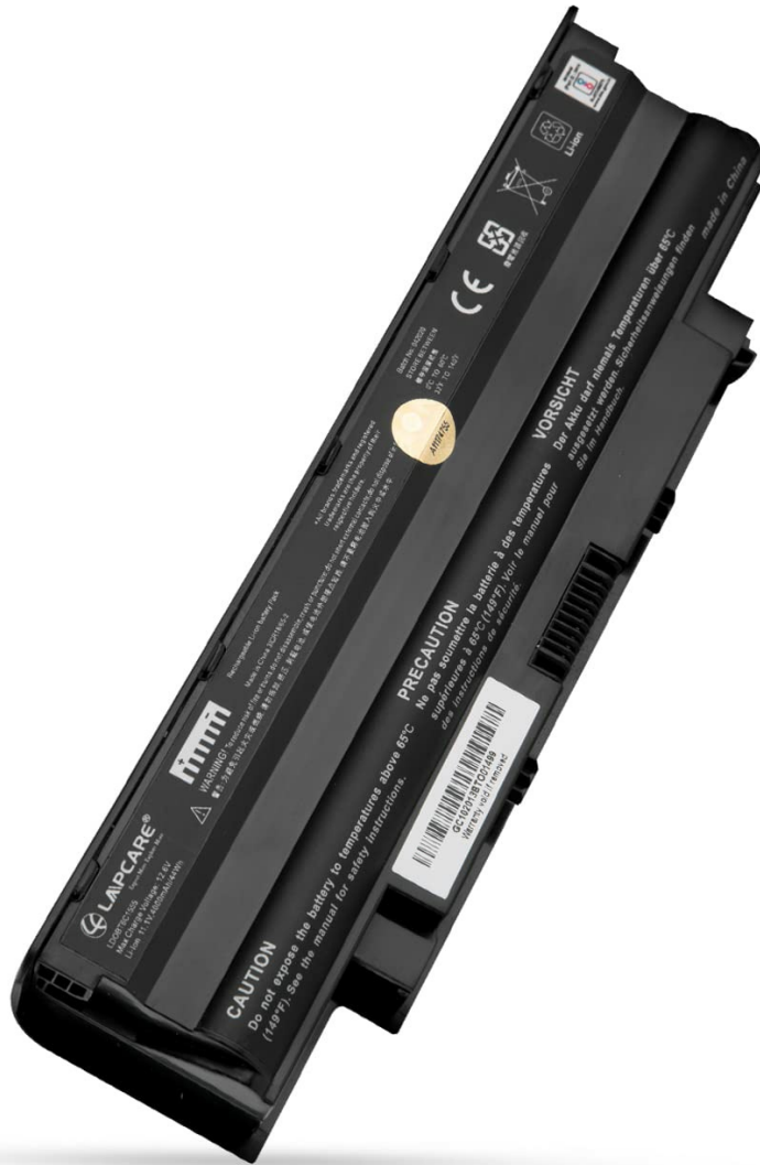
Image: The Lapcare LD0BT6C1555 laptop battery, showing its general appearance and branding.