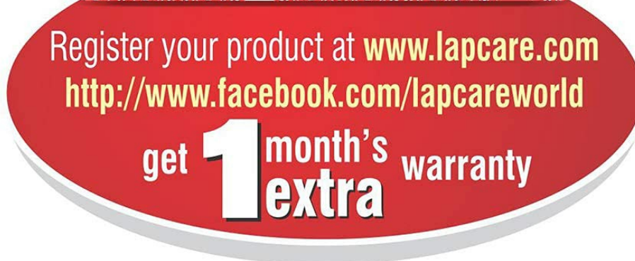
Image: Information regarding the 12-month warranty and product registration for an extended warranty.