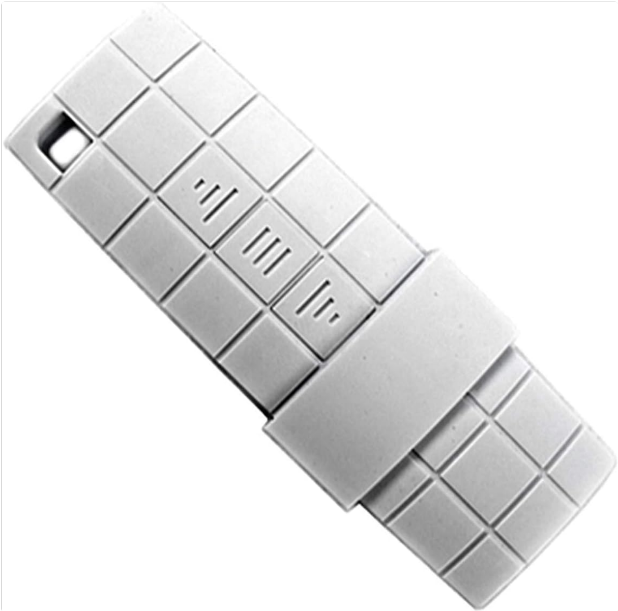
Image 1.1: The ALEKO Awning Remote Control, a white, rectangular device featuring three distinct buttons for controlling awning movement: up, stop, and down.