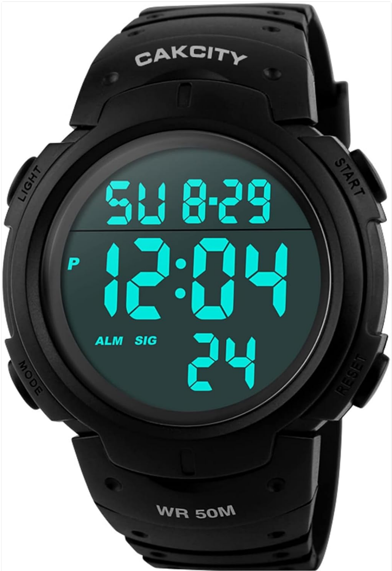
Figure 1.1: Front view of the CakCity Digital Sports Watch, showcasing its large digital display and robust design.