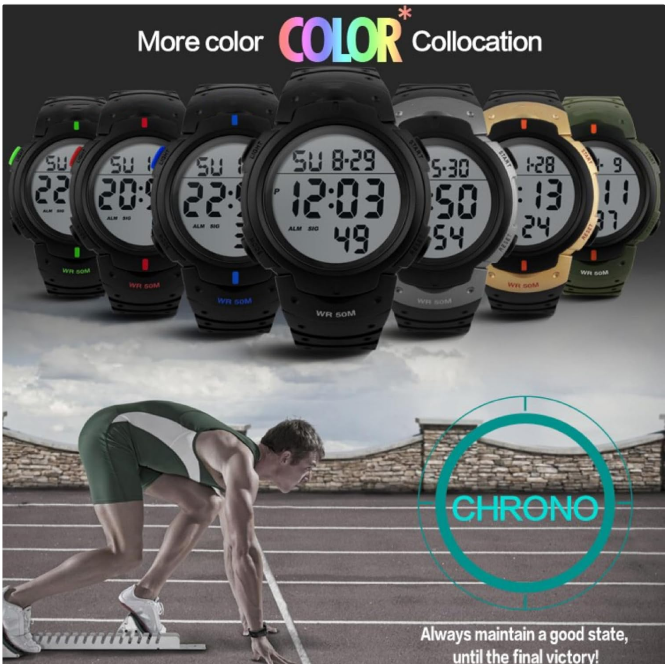
Figure 4.1: The watch is water resistant up to 50 meters, suitable for various water activities but not deep diving.

Your watch is water resistant to 50 meters (164 feet). To preserve its water resistance, do not press any buttons while the watch is submerged in water . Avoid exposing the watch to steam or hot water, such as in showers or saunas, as this can compromise the waterproof seals.