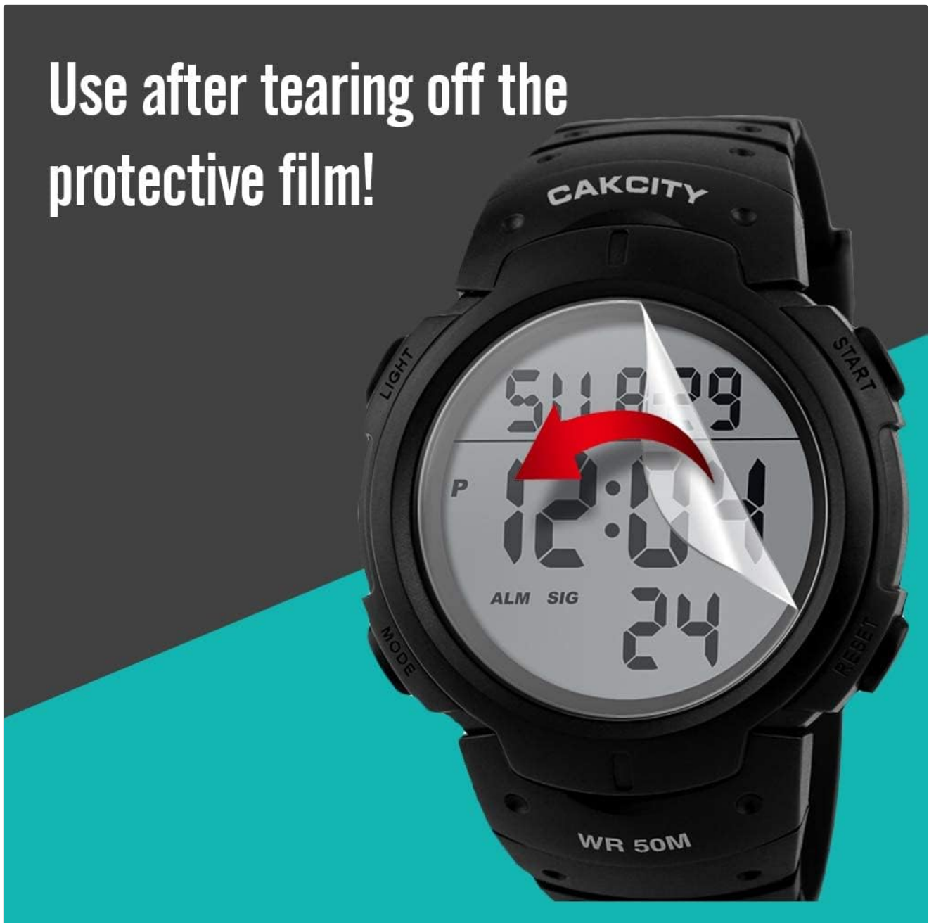
Figure 2.1: Remove the protective film from the watch face before use.

Before first use, ensure you remove any protective film from the watch face. This film is applied during manufacturing to prevent scratches during transit.