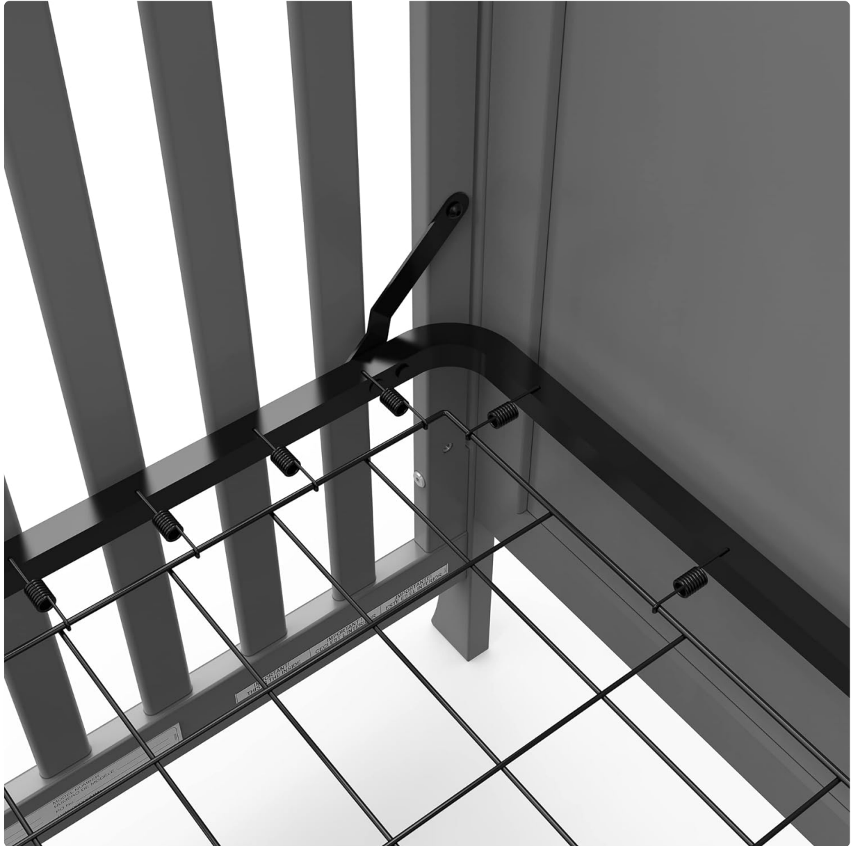
View of the metal mattress support system with springs, showing its attachment within the crib frame.

Before beginning, ensure all necessary components are present. The package includes all necessary components for the crib configuration. Conversion kits for toddler and full-size beds are sold separately.