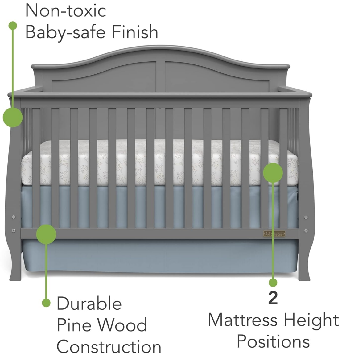
Image showing the crib with an overlay indicating compatibility with the F09514 Toddler Rail, sold separately.