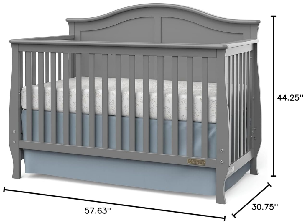
Diagram showing the assembled dimensions of the crib: 57.63 inches L x 30.75 inches W x 44.25 inches H.