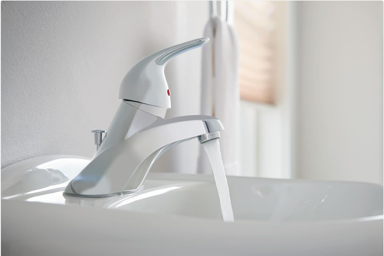
Figure 3: Faucet in Operation. A close-up view of the Moen WS84503 faucet with water flowing, demonstrating its low arc design and single-handle operation.