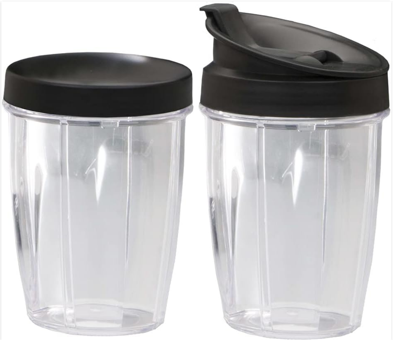
Image 3.3: The two blending cups shown with their respective lids, including a 'to-go' lid.