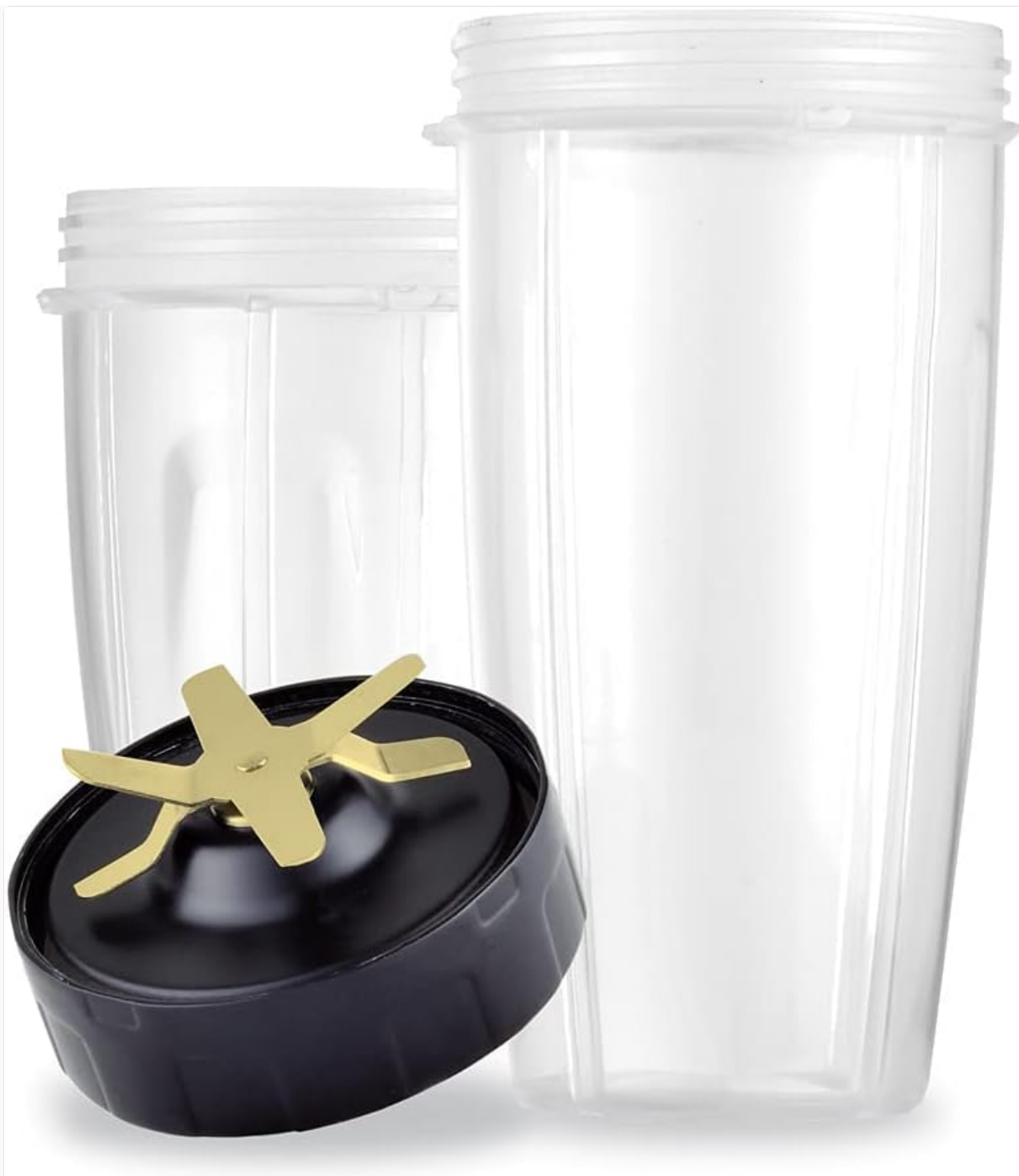
Image 3.2: The two BPA-free Tritan blending cups and the 6-blade assembly.