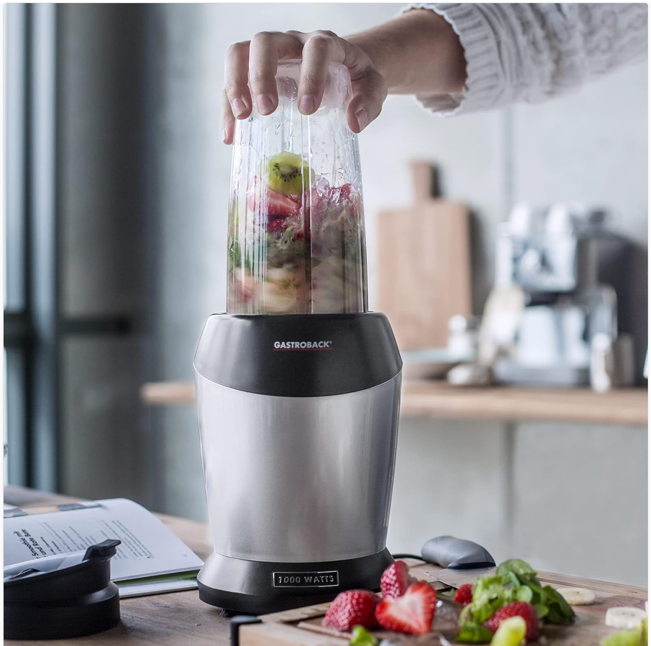
Image 5.2: Securely placing the blending cup with blade assembly onto the motor base.