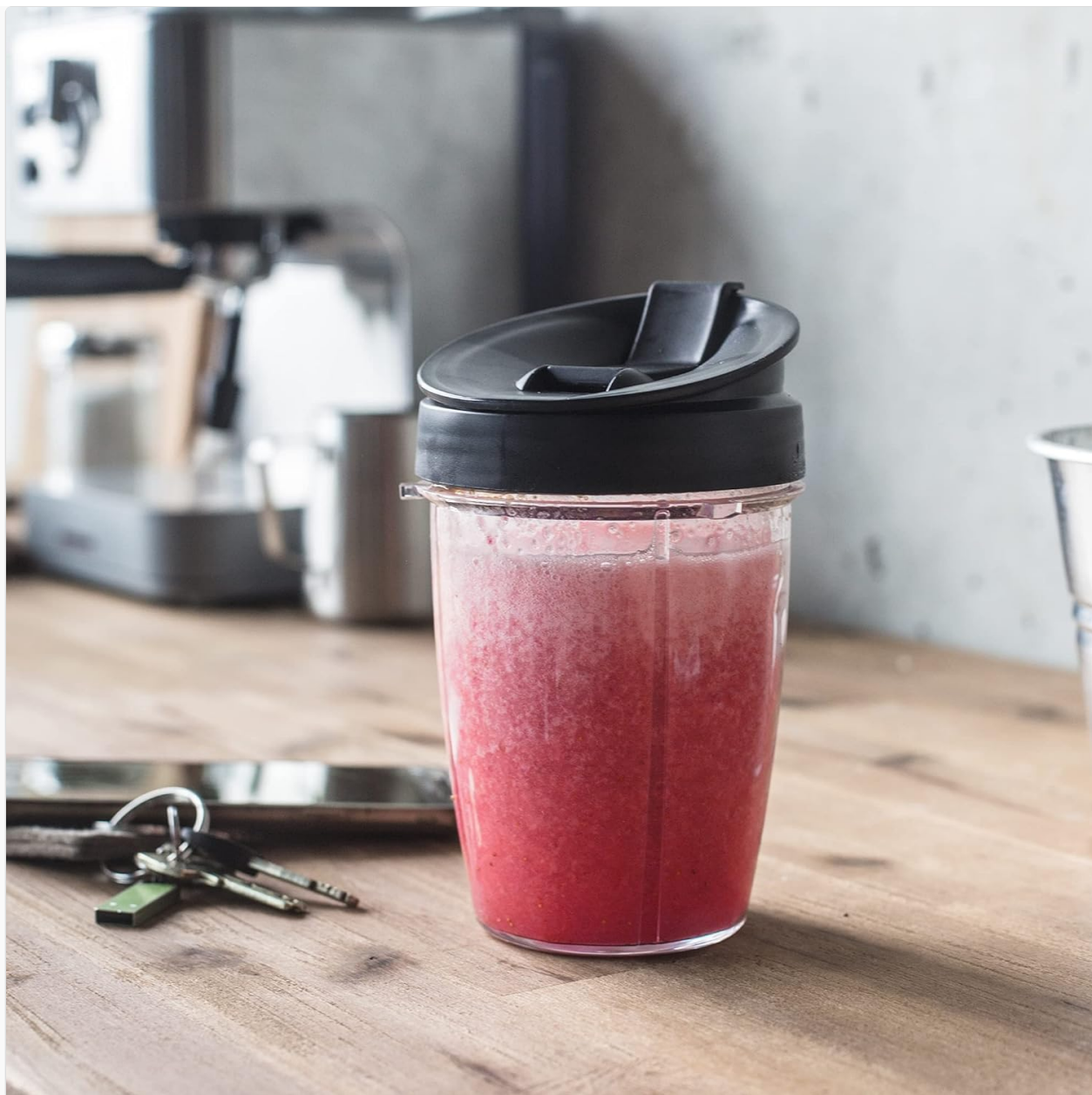
Image 5.3: A freshly prepared smoothie ready for consumption with the 'to-go' lid.