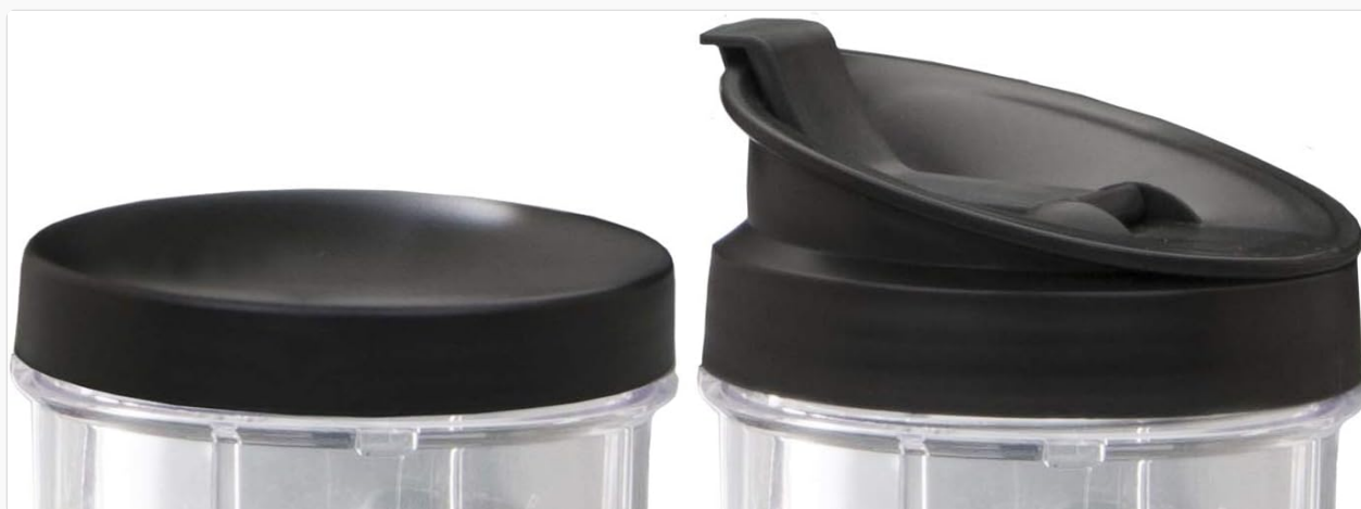
Image 5.4: Close-up view of the two types of lids provided: a storage lid and a 'to-go' lid with a drinking spout.